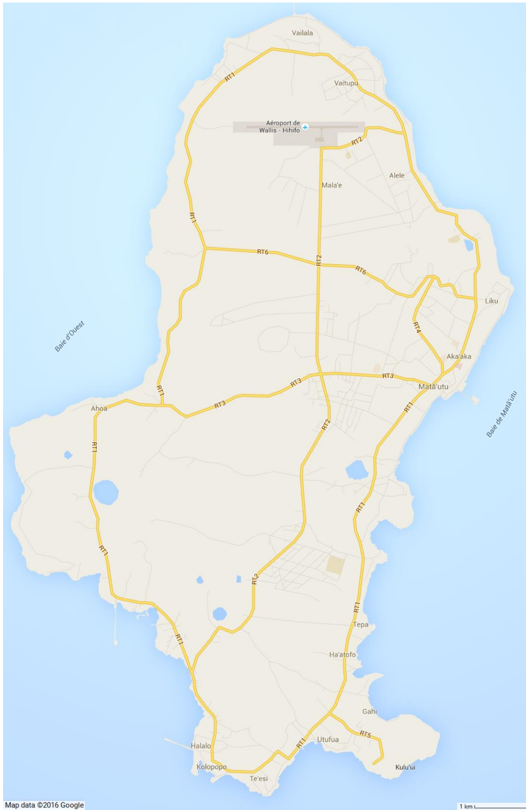
Figure 1: A map of Wallis island (Google Maps 2016)