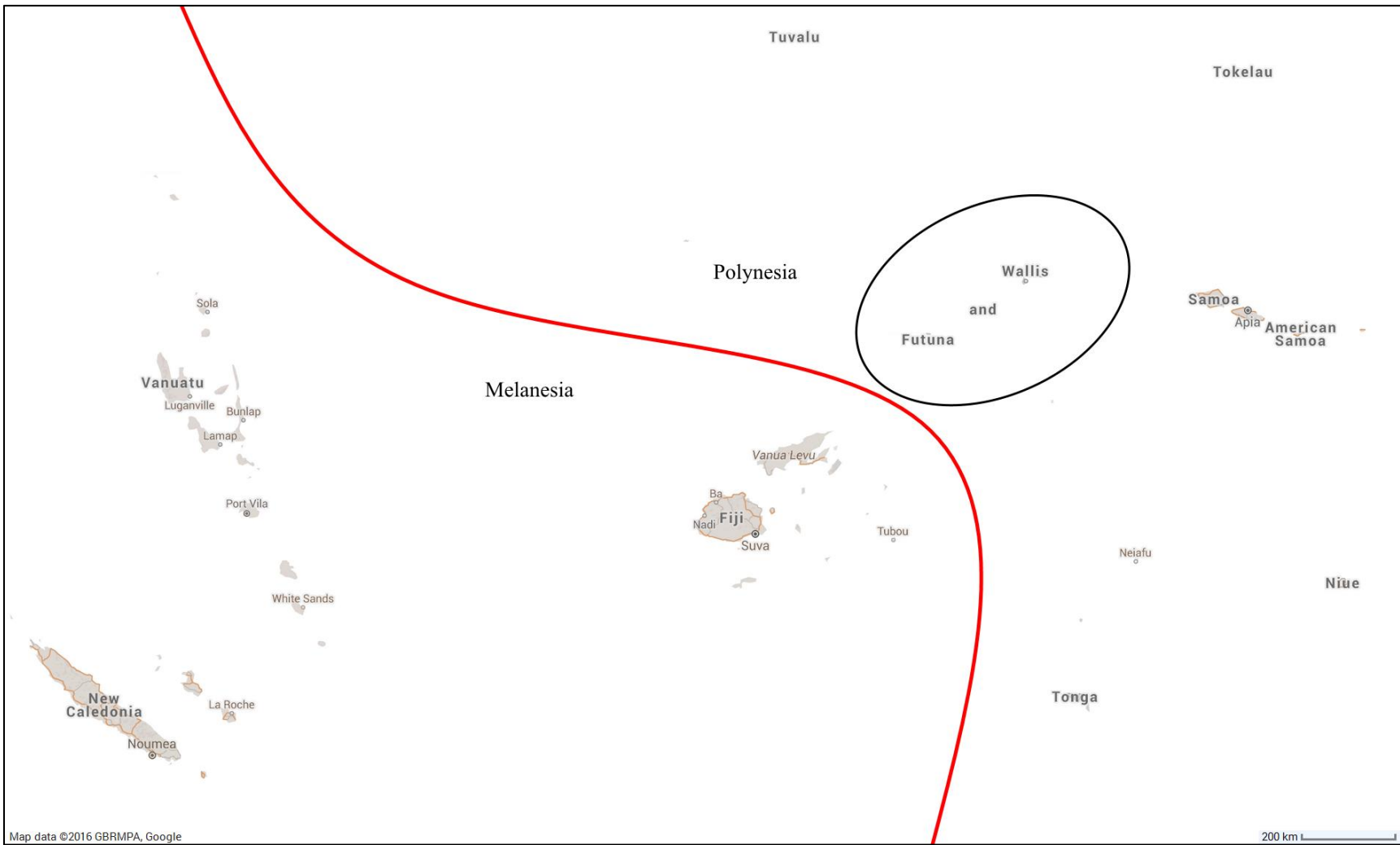
Figure 2: Central Pacific, with Wallis and Futuna, overseas collectivity of France, circled; Melanesian and Polynesian cultural spheres delimited, (GBRMPA and Google 2016)