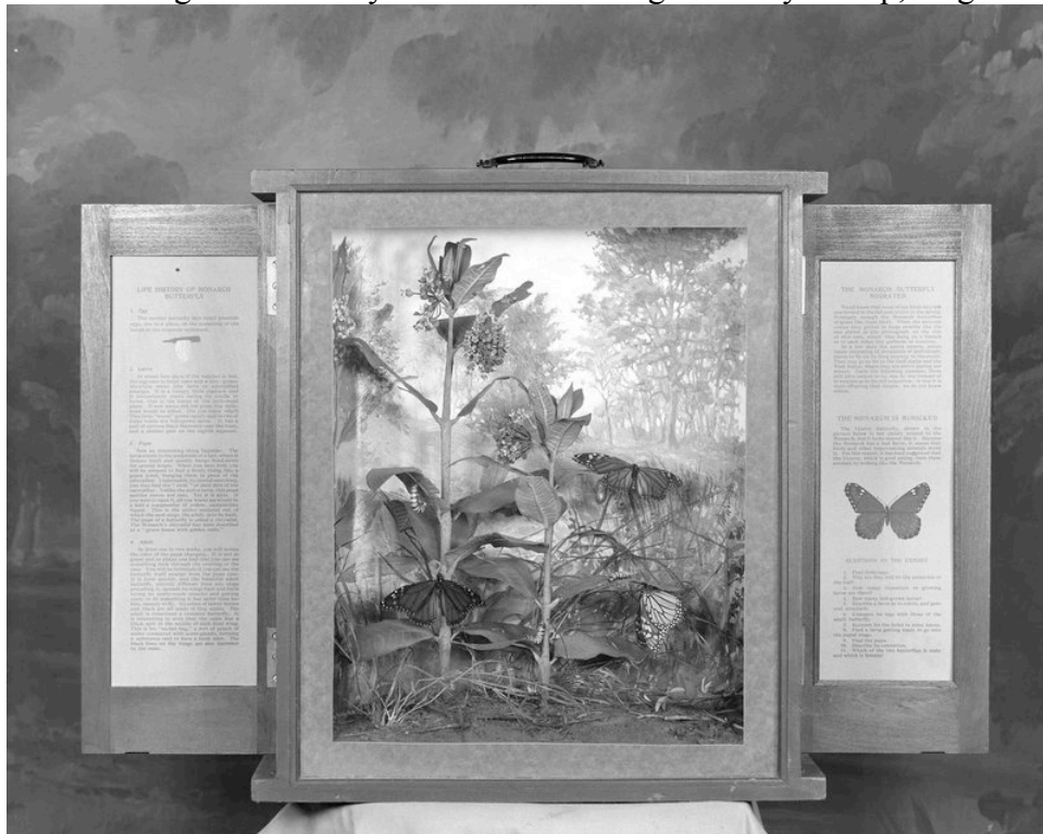
Figure 1 Circulating Nature Study Collection showing Butterfly Group, August 1927