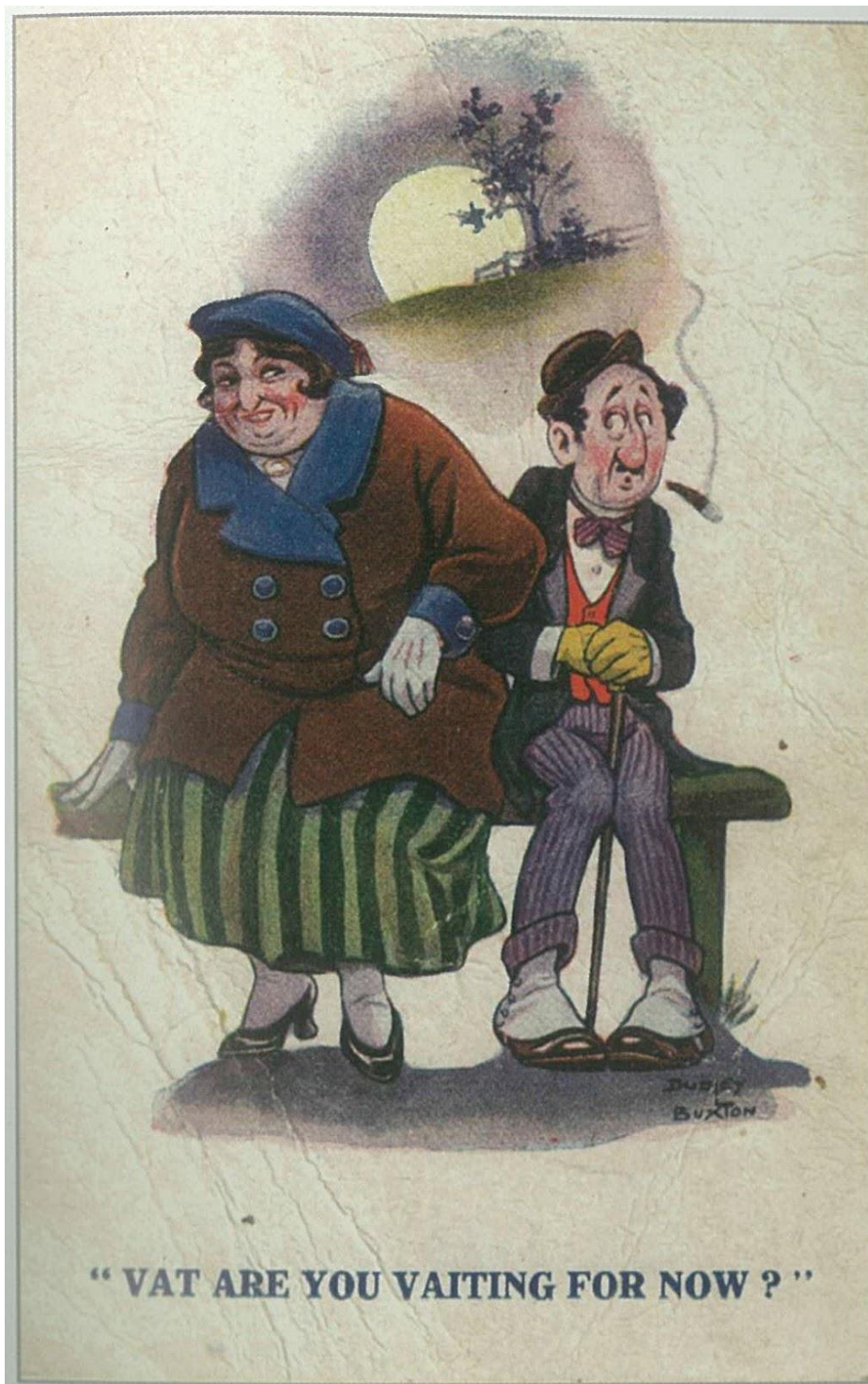
Figure 2: Vat Are You Vaiting For Now? Postcard. Author and Date Unknown. A Jewish wife, lacking prototypical femininity, nags and dominates her meek husband.

The caricatured Jew in Figure One shares a stereotypically large nose with the man presented in Figure Two, although an inconsistency exists in the extent of the luxury his clothing