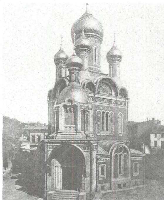
A postcard of a Russian Orthodox church in Bucharest around 1924.