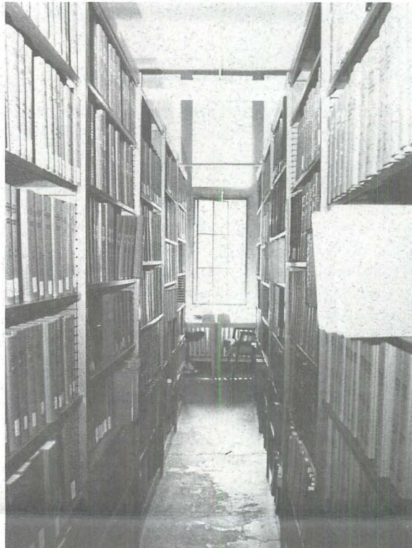
A view of the crowded shelving in the old Physics Library.

The new library can house 35,000 volumes which represents a 40% increase over the capacity of the former location. There is 50% more seating, most of it along the windows to take advantage of the great views and natural lighting . Particularly noteworthy is the colorful diamond pattern that graces the covered ceiling in the library's journal display area and reading room. It is a trademark of the architect Cesar Pelli.