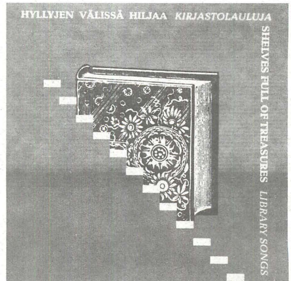
CD cover from "Shelves Full of Treasures: Public Libraries 200 years in Finland."