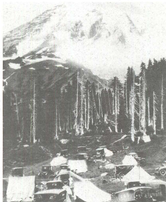
Auto camping on Mt. Rainier in 1927.

Copies of postcards have been produced through Classroom Support Services in a variety of formats including slides for classroom use. Faculty and students often contribute the slides made to the art or architecture slide libraries on campus. While many postcards are still under copyright and may not be reproduced for some purposes, all can be used for examination and research.