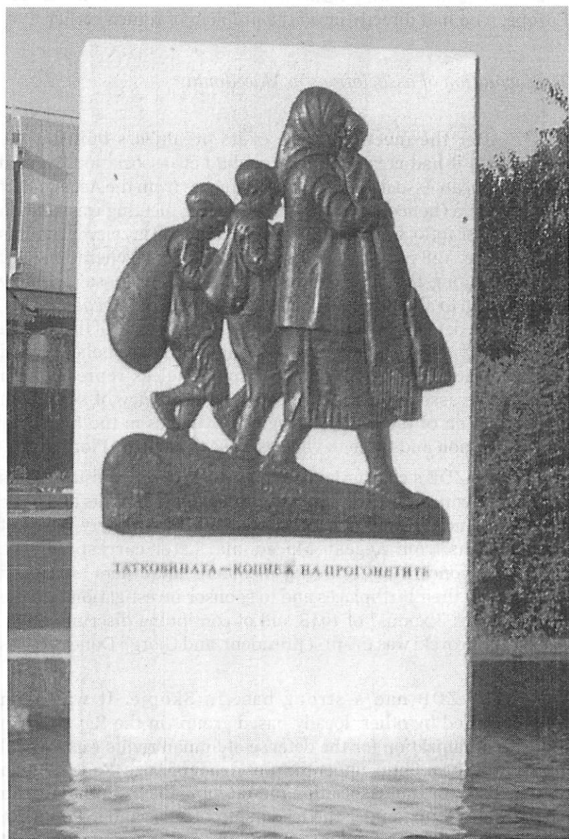
Figure 3: Žena Borec - Naso Bekjarovski

The caption reads: "Homeland –the yearning of the persecuted."