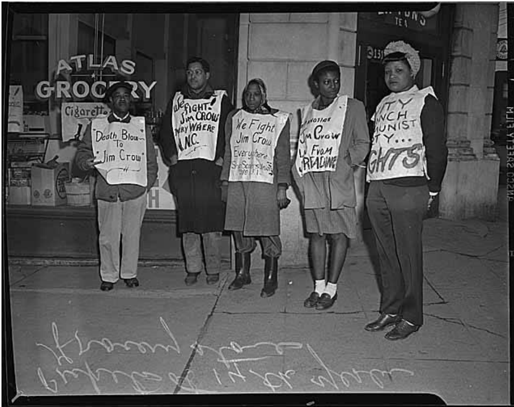
Figure 1: African American protesters in front of Atlas Grocery, Seattle, 1947. The various affiliations that can be seen are: "N.N.C" (National Negro Congress) – second from left, "Ship Scalers Local 589 (A.F.L.)" – center, and "Communist Party" – far right.