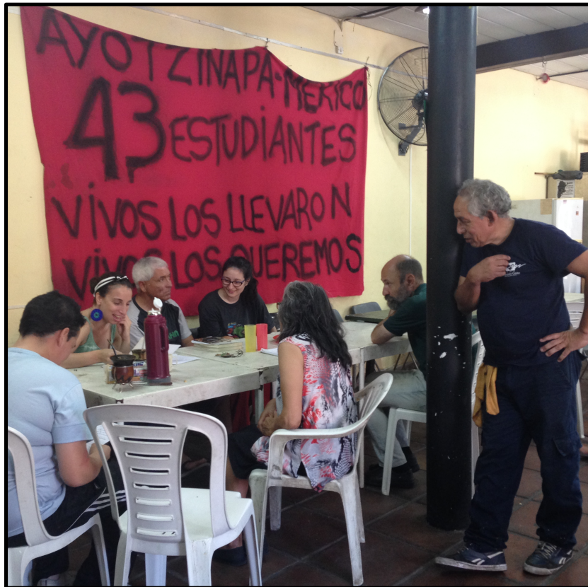
Figure 14: Malabardeano meeting