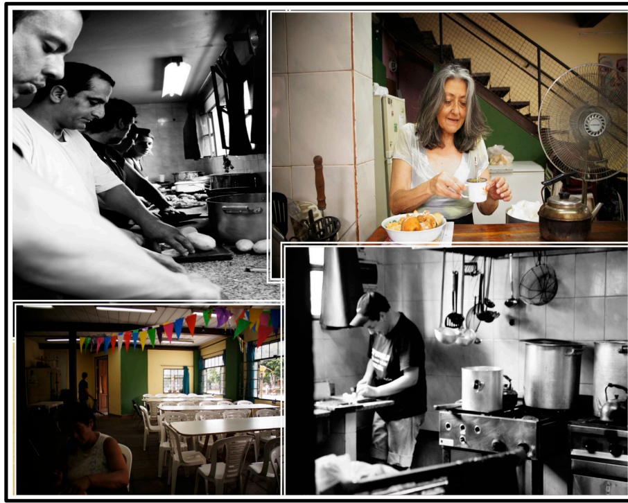
Figure 9: The Olla (by Mónica Fariás)