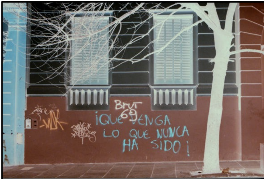
Figure 11: "May what never was come to be" (by Isabel Garín)

This sentiment echoes some of the spirit of the students' movement of 1968 with its "be realistic, demand the impossible" and "the future will only contain what we put into it now", something that should be of no surprise given the fact that many of the participants in the events of 2001 were teenagers or young adults in the late 1960s and were politically engaged at that time. However, the allusions to taking matters in one's hands to make happen the future people foresee, is more proximate - both in time and space - to the Movimiento Zapatista , one of the key referents of the new organizations (Zibeche 2004).