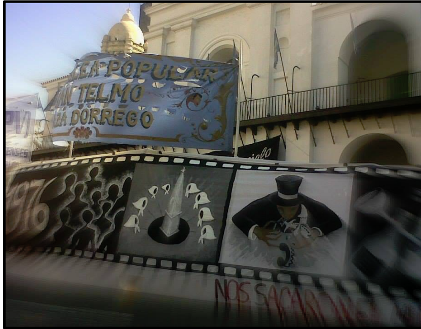
Figure 20: Asamblea Plaza Dorrego-San Telmo's banner in front of the Cabildo

In this dissertation I have looked to the cases of asambleas populares in Buenos Aires to think through the broader question of how political change happens. My work was guided by a specific interest in how people work along difference to engage in projects of radical political possibility that challenge common knowledges about poverty and 'the poor.' I chose to study asambleas populares because they are political spaces of diversity that had and have an important role in urban politics in Buenos Aires. Their case can provide insights not only into what needs to be done to bring about political change, but also into the nature of political change itself. In times of the apparent strengthening of conservative and right-wing political agendas around the world, and specifically in Argentina and Latin America, I argue that looking at the processes of working through and with difference in the asambleas can shed light onto how oppositional and creative alliances can be built.