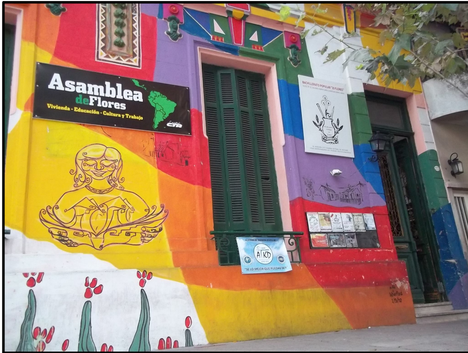
Figure 4: Main entrance to the Asamblea de Flores on Avellaneda Ave.