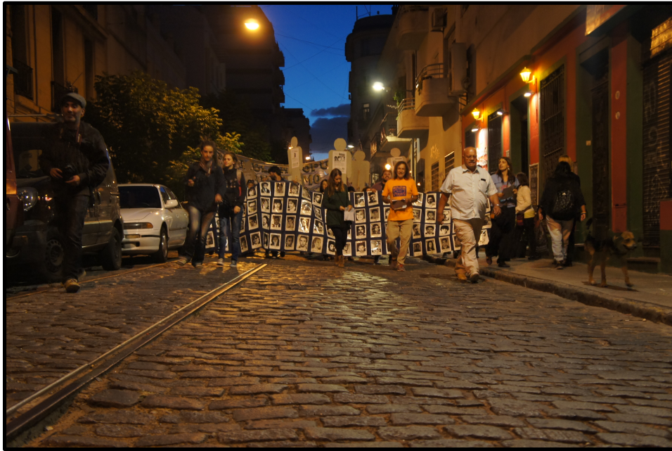
Figure 10: Marcha de Antorchas/Torches' March, December 2015 (by Mónica Farías)