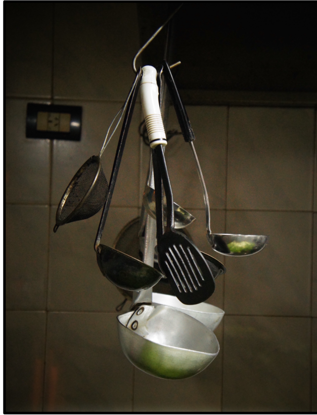
Figure 2: Cooking utensils in the Olla, Asamblea

Here I lay out the conceptual rationale underlying the process of construction and analysis of data in my research. I first reflect on my positionality as a woman from the Southern Hemisphere studying in the U.S. and conducting research in her hometown. I briefly sketch some of the benefits and disadvantages - or I should rather say ‘complexities’ - it bears on the research process. Then I describe the specific methods used, drawing attention to questions about relations of power implicated in the field and I recount how I dealt with them. In this section I also outline the specific and concrete aspects of the research before explaining why I chose to conduct my study on asambleas . 13 Lastly, I