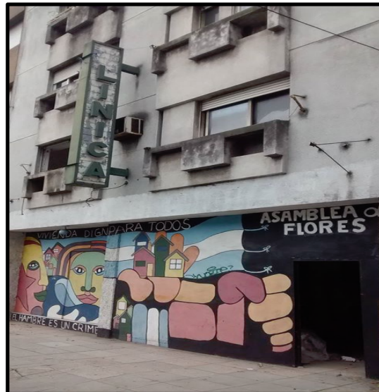
Figure 3: One of the entrances to the Asamblea de Flores (downloaded from the Asamblea's Facebook page)

In 2009 the Asamblea received an order to abandon the place but people organized quickly and gathered support of many organizations and unions and managed to delay the eviction. In the meantime, many former members returned to the organization, and activities such as the people's school were organized in order to give more visibility and legitimacy to the space. 26 Since then, the number of members has not declined. By the time I conducted fieldwork, a plenary meeting could have up to sixty people although many more participate in the different activities in the space - there are some one hundred students in the people's school and about thirty-five families living in the housing cooperative.