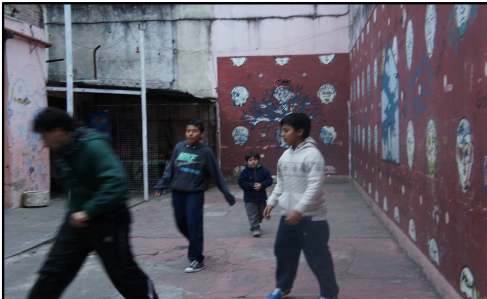
Figure 5: Patio that connects the former health clinic and the house, Asamblea de Flores