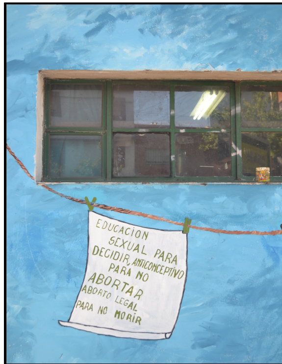
Figure 19: Pintada at the Asamblea Plaza Dorrego-San Telmo.

At the beginning of this chapter I argued that asambleas hold the potential to 'decolonize', to challenge liberal definitions of citizenship and the normative assumptions upon which the established social order has been built. And yet, many of the debates and