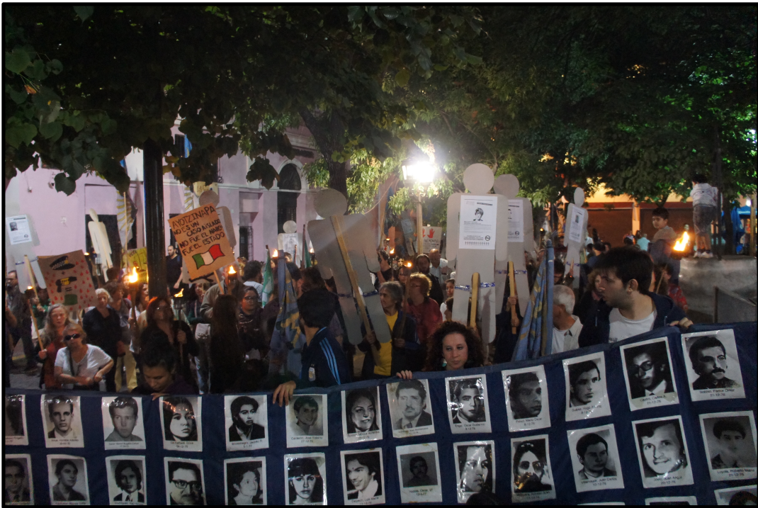
Figure 7: Marcha de Antorchas , Asamblea Plaza Dorrego-San Telmo (by Mónica Fariás)