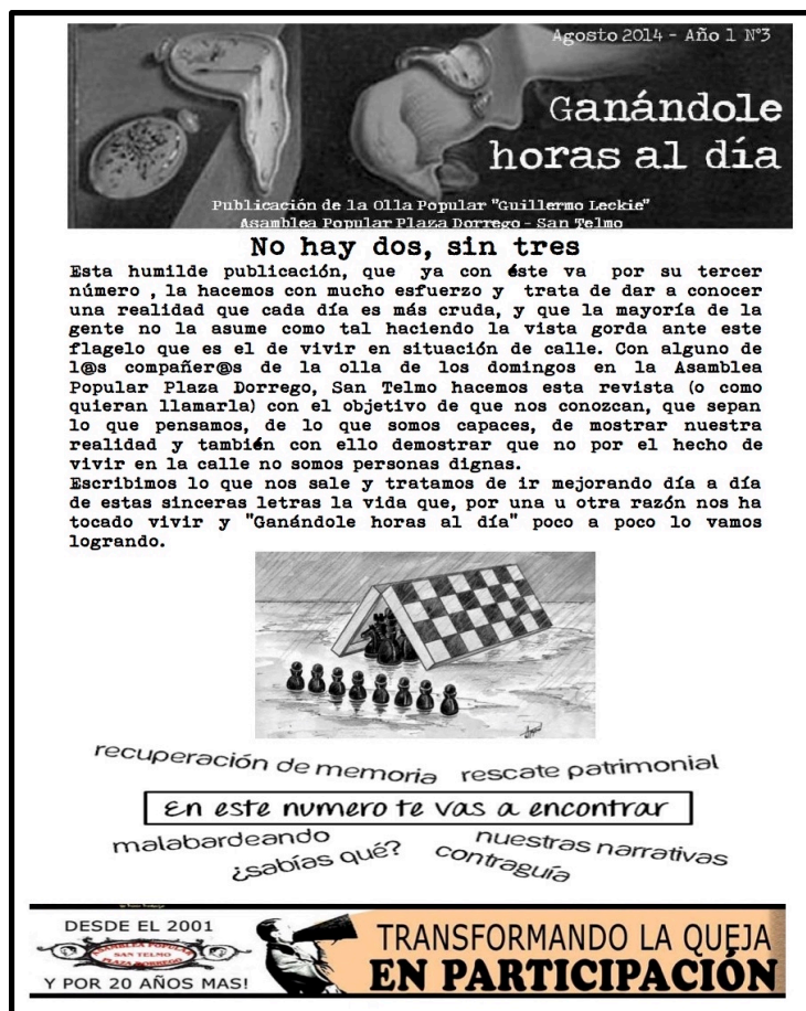
Figure 13: Ganándole Horas al Día - Olla's Magazine N.3 cover