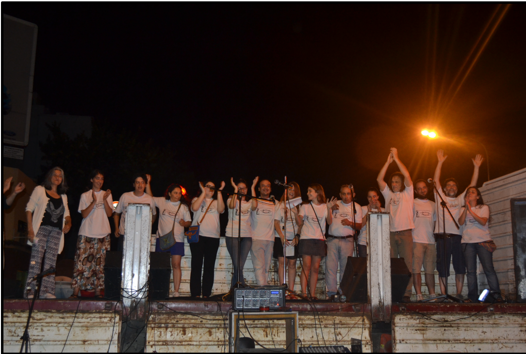
Figure 1: End of the year festival, Asamblea Plaza Dorrego-San Telmo, December 2013