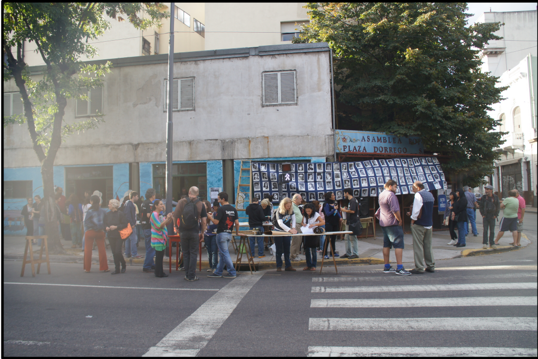
Figure 6: Preparations for the Marcha de Antorchas , Asamblea Plaza Dorrego-San Telmo