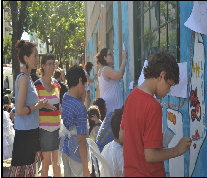
Figure 18: Pintada at the Asamblea Plaza Dorrego-San Telmo (by Mónica Farías)