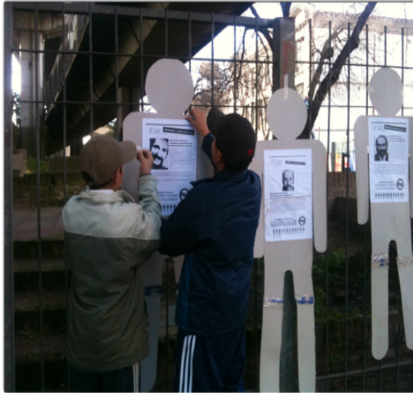
Figure 17: Cardboard figures representing the disappeared during the last dictatorship being hang by students

One important aspect of this public display is that members of the Asamblea invited people who attended the event to paint these same figures on the pavement with spray paint and to collaborate by hanging the cardboard figures from the fence that surrounds the former detention center adjacent to the school - known as El Atlético . The way I read the gesture is as an invitation to re-write together, to enact a collective 'reconstitution' that stands in direct opposition to the totalizing and homogenizing nature of modern ways of knowing that obscures - makes disappear - realities, experiences and even bodies.