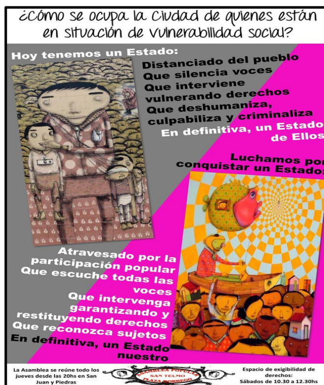
Figure 16: Poster about the Rights' Protection System in the city of Buenos Aires

the survival strategies and practices of the popular sectors and ignores and does not problematize the actions of the middle and higher sectors (personal communication, 12/09/13)