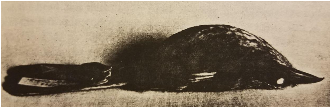
Above: Specimen meant for the collection. Below: Specimen meant for display

This is by no means an attack on animal photography, indeed photographs are essential to the process of taxidermy to insure natural accurateness of the specimen (if the specimen is being displayed and not simply for use in the collection). 39 This raises another point about museums that many people might not know. Museums have collections that are not meant for public viewing. The specimens are not mounted in any way to look alive, they do not have glass eyes or much of a form at all.