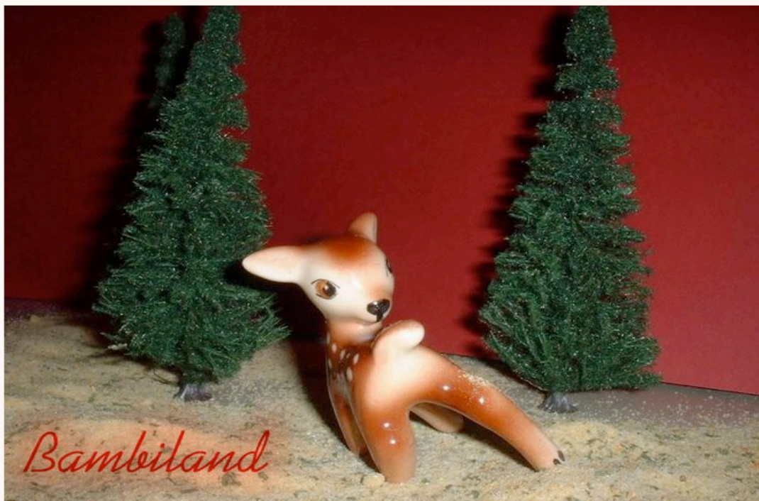
Fig. 2. First image of a plastic figurine in the online version of Bambiland .