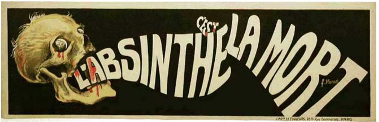
Absinthe is Death! by F. Monod, 1905