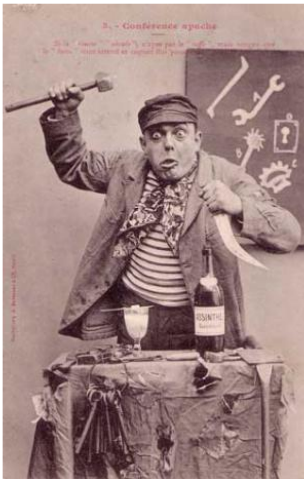
An absinthe postcard depicted the aperitif's supposed effects, date unknown.