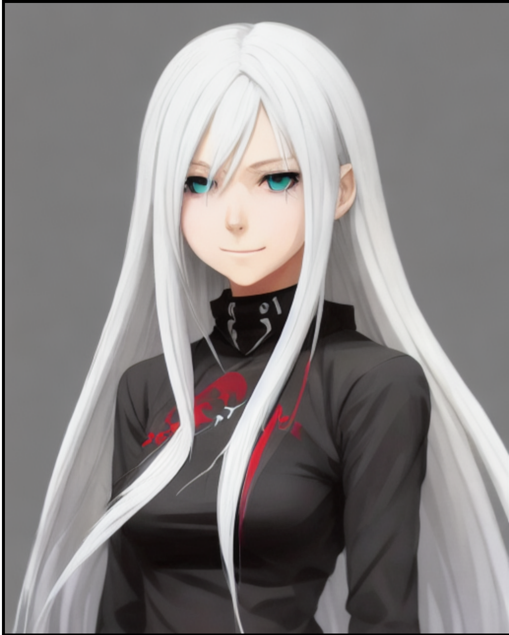
(An AI Depiction of Adora, an Amalgamy Academy student)