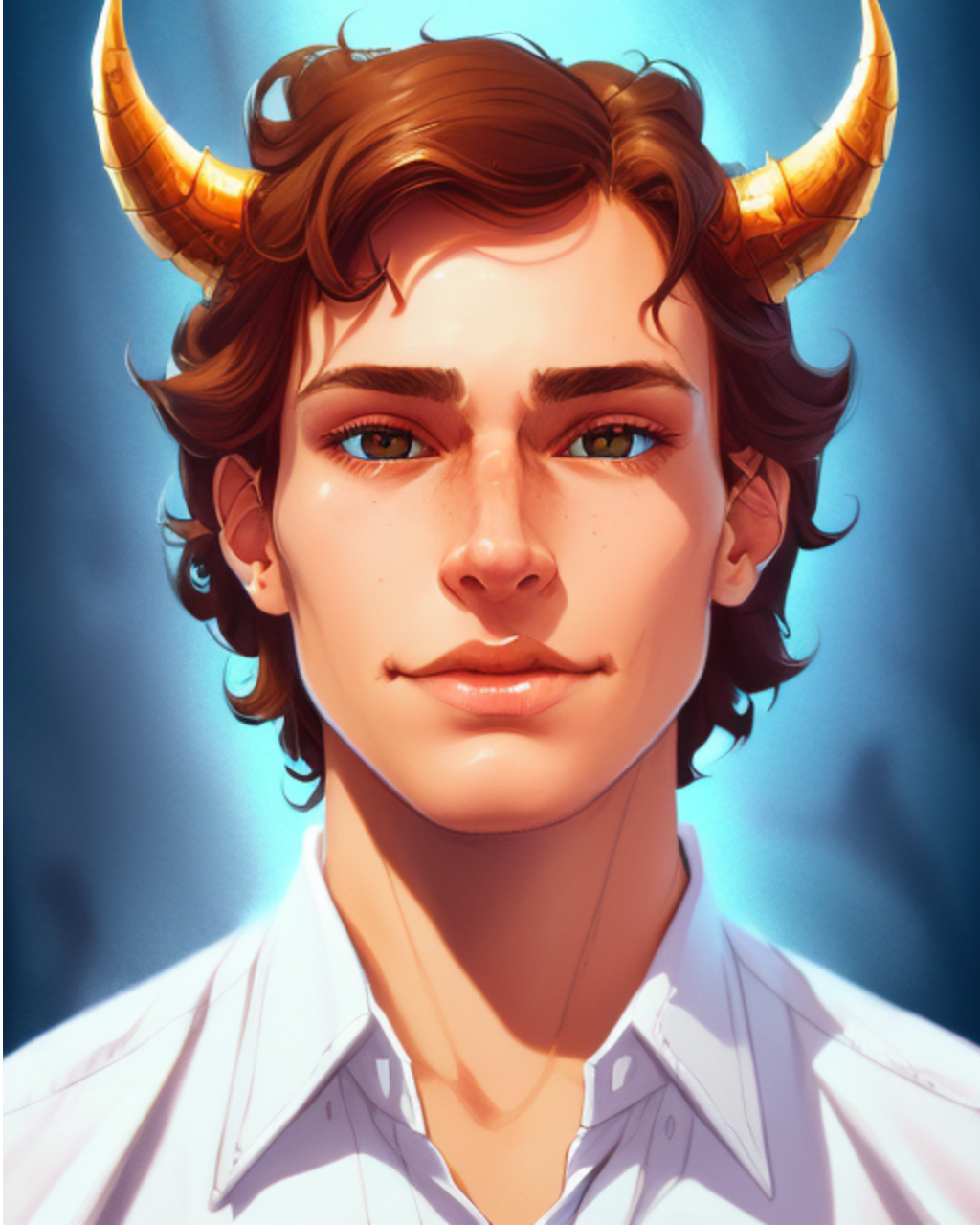
(An AI Depiction of Ezra)