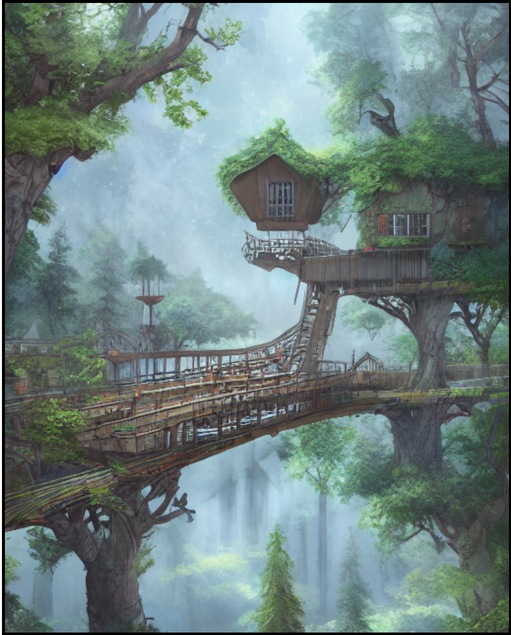
(An AI Depiction of Amalgamy Academy)