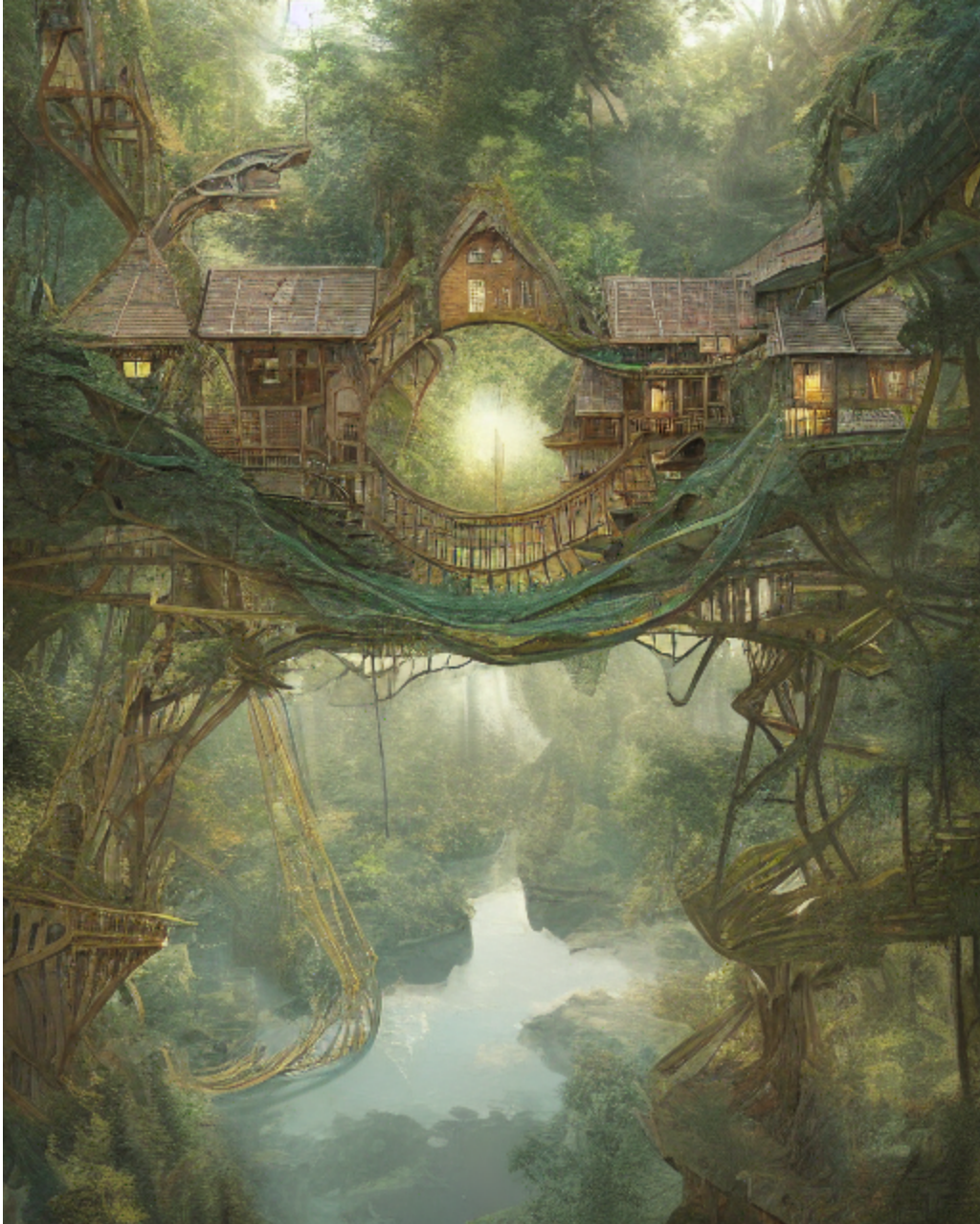
(An AI Depiction of Amalgamy Academy)