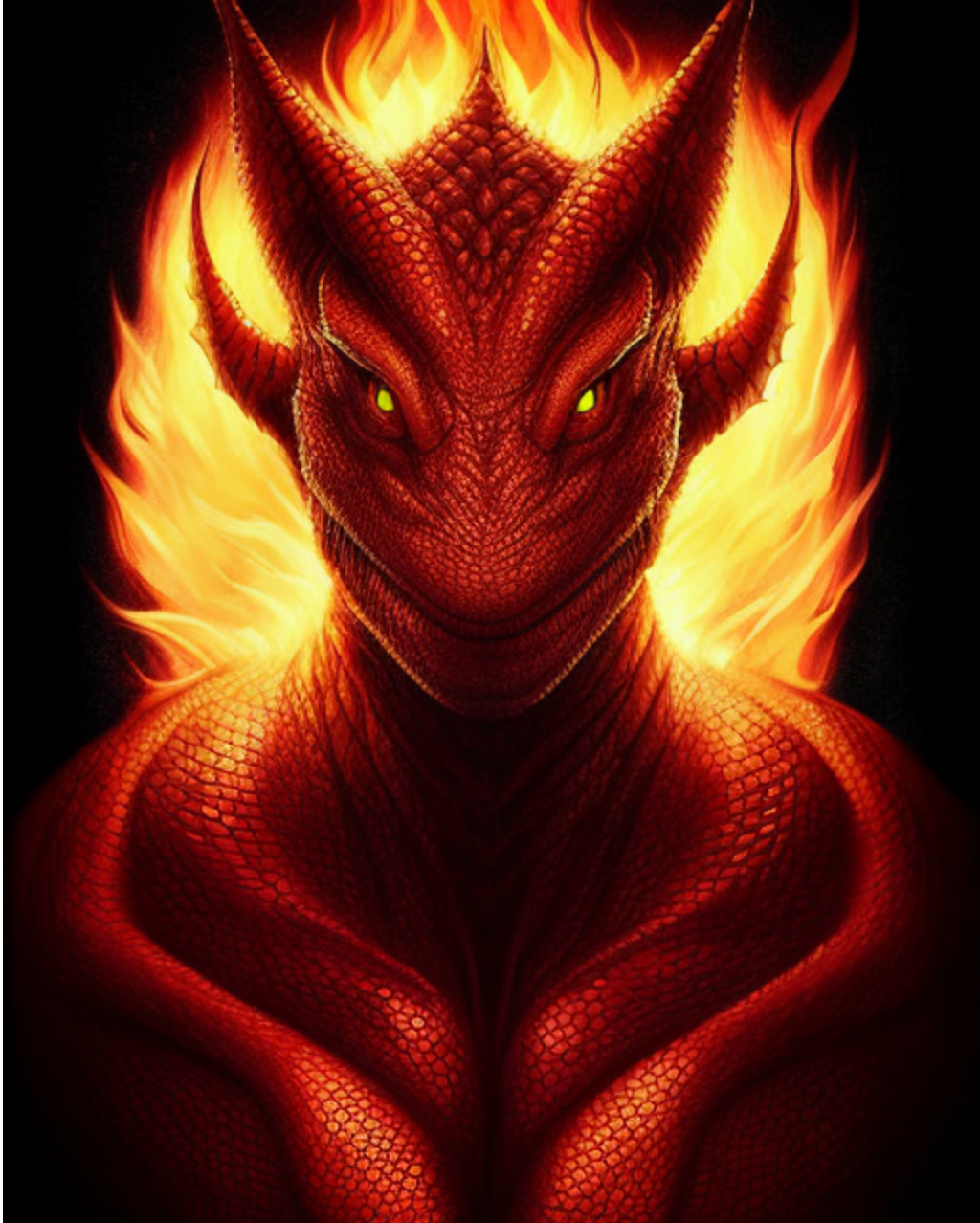
(An AI Depiction of Scald, Head of Amalgamy Academy Security)