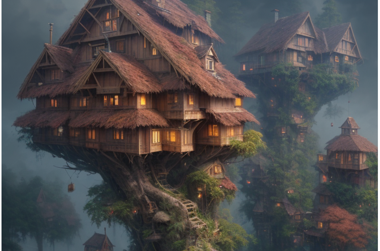
(An AI Depiction of a local neighborhood)