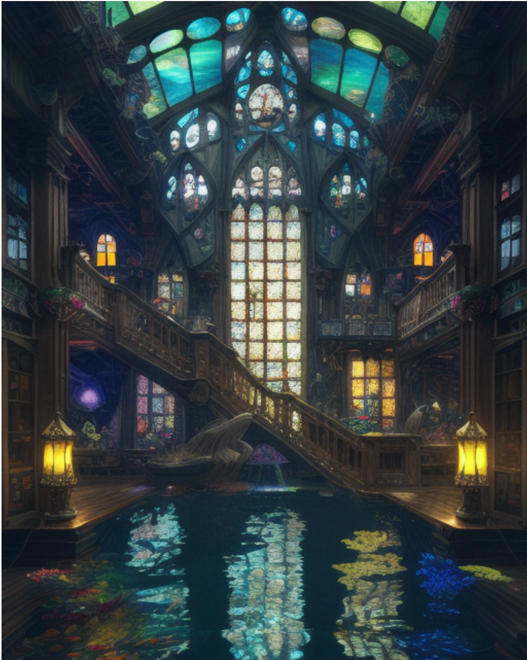
(An AI Depiction of Sanctuary)