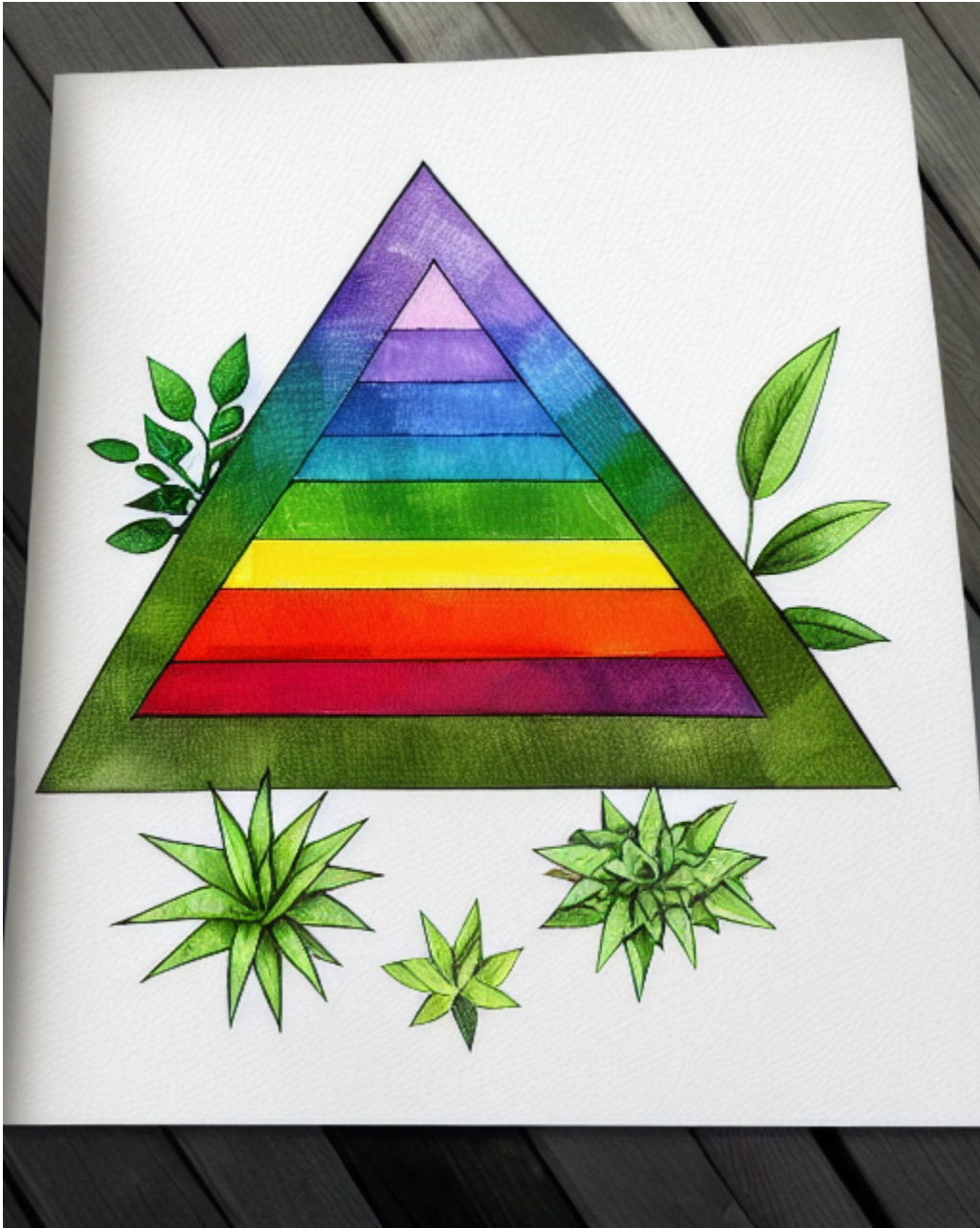
(An AI Depiction of the Educational Leveling Pyramid)