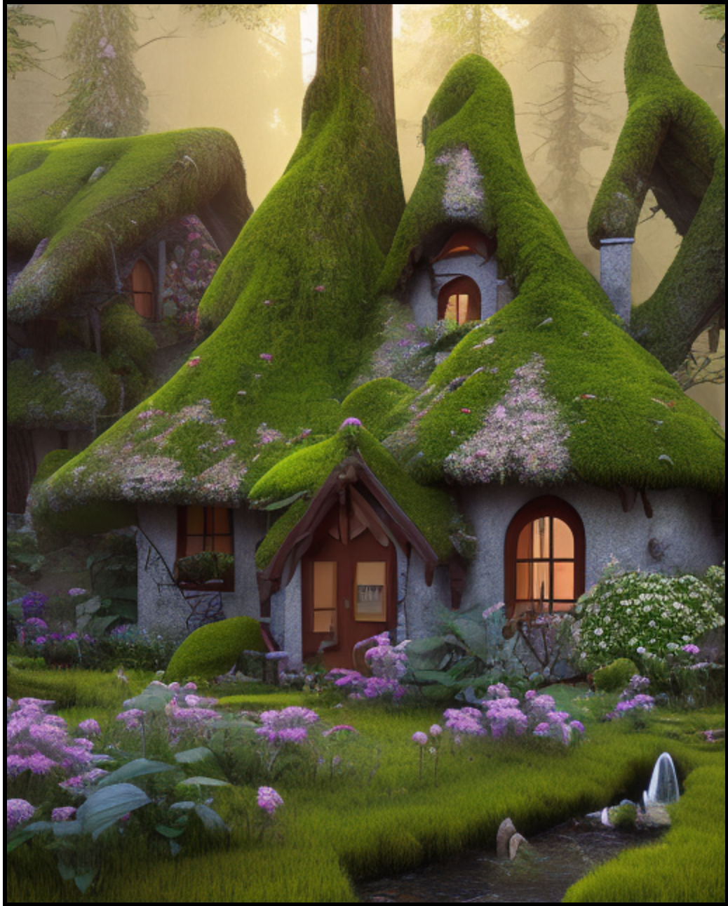
(An AI Depiction of the Urrug Cottage)