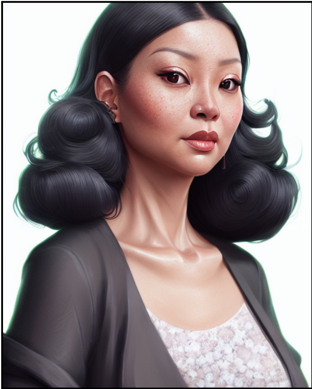
(An AI Depiction of Letia Urrug)