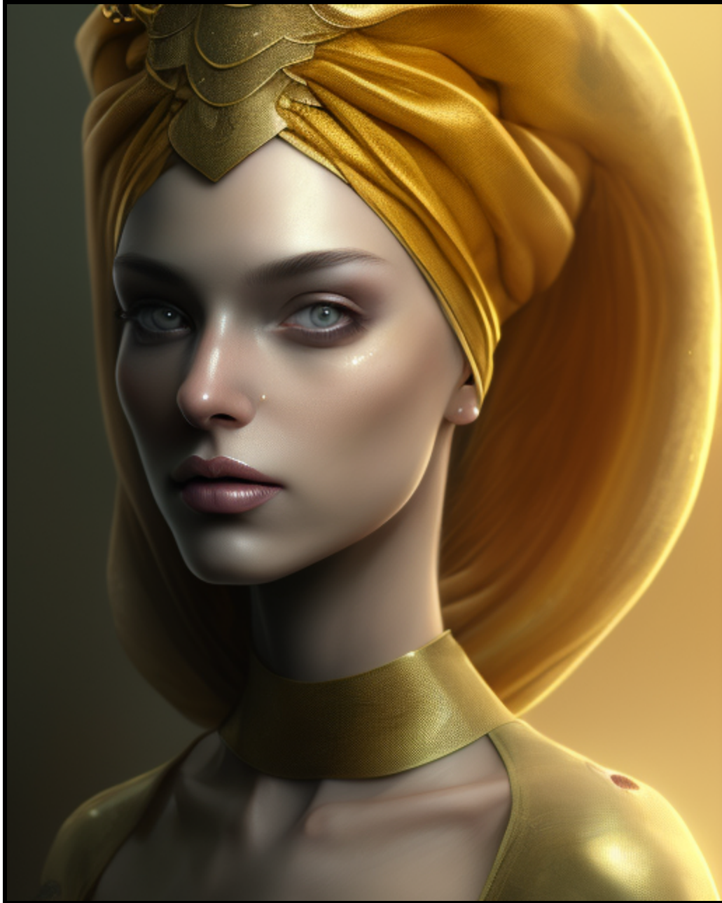
(An AI Depiction of Proctor Aegnor, Chronicles of Eras Past Instructor)