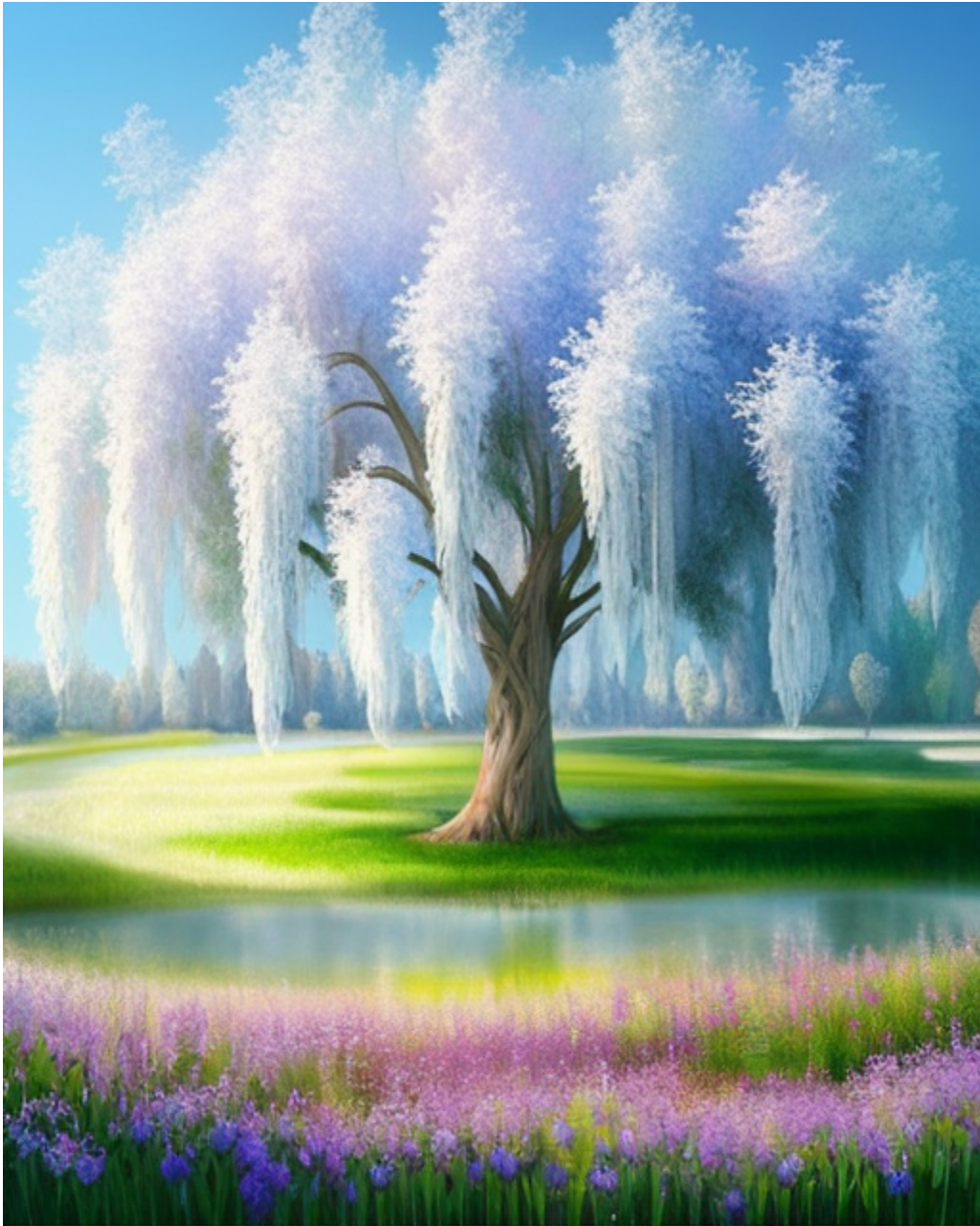
(An AI Depiction of the Glowing Glade)