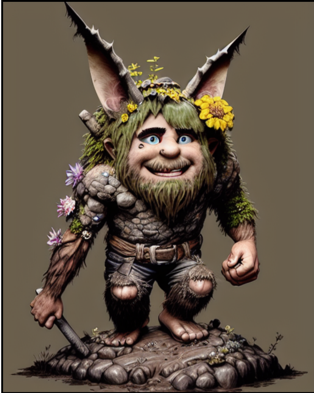
(An AI Depiction of Fjurnik, a rock troll by nature and Amalgamy's Bridge Troll by status)