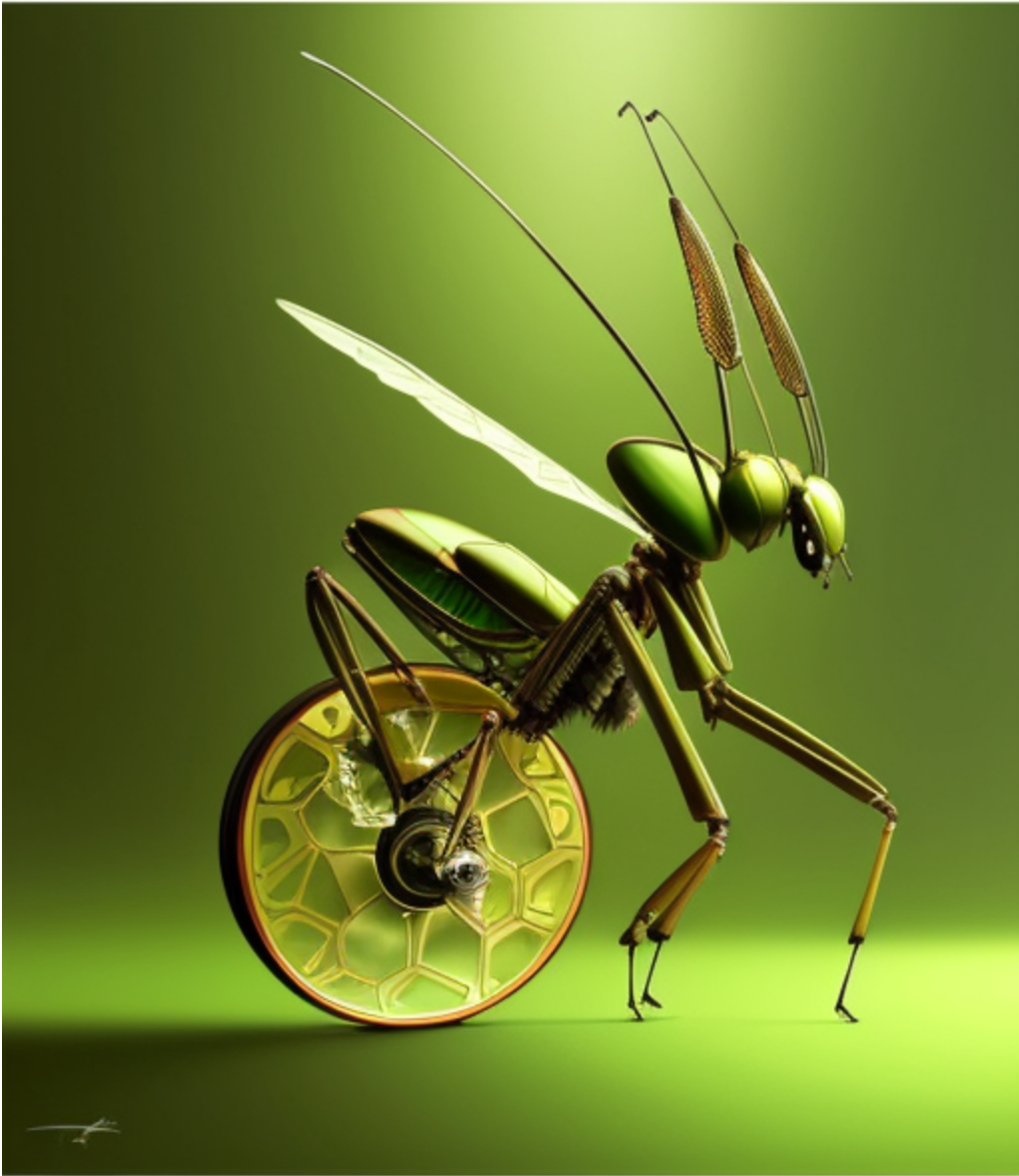
(An AI Depiction of the Cricket, a Buggy vehicle similar to a motorcycle)