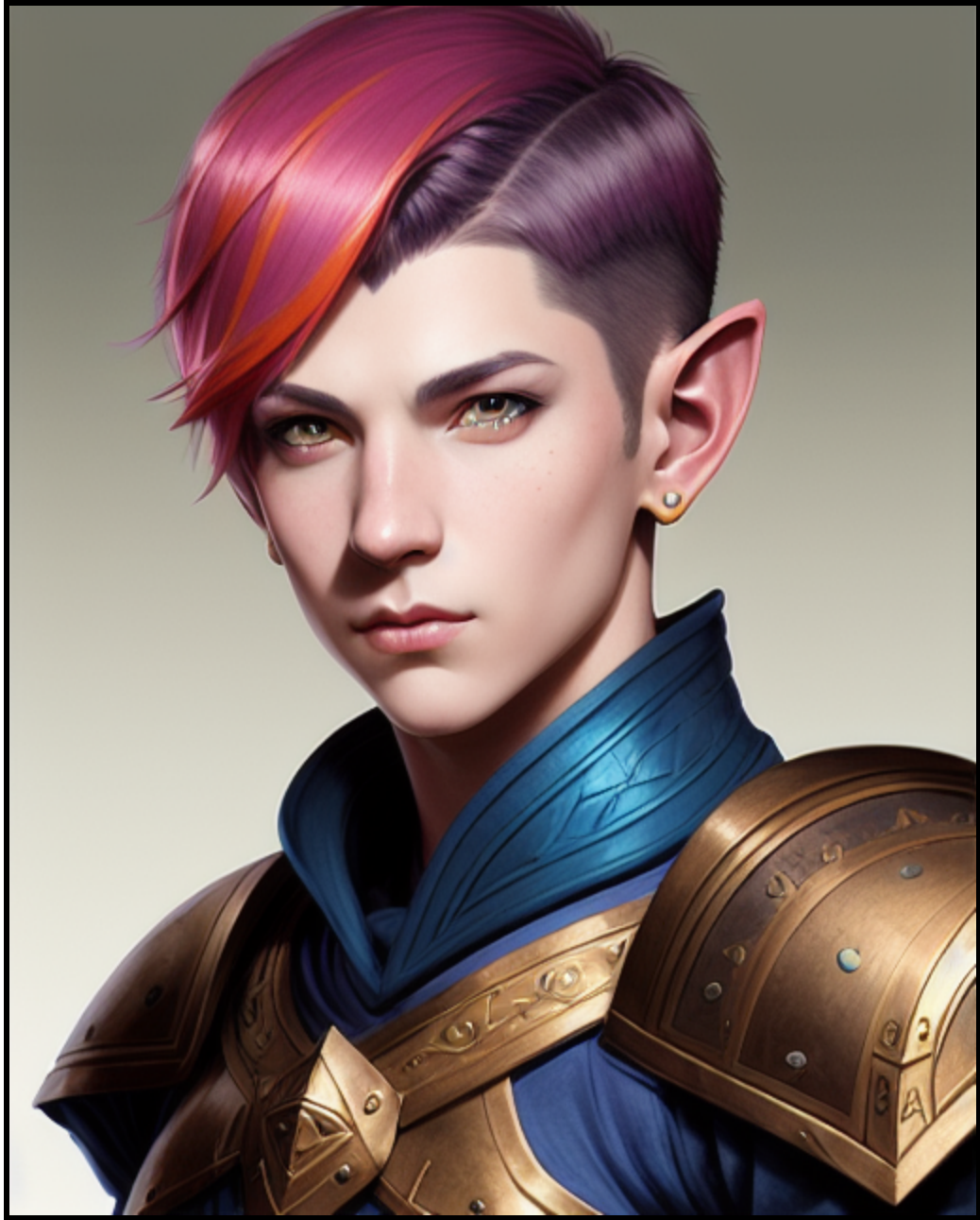
(An AI Depiction of the Elf Tthreadvar, a student at Amalgamy Academy)