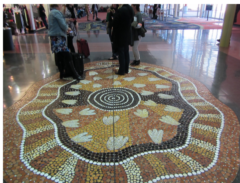
Figure 2- 1 Alice Springs Airport