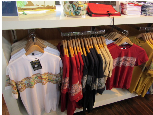
Figure 5-3 Dreaming T-shirt Display

Other products didn’t make quite as big of a production in associating the products with narratives of Dreamings or traditional relationships to land; however, there was still a token connection. In these common situations of souvenir labeling, a mere mention of the artist and a short version of the Dreaming story demonstrated a minor attempt by souvenir companies to relate their product to the Aboriginal “Other.” In Figure 5-2, the labeling on a screen printed t-shirt is one example of these basic demonstrations of Aboriginal art as signifying an Aboriginal story of spirituality. The top line of the tag says “Rainbow Serpent,” with the artist’s name directly below. There is then a brief six lines telling of the spiritual story regarding the Rainbow