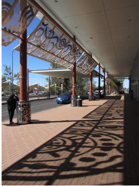
Figure 2- 3 Airport exterior

banner that welcomes travelers to the Alice Spring’s airport as they depart their plane and head into the airport. Dots and circular designs cross the sign, along with a black arm and hand reaching towards the center of the banner. The design at the entrance begins the theming of the airport space, and the depiction of the black arm may be seen as a virtual greeting to the Northern Territory by the Aboriginal people themselves. In Figure 2-1, a mosaic on the airport floor is a reproduction of an Aboriginal style painting, and the original that the design was taken from is also hanging on the airport wall. After visitors pass through the airport towards the parking and buses, the front of the airport is designed with metal awnings with the same Aboriginal motifs cut out to allow light through, and to produce a reflected design on the walkway below (see Figure 2-3). These types of depictions of local culture are common across international airport spaces, and these Australian Aboriginal designs provide a content that is unique to this country’s branded identity.