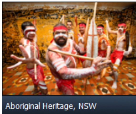
Figure 3-1: Go Walkabout with an Aboriginal guide

Typically in tourism, the demonstrations, food tasting and swimming would be staged, organized and pre-planned experiences, but the discourses defining the “walkabout” offer tourists the possibility to “discover” these activities. The websites reinstate the romanticized notion of the colonial discovery. For Tourism Australia, even this quote that is taken out of the “Discover / Blue Mountains” section of the website provides an invitation to experience Aboriginal culture at a deep and personal level, always available for an individual (or a tourism audience).