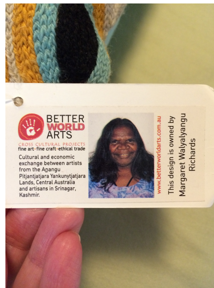
Figure 5- 12 Cross Cultural Info

Figures 5-11 and 5-12 are the same types of cushion as the previous analysis (Figures 5-8 through 5-10). On these cushions, there was only one simple tag. On one side (Figure 5-11) is a business card for Cross Cultural Projects with their contact information, including an email for “Carolyn” and the company website. We are simply told that this is a place of “fine art-fine craft-ethical trade” with a symbol of a handprint that is a common connotation for handmade articles.