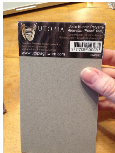
Figure 5-5 Utopia