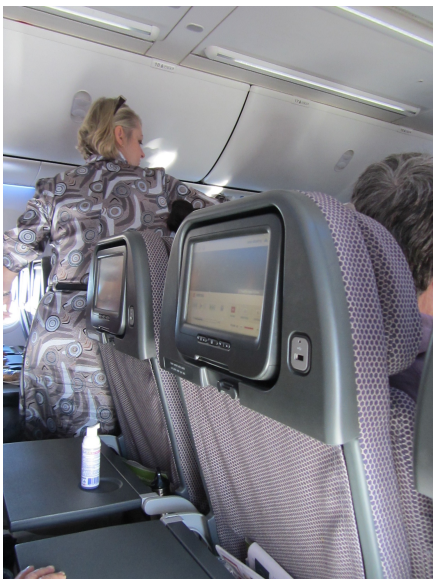
Figure 2 - 4 Qantas air flight attendant

The form and content of these designs are also carried through in other areas of the airport experience. For example, uniforms or particular styles of dress mark the environment while simultaneously linking the employees as part of the service industry. In Figures 2-4 and 2-5, we can see how signs of Aboriginality are portrayed in the uniforms of Qantas airlines flight attendants, both in the airplane (Fig. 2-4) and in the airport (Fig. 2-5). The print and design (or the content) depicted in these uniforms signify Aboriginal art, with the recognizable dot patterns, boomerang motifs and circular patterns. The form, the uniforms, becomes a moving symbol of Aboriginality, which themes the more neutral spaces of the interior of the airplane or the ubiquitous airport scenes. Figure 2-4 was photographed on a flight from Sydney to Alice Springs, or the Red Center, and Figure 2-5 was taken in Perth in Western Australia. The presence of Aboriginal patterns in Qantas' uniforms functions as a connection between the corporate airlines to the Aboriginal culture, so that no matter where Qantas flies, nationally or internationally, the Aboriginal culture is represented as part of the space. Even in these brief examples of the genre of tourism spaces, it is clear that the tourism industry emphasizes and appropriates the Aboriginal symbols as part of an Australian trope.