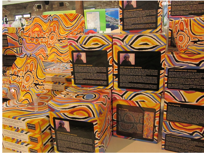
Figure 5-1 Souvenir packaging

The Dreamtime story presented with a piece of art signifies both a connection to ceremony and the “traditional” culture, and assist the non-Aboriginal buyer in understanding a deeper meaning or significance of the motifs (cf. Myers, 2002). This is a common practice with Art Centres and galleries, and is carried over in even the most banal tourist arts as part of the packaging or labeling. In Figure 5-1, a display of Aboriginal art styled boxes, with a coordinating souvenir dish inside, includes the Dreamtime story on one side of the cube. The black background with rounded corners is labeled “The Painting” and the body of the text states the country and how this Dreamtime story relates to that country. The black background emphasizes the text on the brightly colored box, so that the stark contrast highlights the text as an important element. On the right side of the text is a small version of the full painting. Clearly, the design on the box and that on the coordinating dish cannot depict the layout and scope of the full painting, but each becomes a physical metonym, where a piece of the design comes to stand for the whole.