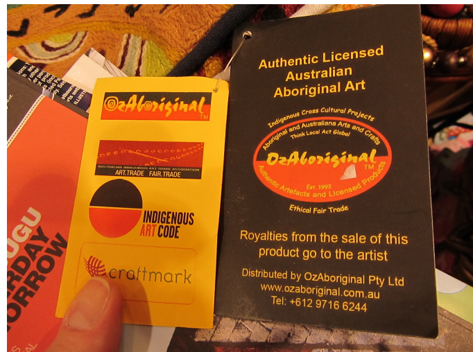
Figure 5-9 Icons of “fairness”