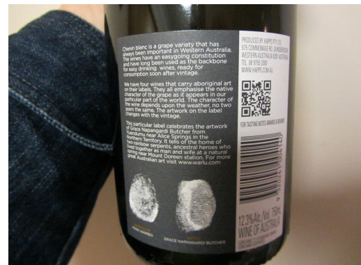
Figure 5-14 Fingerprints