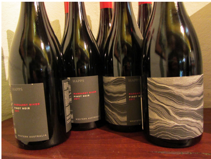
Figure 5-13 Happs' I Series

As the wine label states that the Aboriginal design changes with the vintage, it also emphasizes that the grape is never the same from year to year. The “uniqueness” of the evolving grapes is