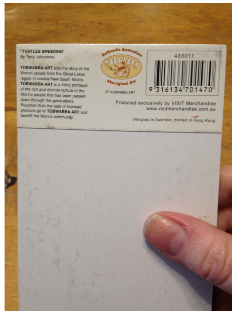
Figure 5-6 TOBWABBA

In the three examples provided here in Figures 5-4, 5-5 and 5-6, we can see that the souvenir producers emphasized payments to Aboriginal artists; however, the information provided on tourism souvenir packaging was especially vague. In Figure 5-4, the notepad from Warlukurlangu, states, “Royalties from these products directly benefit the artist and their community.” Figure 5-5, a notepad from Utopia states, “Royalties from this product go back to the artist and community.” And, Figure 5-6 states “Royalties from the sale of licensed products go to TOBWABBA ART and benefit the Worimi community.” These statements appear similar in meaning, but Figures 5-4 and 5-5 explicitly state that the royalties benefit “the artist” as well as the community, where 5-6 does not mention the artist separately. Both Figures 5-4 and 5-5 make the statement of the royalties as a line that stands on its own under the logo of the