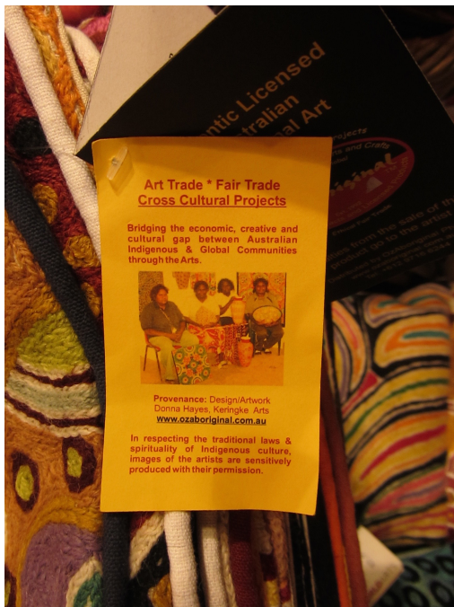
Figure 5-8 Art Trade * Fair Trade

In Figures 5-8 and 5-9 three portions of the tags on one pillow are shown. On the tag labeled 5-8, the potential consumer learns that this is an “Art Trade * Fair Trade Cross Cultural Project[],” which is said to mean that the projects bridge “the economic, creative and cultural gap between Australian Indigenous & Global Communities through the Arts.” There is an image of four women seated and holding a variety of colorful artistic objects. Three of the women have a direct gaze into the camera, and two of them appear to be smiling. The fourth woman is looking at the camera with her head slightly turned, and is straight faced. Under the photo, the word “provenance” is followed with one person’s name “Donna Hayes, Keringke Arts.” At the bottom of this label, the company provides a statement of respect in that the image of the artists is