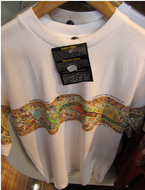
Figure 5-2 Dreaming T-shirt