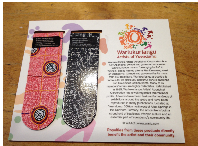
Figure 5-7 Warlukurlangu Artists

these tourist art businesses and make their products stand apart from others. I now turn to analyze how Aboriginal owned tourism businesses create cultural capital through discourses of benefits for the Aboriginal community.