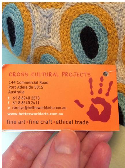
Figure 5- 11 Cross Cultural Projects

In the second example of the pillow souvenir, I compare the previous company’s high production of ethical trade and “authentic” product to one that demonstrates nearly the opposite extreme: one of understatement. In the tourism industry where symbols of luxury, value or even in this case, “fair trade” can become so overused, being inundated with symbols can almost reverse the perception that this is something of value or “authentic.” Sometimes less really can appear to be more.