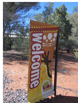
Figure 2 - 2 Alice Springs Welcome