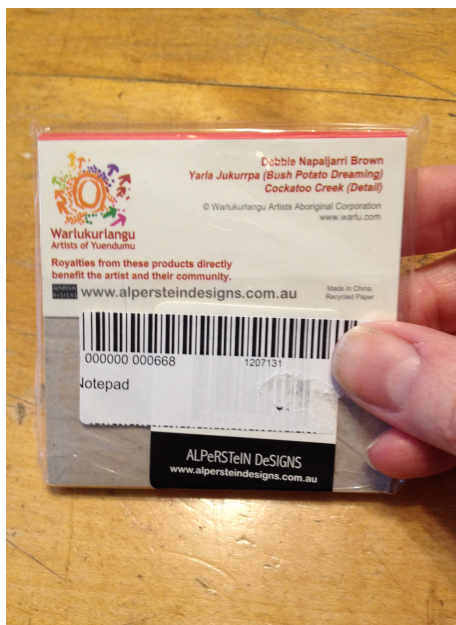
Figure 5-4 Warlukurlangu

This presentation of payment for Aboriginal artists was also apparent in the souvenir industry, where information presented on labels produced discourses of payment. When the Aboriginal art market is politically and publicly critiqued for unfair labor practices, tourist art producers and sellers also have a stake in positioning their own practice as ethical. Bourdieu (2006b) states that linguistic production is “affected by the anticipation of market sanctions” and