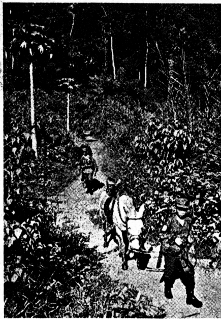
Shan troops: Compromise.

Under the new arrangement, the SSA also made it clear that, while it would fight alongside the BCP on the east side of the Salween River, it would operate independently on the west side of the waterway. The SSA is not pro-communist. "It is certainly no secret that the Shans are maintaining their links with the BCP only to ensure a continued supply of Chinese arms," says one