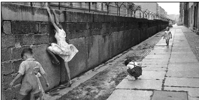
Figure 2. The Berlin Wall.

With this shift from the fence to a wall, the meaning of a border wall changes. A typical outdoor wall is a structure that consists of concrete, stone, or brick used for protection, shelter, or marking property boundaries. The Berlin Wall (Figure 2), built by the East German government, was an example of a concrete structure that divided East and West Berlin from 1961 – 1989 (History.com Staff, 2009). The concrete design along with barbed wire running across the top of the wall made it nearly impossible to climb. The Berlin Wall was a historical example of territorial division by placing a concrete wall that separated East and West Berlin. Building a 30ft wall along the U.S. – Mexico border does draw a historical connection to the Berlin Wall because it could create a visible southern divide from Mexico. While this border wall would further deny illegal crossings, stricter immigration policies would keep immigrants from walking through the gate.