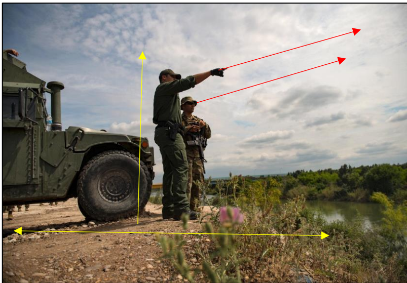
Figure 6. The Texas National Guard working with the Border Patrol. The second image shows the vertical perspective (yellow) and vector patterns (red).