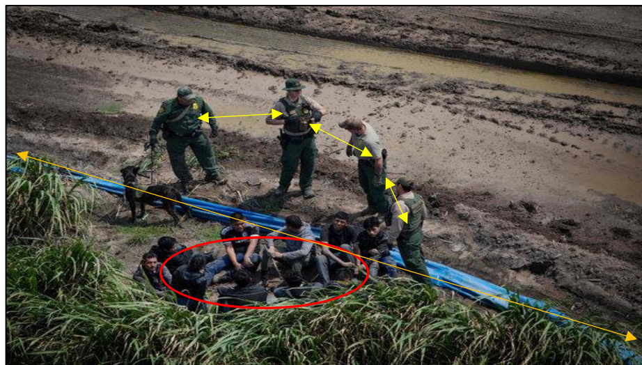
Figure 8. The U.S. Border Patrol apprehend undocumented immigrants crossing from Mexico. The second image denotes an oval and semi-circle patterns along with a line division.