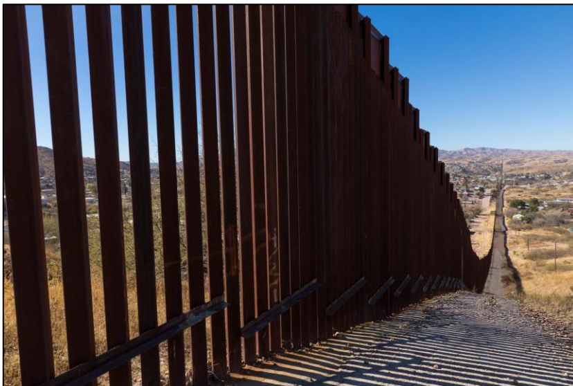
Figure 1. An example of a fence on the U.S. – Mexico border.

This paper focused on images related to those who created policy and those who enforced it. These images were placed into two categories to conduct a semiotic analysis. The first category emphasized how perspective angles created social power structures by studying images of the border wall prototypes and President Trump in the same context. The second category examined images related to border enforcement which included the Texas National Guard and the U.S. Border Patrol who policed the Southwestern border. This image category further reflected and thus extended the idea of social power structures, the concept of inferiority, and hierarchical structures through perspective angles. Although the remaining categories are important in relation to people impacted and reflected by The New York Times coverage, this study focused only on images related to policy makers and policy enforcement.