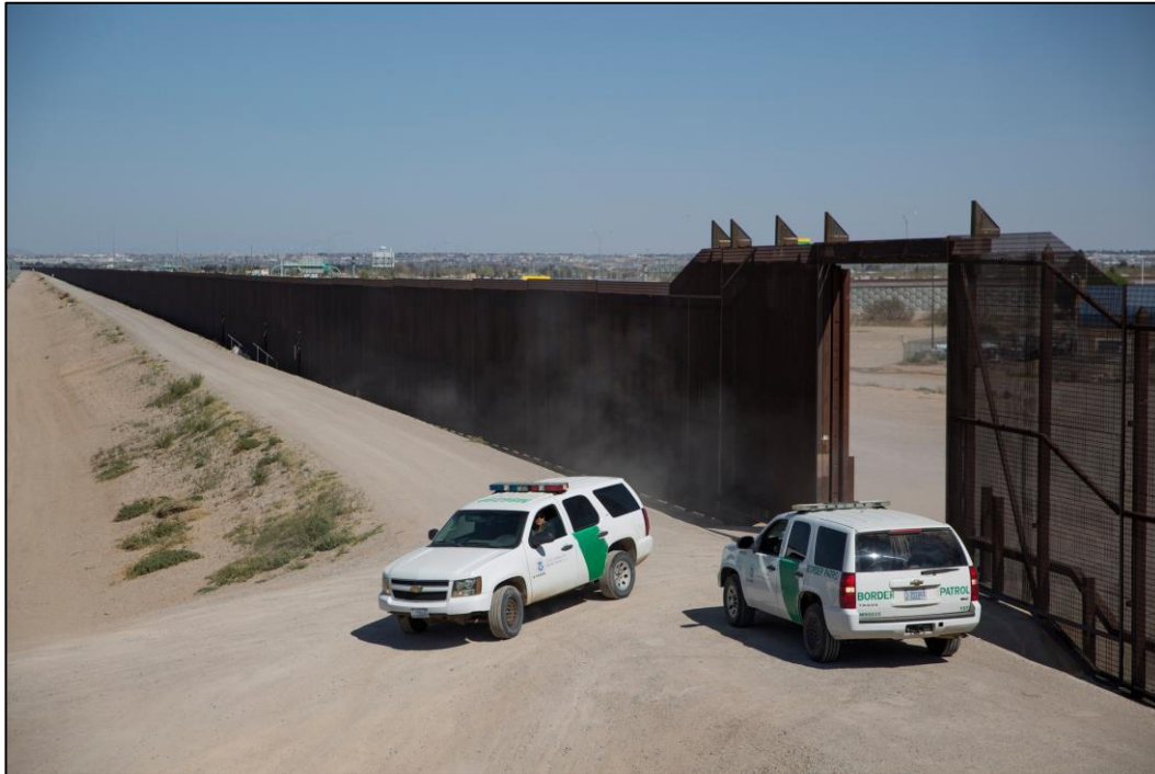
Figure 7. An example of a U.S. Border Patrol vehicle.

Additionally, viewers may also see other aspects of the hierarchical clash through the weapons carried and the uniforms worn. In this image, the soldier is carrying a military rifle against his chest versus the agent's pistol located on his hip. The rifle is also bigger than the pistol and much more visible within the frame. The difference in weaponry size and model may indicate who is ready for action along the border. Viewers may also compare the uniforms of both people to gain clarity toward the hierarchical structure. According to Machin (2016), shades of color are used to express ideas. For instance, the soldier's brown and patterned uniform could connote the military (Ch. 4, Communicative Functions of Color). Also, the Border Patrol uses a shade of green with their uniforms which could connote the forest and might