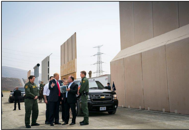
Figure 4. President Trump discussing the border wall concepts in San Diego.

President Trump who appear to be in the conversation. One actor held a document as Trump spoke to him while using a single hand gesture. Behind the actors, two black vehicles are parked with the closest vehicle to the group containing two small flags on its hood. Surrounding the vehicles were U.S. Secret Service agents who are focused away from the group of people.