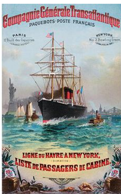
Figure 2. Front cover of passenger list, CGT French Line, La Bretagne, 1887, https://www.gjenvick.com .