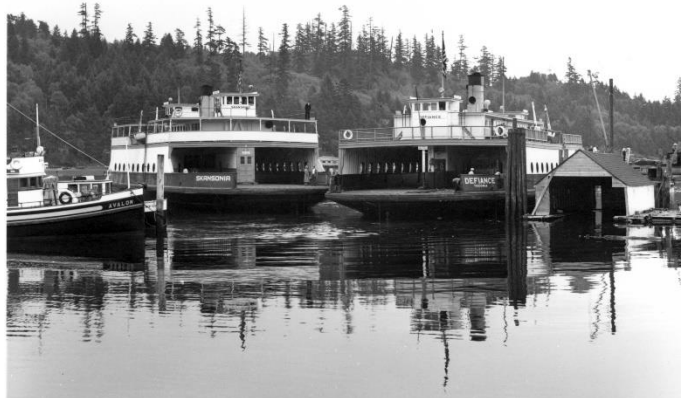
Figure 5. Ferries Defiance and Skansonia moored next to the Avalon , 1998.039.006, Harbor History Museum, Gig Harbor, Washington.