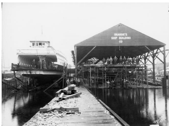
Figure 4. Skansie Shipbuilding Company with the Ferry City of Steilacoom , Marvin D. Boland, 1926, Marvin D. Boland Collection G37.1-164, Tacoma Public Library, Tacoma, Washington.

Skansies chose an ideal location for a Pacific Northwest shipyard in terms of labor supply, land cost, and water depth. 53