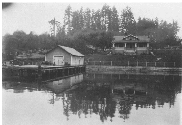
Figure 3. Skansie home and net shed, 2017.020.024, Harbor History Museum, Gig Harbor, Washington.