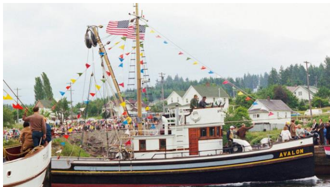
Figure 9. A historical photo of the Avalon before it was declared derelict, 2015