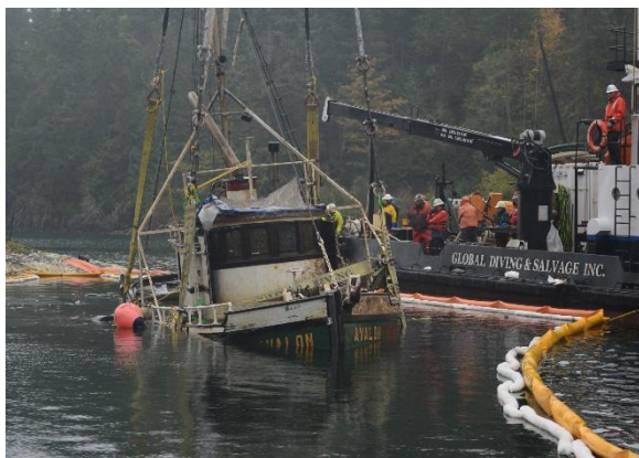
Figure 10. The derelict 1929 Avalon raised from Hood River canal, Oct 28, 2014, https://seatosummitnet.wordpress.com .