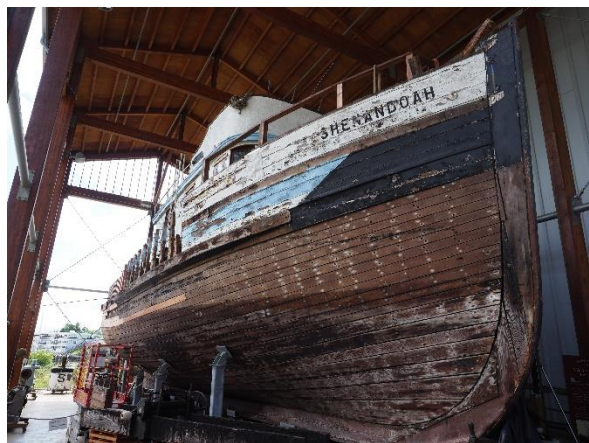
Figure 8. Shenandoah restoration at Harbor History Museum, Gig Harbor, Washington, 2018, http://waterdogsite.com .