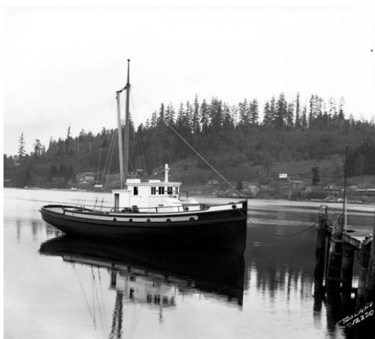
Figure 7. Shenandoah , Marvin D. Boland, 1925, Marvin D. Boland Collection B12220, Tacoma Public Library, Tacoma, Washington.

The Shenandoah , built for Pasco Dorotich of Gig Harbor, Washington, was launched as a cannery tender from the Skansie ways on April 3, 1925. 85 Today, the Shenandoah is being restored as a key artifact of Pacific Northwest industry and ingenuity. Powered by an Atlas-