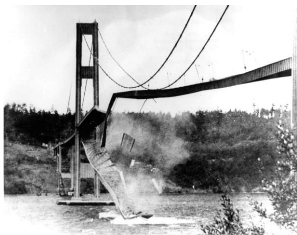
Figure 6. New Tacoma Narrows center span crashes into Puget Sound, November 7, 1940

pay the county twenty-five thousand dollars and cease accepting the subsidy. 76 This was a significant loss to the company. In 1938, Pierce County was required to buy the Washington Navigation Company out of their ferry operations for three-hundred-thousand dollars in order to