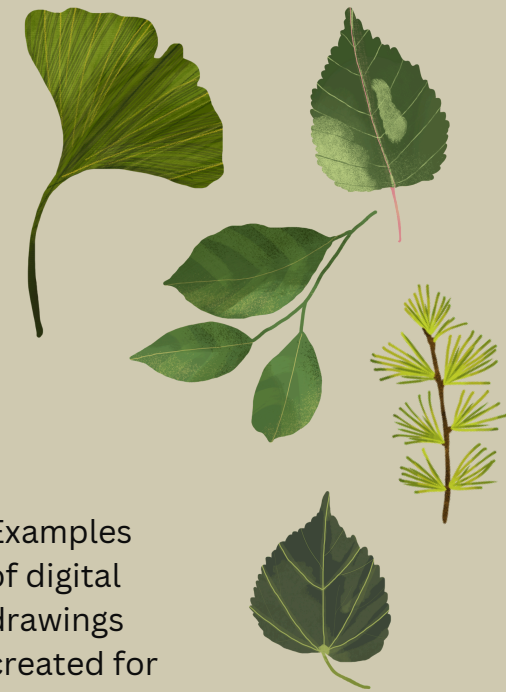
Examples of digital drawings created for the website

The purpose of this project is to create easily accessible information for everyone. This project is available on a public platform (the internet) and in a public space (the arboretum). Allowing people to print out their own signs from home brings education and interpretation to those who may not be able to physically reach the arboretum, have a hard time with mobility, or struggle to stand for long periods of time. This information is fully accessible from any location, to any person who wishes to see it, without degrading the quality of experience for the viewer. This not only creates an inclusive environment for individuals who have physical disabilities, but also extends the reach of audience to rural communities or those who live far away from cities with conventional museum settings.