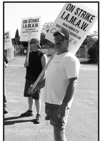
Machinists picket the Daimler Trucks plant in Portland on July 1, Day 1 of a strike that lasted 22 days.