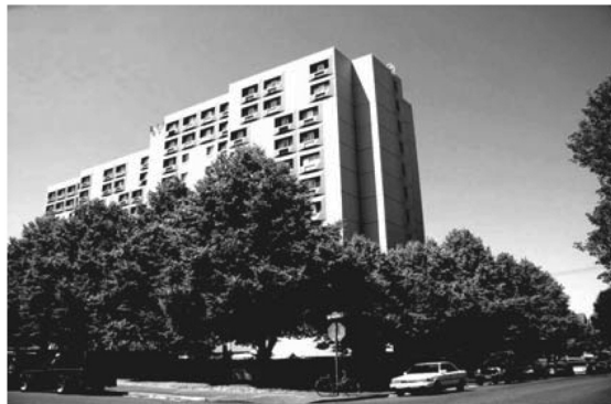
MARSHALL UNION MANOR Opened in January of 1974