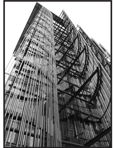
With the help of union labor, Portland's 18-story, city-block-sized federal building got a "green" remodel, and reopened in September. The names of all the workers are printed on glass at the building's entrance.