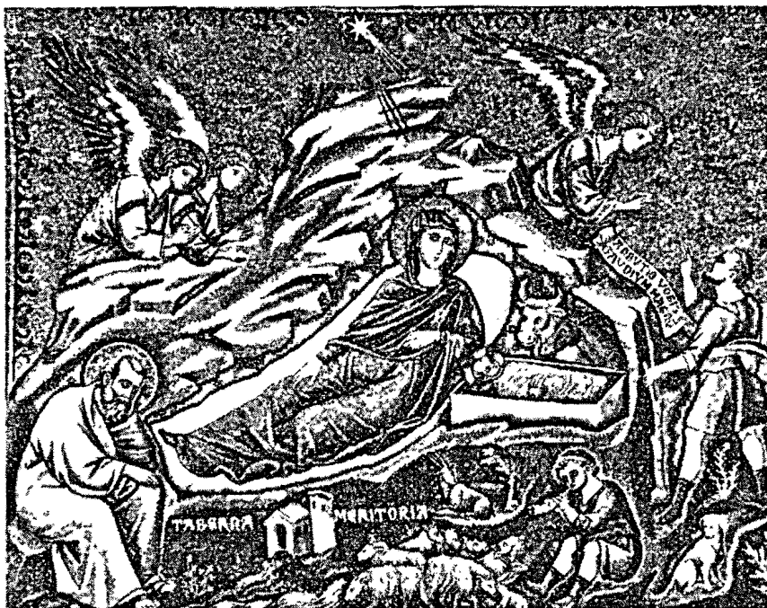
Pietro Cavallini: "The Nativity of Christ," showing Mary, Joseph, Christ, angels, shepherds, flock of sheep, oxen, ass, and the Star of David; Basilica di Santa Maria in Trastevere, Rome, ca. 1300

In sweet jubilation now sing and be joyful. Our heart's delight lies in a manger And shines like the sun, in his mother's lap. He is the Alpha and Omega!