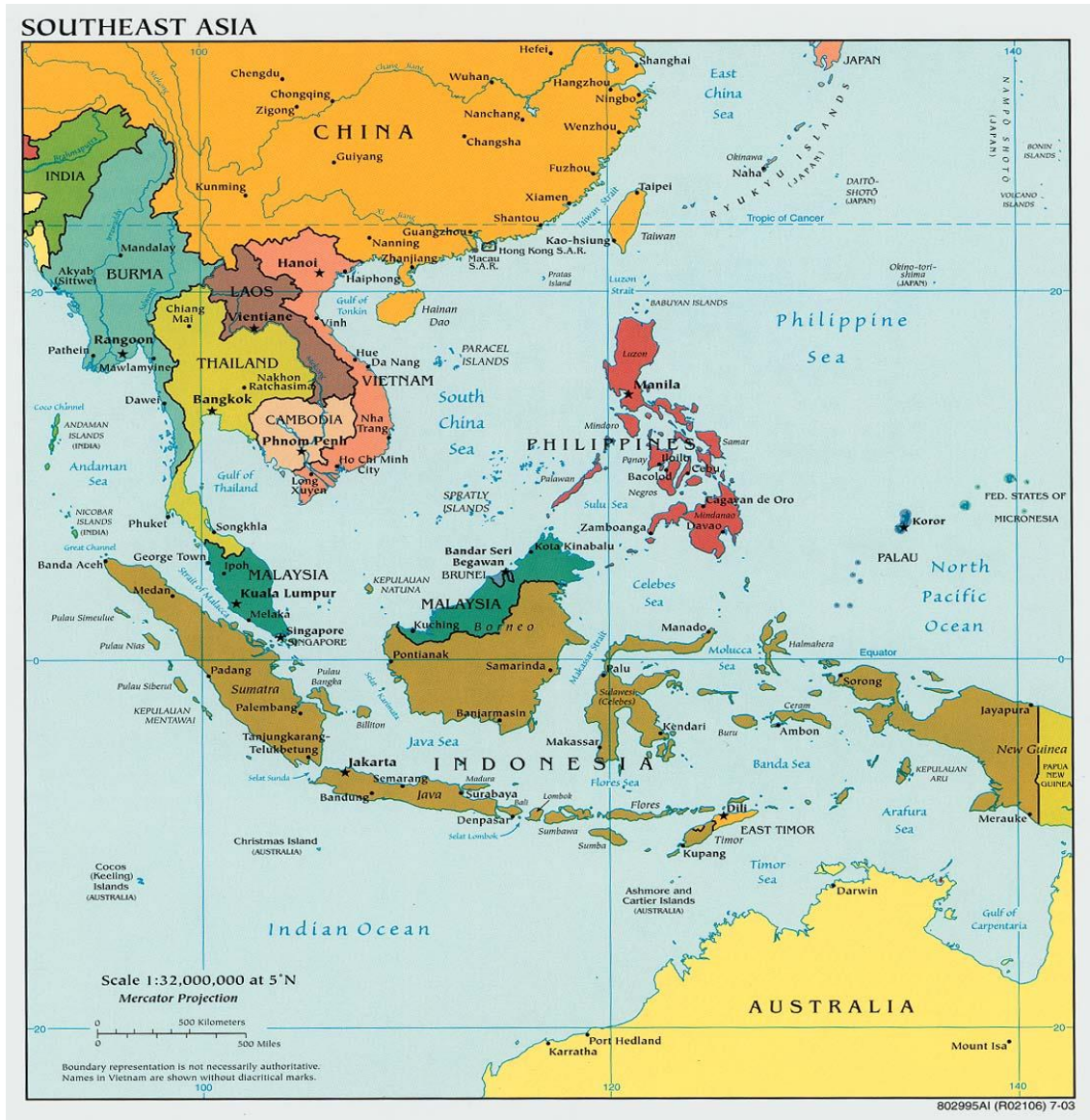
Figure 1.2 Map of Southeast Asian countries.

majority of the individuals came to the U.S. as refugees from Vietnam, Laos, and Cambodia (Pang, 1998; Takaki, 1989).