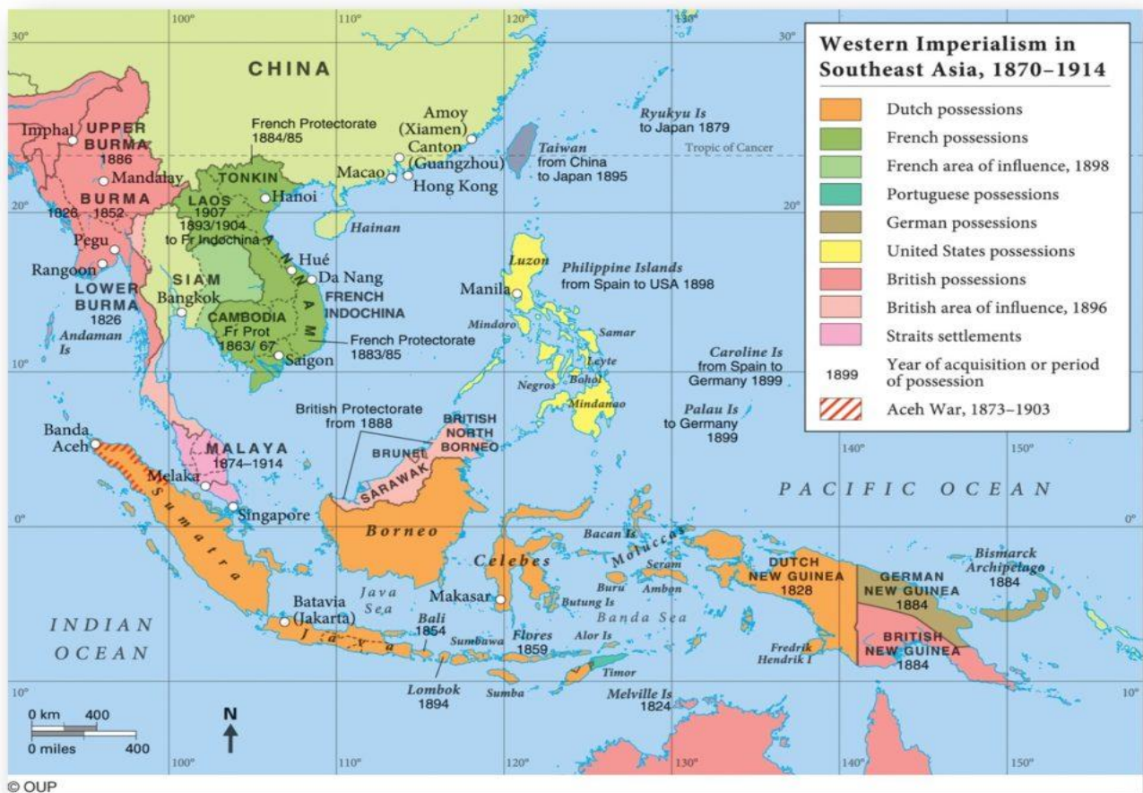
Figure 1. Map of Western imperialism in Southeast Asia

L’Inde Exterieur, Farther India, Greater India, and the Hinduized or Indianized States in reference to an extension of neighboring countries. Chinese writings identified the area as Kun Lun or Nan Yang (Little China), while others referred to the region between India and China as Indo-China from the French Indochina, which includes Laos, Cambodia, and Vietnam (SarDesai, 1997). The variety of terms is suggestive of the colonial mindset with the goal of controlling a region of people with rich histories, languages, religion, and cultures by these major colonizers: Europe (Portugal, Spain, the Netherlands, Great Britain, and France), the U.S. and Japan (SarDesai, 1997). Figure 1 illustrates the imposed Southeast Asian boundaries divided by the colonizers.