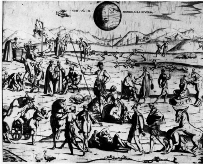
Figure 1: “.COSI . VA . IL . MONDO . ALLA . RIVERSA.” ca. 1560

comprehensive comparative historical analysis of the visual archive on inversion, a couple examples from this period render inversion even more imaginable: