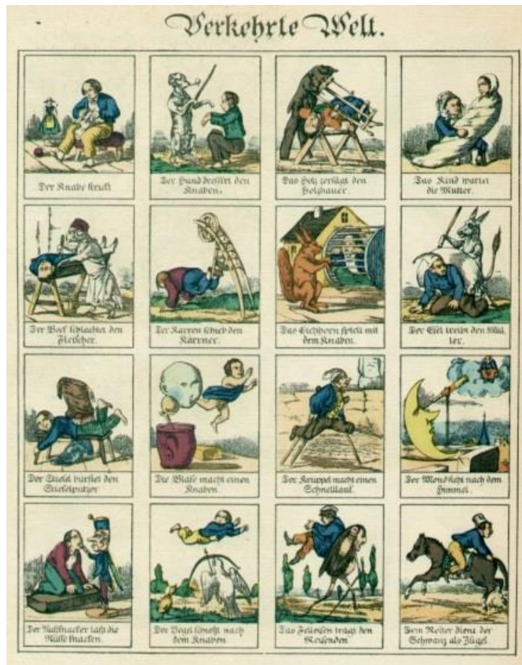
Figure 2: "Die verkehrte Welt," Oehmigke & Riemschneider, ca. 1860.

These early forms of moral info-tainment seem to uphold the age-old dictum from Horace's Ars poetica concerning the purpose of the arts: "prodesse et delectare." The comical and entertaining images instruct the viewer about how the world is not. As with the adynata from antiquity, these relationships indicate impossible conditions that would never normally occur. They represent, to return to Agamben's terminology, states of exception. 7 In this suspension of the status quo, new combinations become imaginable, even as certain pairings are reused to the point of becoming clichés.