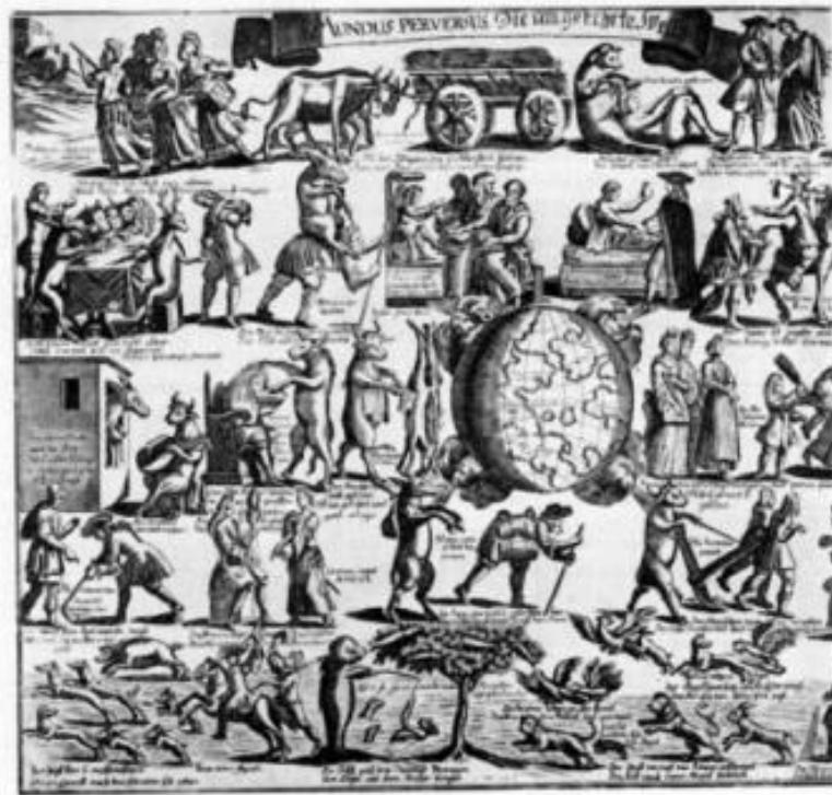
Figure 3: Mundus perversus . Engraving from the seventeenth century.

But there is little reason to limit the range of possible meanings of inversion; instead if we keep these various denotations and connotations in play for now, we might better see how inversion extends into manifold cultural realms. Yet, at the same time, there are pragmatic reasons for preserving the form that Kuper lends to inversion as an operational code that deals with binary oppositions. As a world turned around, the inverted world marks a deviation from the path, be it the straight path of the plough in the field or the moral path of righteousness. The potential perversion that accompanies every inversion means that the inverted world is home to the abnormal, the monstrous, and the strange.