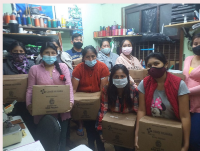
Above: Migrant Support Center staff distribute cestas básicas and facilitate documentation procedures (2021).