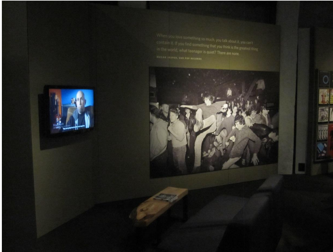
Second area, mural and oral history presentation.