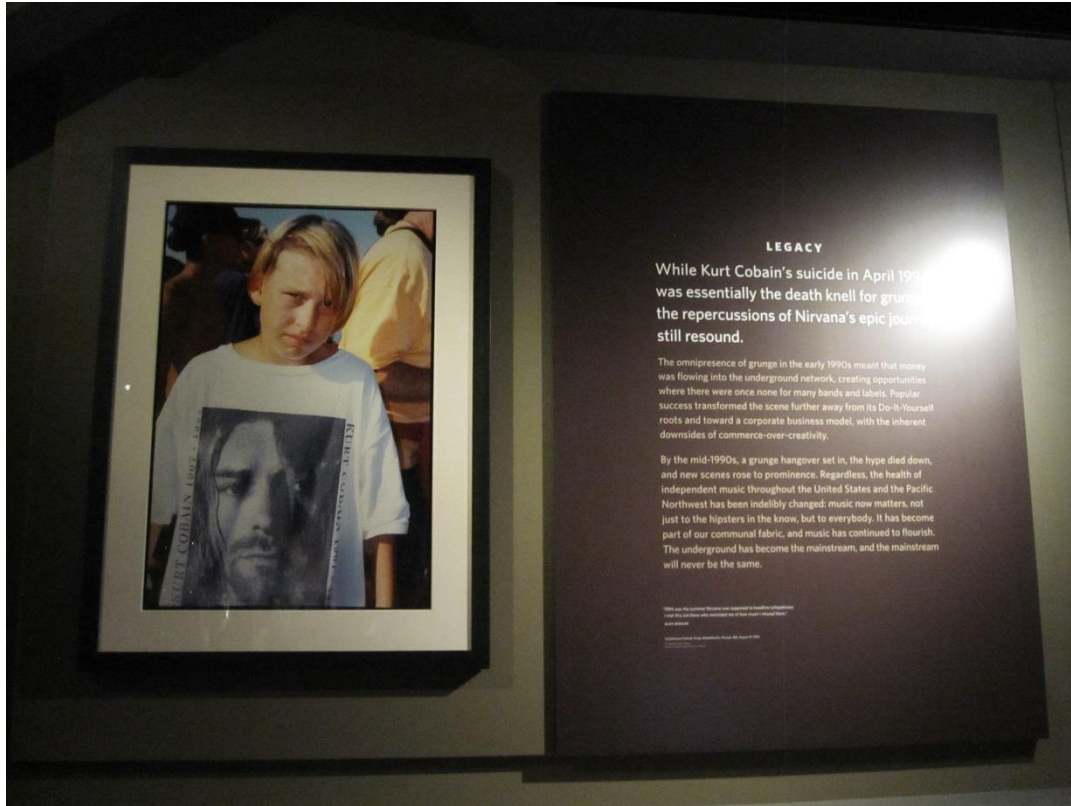
Ending photograph and panel discussing Kurt & Nirvana's legacy.