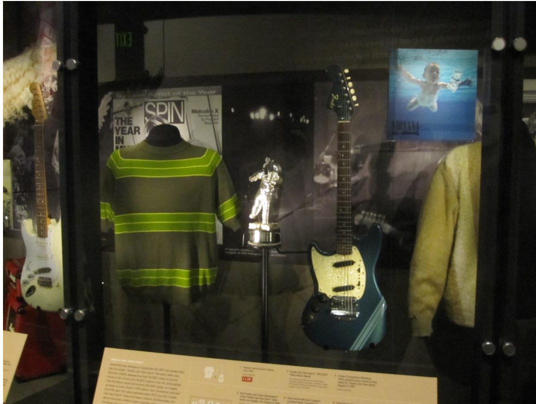
Wall case containing Nevermind objects.