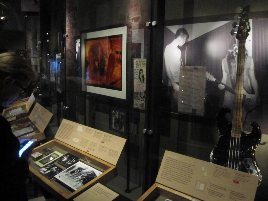
Wall cases and rail cases in area 3.