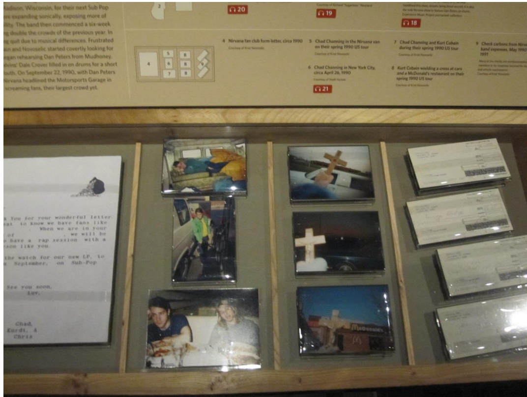
Rail case showing representational objects – snapshots and fan form letter.