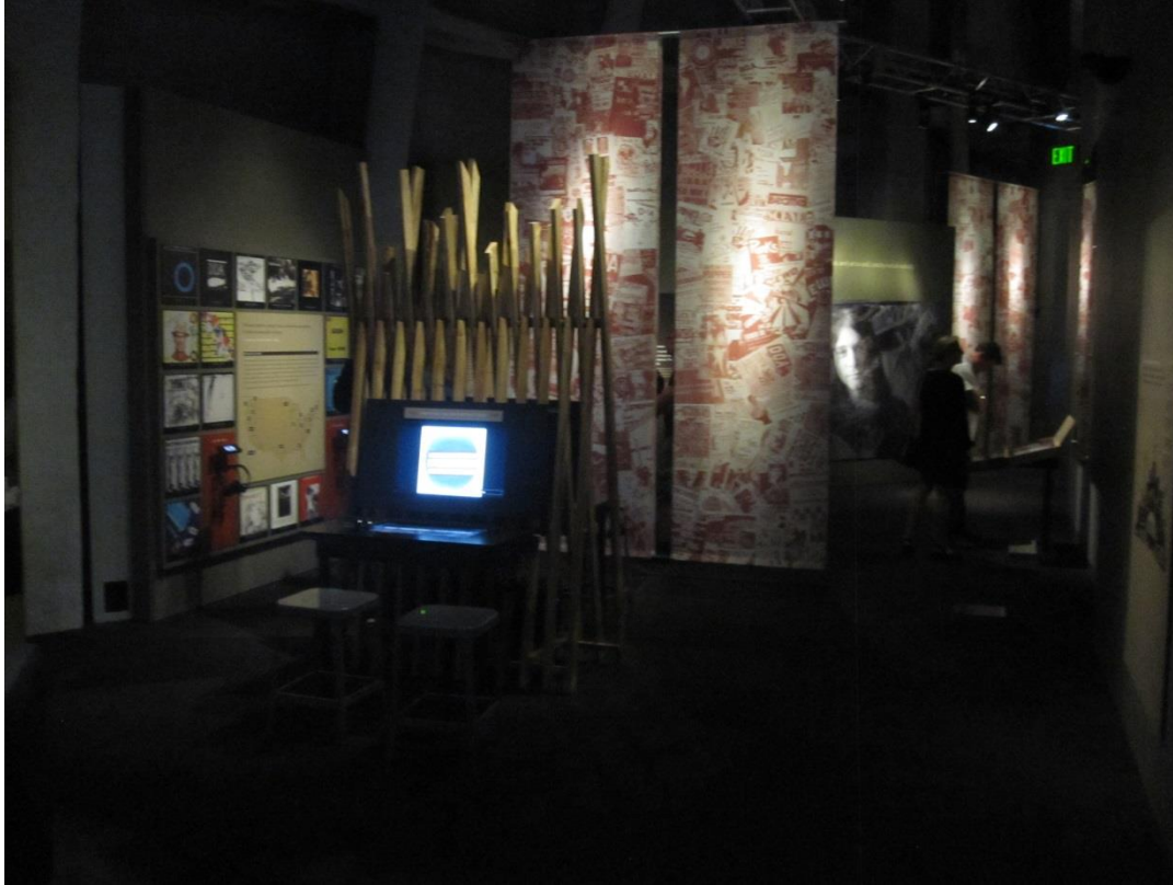
Second area showing interactive kiosk, record wall #1, and hanging dividers.