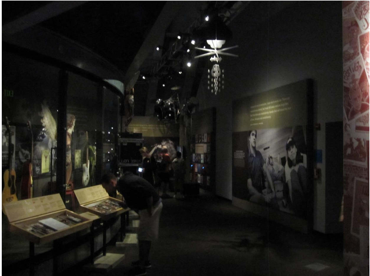
View from end area of exhibit looking toward introductory area (exhibit curves to the left in this photo).