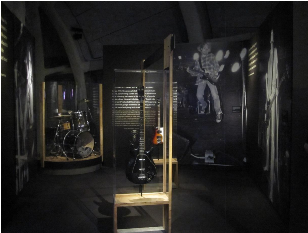
Introductory area of Nirvana: Taking Punk to the Masses .