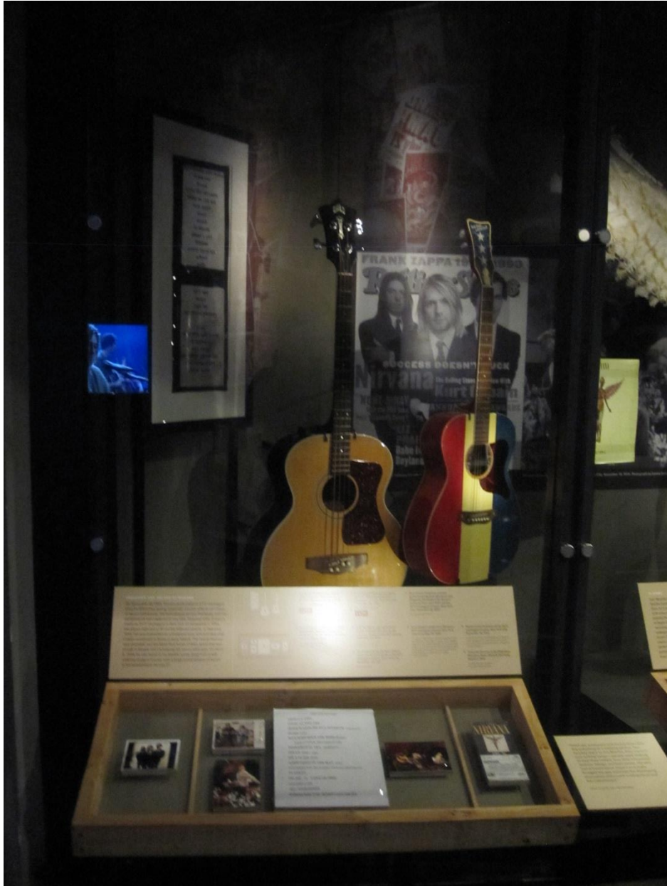
Final wall case displaying Unplugged objects.