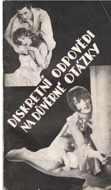
Figure 3: Diskrétní odpovědi na důvěrné otázky

Among the almost thirty items in the collection are Pohlavní zdravotvěda ( co má vědět každý mladý člověk o sobě a druhém pohlaví ) [Sexual Hygiene: What Every Young Man Should Know About Himself and About the Other Sex] (Prague: František Trefný, 1930); and Diskrétní odpovědi na důvěrné otázky [Discrete Answers to Confidential Questions] (Prague: František Trefný, 1929), both depicted above (see Figure 2 and Figure 3 ); as well as multiple issues of the periodical Erotikon: ilustrovaný magazín jemné erotiky [Eroticon: An Illustrated Journal of Soft Erotica] (Prague: Trefný, 1934-35) which contain anecdotes, erotic prose, encouraging and instructive texts by Trefný himself, and are accompanied by numerous erotic photographs and drawn illustrations. Among the ephemeral items acquired are a