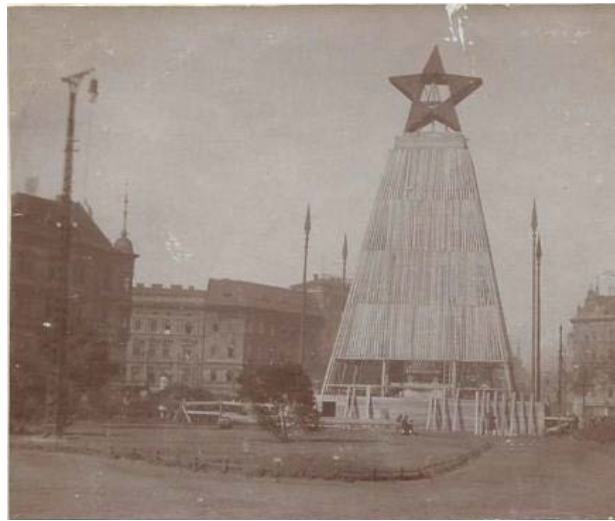
Figure 5: monument at Baross Tér

1919, when it was crushed by a coalition of the Romanian army and Hungarian Rightists. Many of the publications of this period were subsequently destroyed by the victors, lending considerable rarity to the original photographs, drawings, and publications found in this growing collection. In addition to some thirteen monographs, pamphlets and musical scores, the collection acquired original photos of Dezső Bokányi, and Commissar József Pogány delivering speeches in Parliament; and original photos of two unusual monuments: “The Red Globus,” a large construction celebrating the globalization of Marxist revolution subsequently destroyed by the Romanian army in August 1919, and a monument erected at Baross Tér in Budapest, 1919.