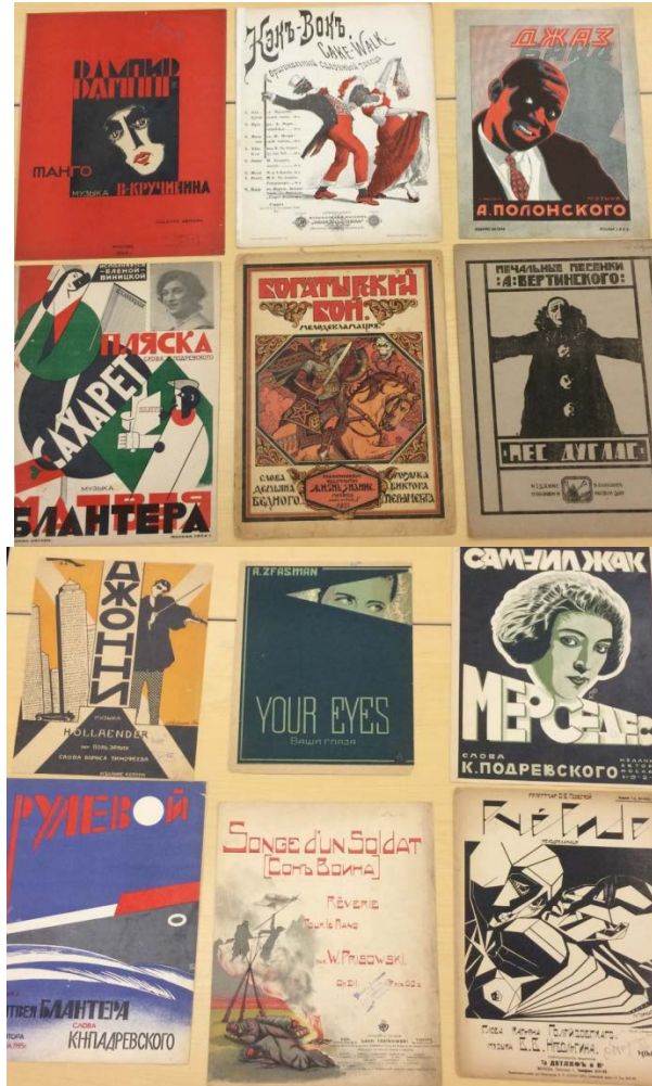
Figure 6: Sampling of sheet music covers from the latest purchase

Among the highlights acquired in 2016 are an original copy of Marko Ristić's inflammatory work Turpituda [Turpitude] (Zagreb: Dragutin Becher, 1938) with seven drawings by Krsto Hegedušić. Described as an illustrated “paranoiac-didactic rhapsody,” an edict was issued empowering the police to confiscate the edition before release and destroy it, so very few original copies survive.