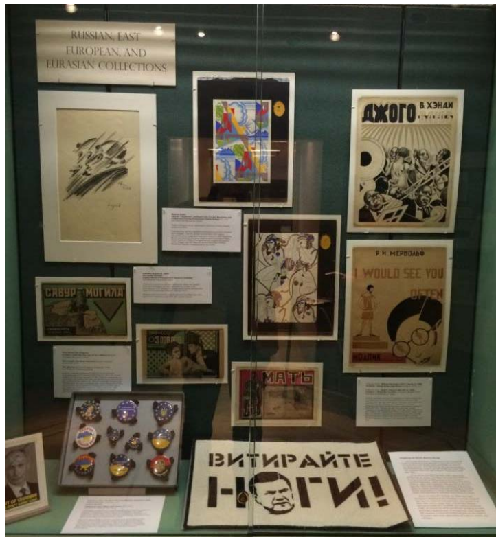
Figure 1: The Russian, East European and Eurasian Section of the Exhibit

unusual materials from Columbia's holdings pertaining to the cultures and languages of our respective world areas: Latin America and Iberia; Sub-Saharan Africa; the Middle East and the Islamic World; South Asia; Eastern Europe; and Jewish Studies. Entitled "Imagining the World: Unexplored Global Collections at Columbia," the exhibition included a small selection of items in seventeen languages, ranging in date from 1454 to 2014. See Figure 1 below. (Robert Harding Davis, Columbia U.)