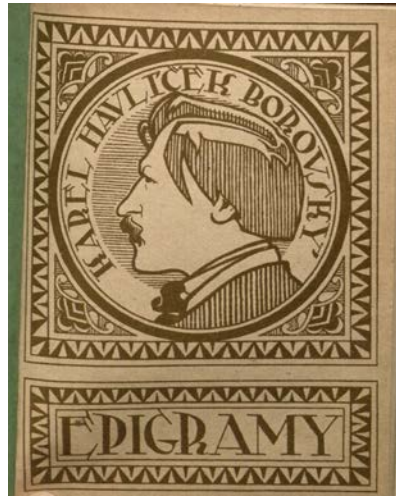
Figure 8: Karel Havlíček Borovský - Epigramy

The Rare Book Collection at Wilson Library, UNC Chapel Hill, acquired a collection of rare publications by the Czechoslovak Legion, produced along the Trans-Siberian Railway during the Russian Civil War and on Allied ships following the Legion's evacuation from Siberia. Of particular note are long runs of Legion newspapers Československý denník , Československý voják and Na stráž , and the complete run of Zadní voj , produced on the American ship U.S.A.T. Logan on route from Vladivostok to Trieste via Southeast Asian ports. Also in the collection are books, journals, pamphlets and maps printed by the Legion in cities like Yekaterinburg, Chelyabinsk and Irkutsk, and including essays by T.G. Masaryk, collections of soldiers' songs, and reprints of classics like Karel Havlíček Borovský and Jan Neruda. The collection was acquired with contributions from the Howard Holsenbeck Gift, the Lawrence Foushee London Fund, the Visegrad University Grant and the Weatherspoon Library Fund. (Kirill Tolpygo, UNC-Chapel Hill)