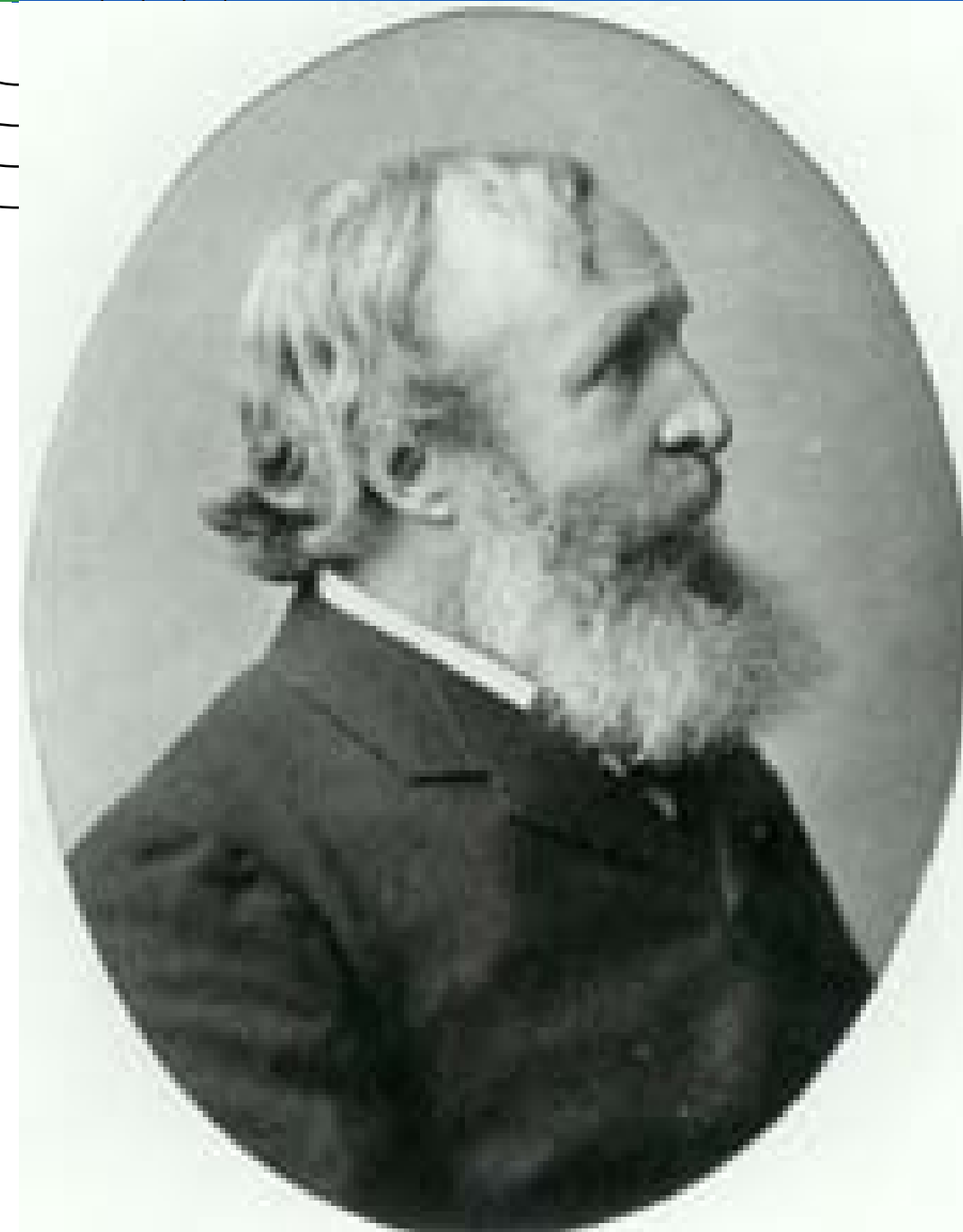
Charles Loring Brace, considered the father of modern foster care and renowned for starting the Orphan Train Movement, and for founding the Children's Aid Society.

This practice was reproduced in other cities with large immigrant populations. By 1929, all 48 states had statutes governing adoption which pushed the federal government to institute adoption policies. Adoption policies have been seen as highly controversial but have put adoption as a sociological issue into the spotlight.