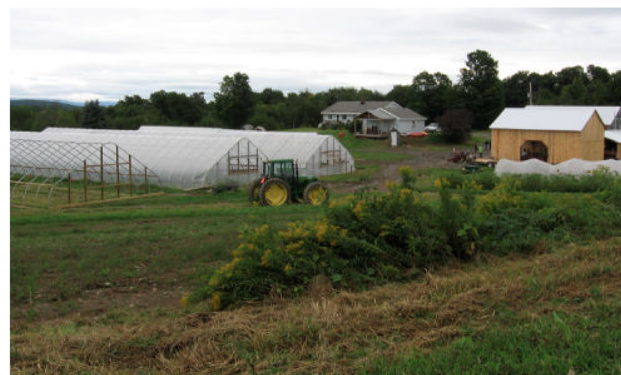
Community Supported Agriculture (CSA)