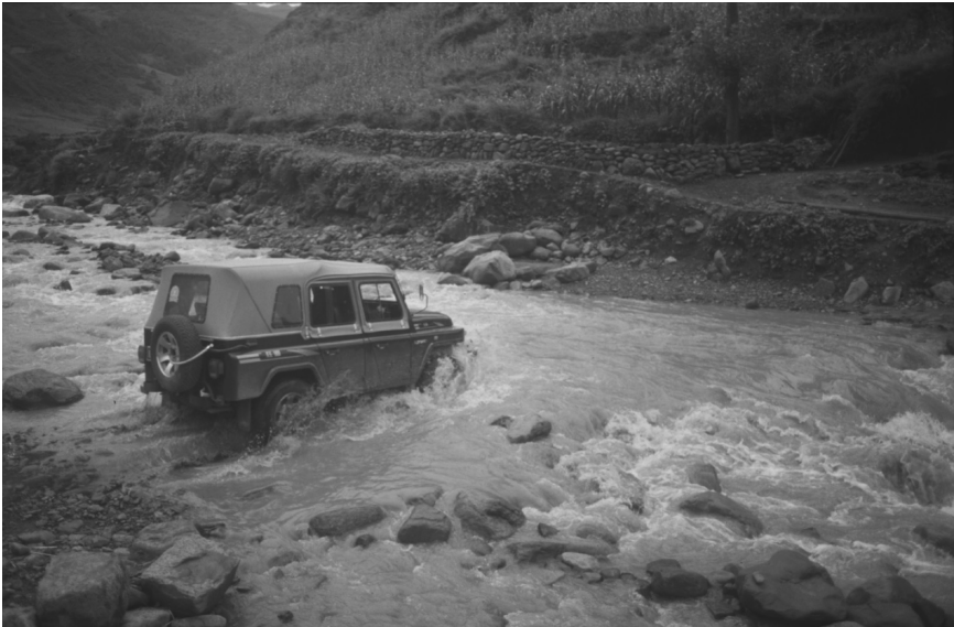
FIG. 1. On the way to visit a village entrepreneur, Meigu County

How can this impoverished county with an average annual income of US$50 per person afford such an inefficient administration? On the streets, Yi men squat together in groups and abandon themselves to alcohol. Cloaked in