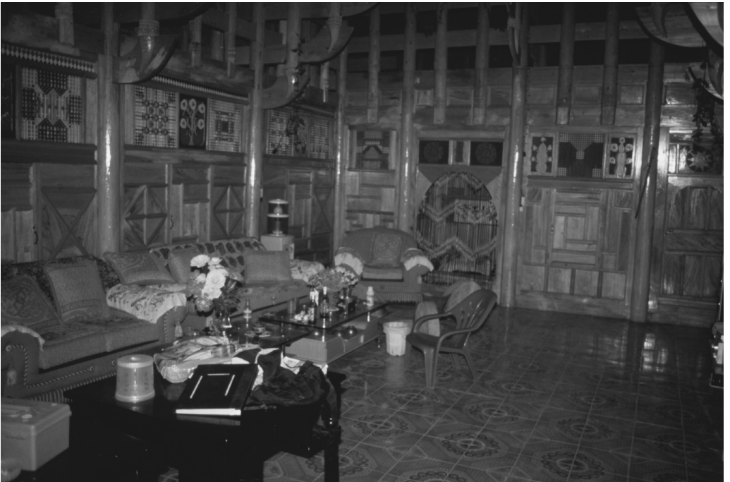
FIG. 13. An entrepreneur's "traditional" house, Meigu County