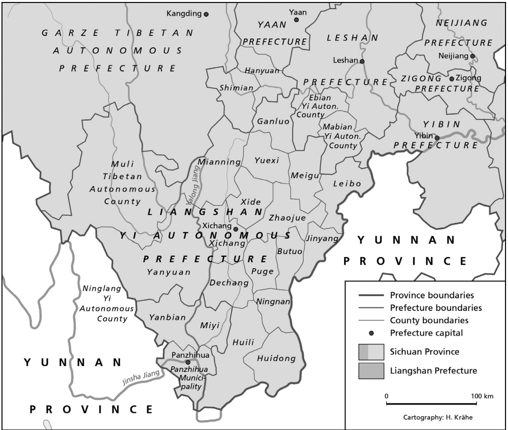
MAP 3. Liangshan Yi Autonomous Prefecture

ple, in salt). Clothing was manufactured on a household basis for family use only. A division of labor between agriculture, craft, and trade was largely absent, 2 and the trading system that had formed in the peripheral areas of Liangshan was limited to trade in everyday goods (Wang Luping 1992). However, there did exist a division of labor by class. As a rule, Black Nuosu (Nuoho) did not participate in cultivation; this was the task of Quho and the lower castes. While livestock rearing was also the domain of the lower castes, breeding livestock was Nuoho's work. But, as argued above—and this point needs to be emphasized—Quho were not slaves by any standard.