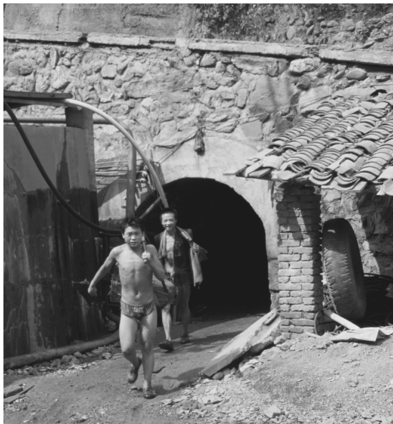
FIG. 4. Workers leaving a private lead mine, Ganluo County

level of education compared to Yi in other county towns because Ganluo has had a school system since before the founding of the People's Republic. Thus, it was surprising to find that the percentage of companies owned by Yi entrepreneurs was smaller than the percentage of Yi within the population; although Yi made up 65 percent of the population, only 22 percent of the entrepreneurs were Yi.