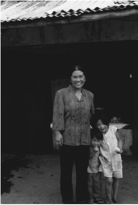
FIG. 8. An entrepreneur of Han slave origins with her children, Zhaojue County