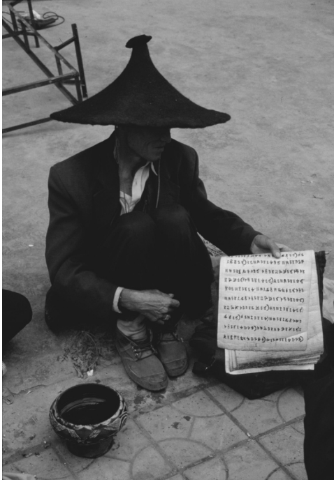
FIG. 3. A bimo telling fortunes on the streets of Puge County