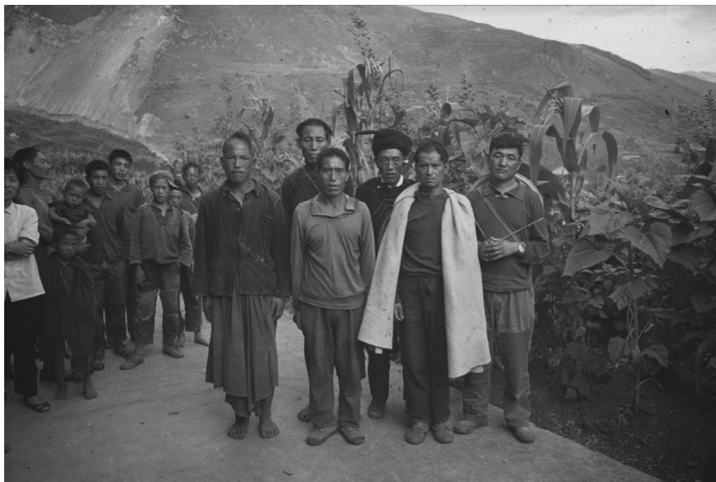
FIG. 11. A rural Nuosu entrepreneur with his staff, Xide County