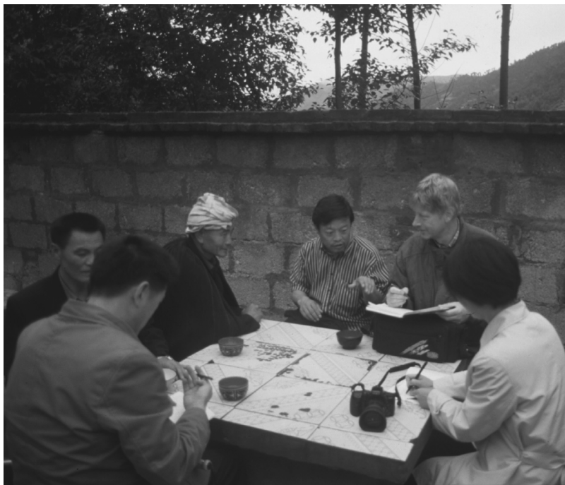
FIG. 2. The research team interviewing a Nuosu entrepreneur (third from left), Meigu County

Xichang, and was sponsored by the German Volkswagen Foundation. Field research was conducted in 10 of the 16 counties that make up Liangshan Prefecture. Our research team visited Ganluo and Mianning in 1999, Zhaojue and Yanyuan in 2000, Leibo, Meigu, Butuo, and Puge in 2001, and Xide and Jinyang in 2002. The empirical part of this research was carried out using a combination of qualitative and quantitative research methods that provide different types of information and are appropriate to particular aspects of the research. For example, politically sensitive questions, such as those related to ethnicity or ethnic identity, could not be posed in questionnaires. Altogether, 138 private entrepreneurs were interviewed using a questionnaire and qualitative interview techniques, for which a series of semi-standardized, open-ended questions was prepared. In each county, 8 to 10 local county, township, and village officials were interviewed, and statistical data and written material were obtained from Party and government documents and publications.