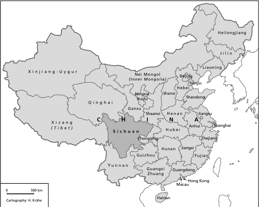
MAP 1. China