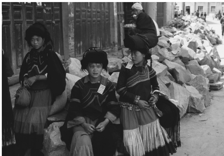
FIG. 10. Workers in a private enterprise, Yuexi County