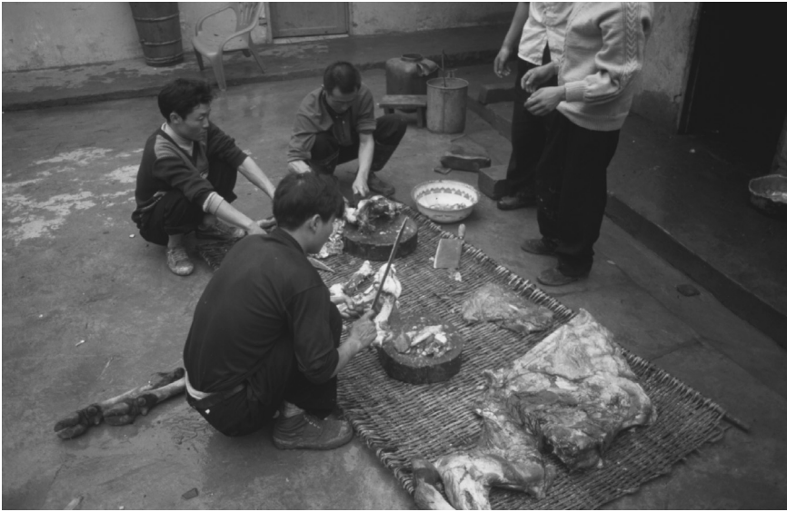
FIG. 14. Preparing tuotuurou for the research group at the home of a Nuosu entrepreneur, Meigu County

regarding prosperity, wealth, property, and luxury. They are also role models for behaviors and values concerning competition, economic freedoms, innovation, and market behavior, and they promote new structures as well, such as organizations representing their interests, local level public income structures, and the labor market.