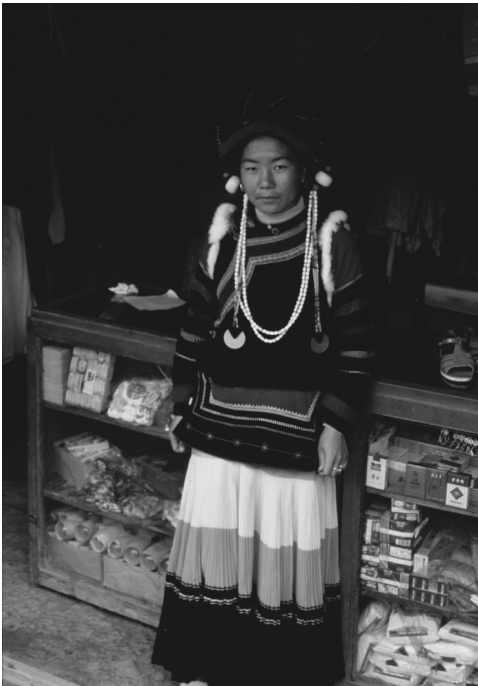
FIG. 9. A shopkeeper in one of her shops, Yanyuan County