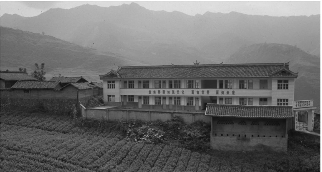
FIG. 7. School funded by a Nuosu entrepreneur, Ganluo County

The second group of donors gives money, goods, and services not for productive use but to meet their basic needs, overcome everyday problems, or for ritual purposes. Such donations fulfill social obligations, and meeting these obligations generates social capital within the clan or the village. Payments for ritual purposes are especially important in determining a per-