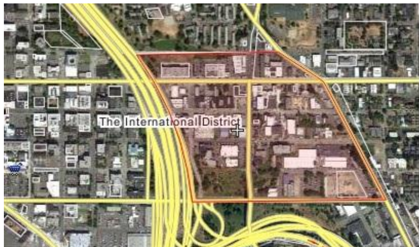
Map Source: City of Seattle Department of Planning & Development, Livable South Downtown