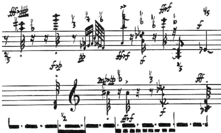
Score for John Cage's Music of Changes

The creation of sound, heard as elevated above the rest, has long been considered an act of power. In the case of music composition, the writing of music has been associated with ultimate control and authority – the ability of