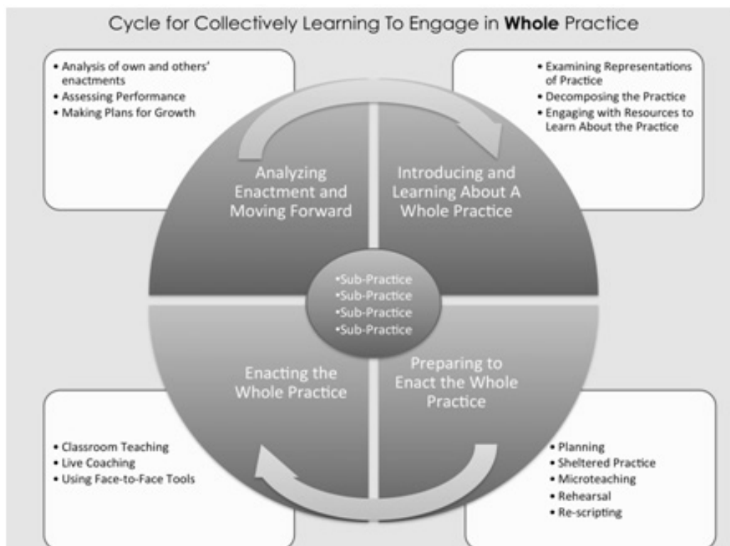
Figure 4: The Learning Cycle

While each program may have had an overall commitment to implement the learning cycle, each program had varying opportunities to provide TCs to with particular components of the learning cycle. In U-ACT, while the learning cycle was used widely to provide instruction regarding the core practices in literacy and math, programmatic constraints did not allow TCs to analyze or reflect on their practices regarding differentiating instruction for diverse learners in a formal setting.