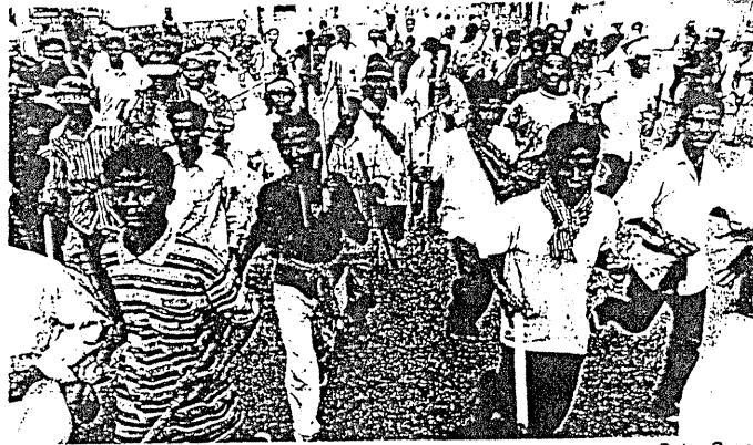
LOOKING FOR TROUBLE