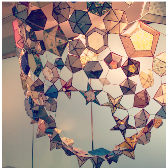
Figure 5: Images of works from the Some Assembly Required show in Albany