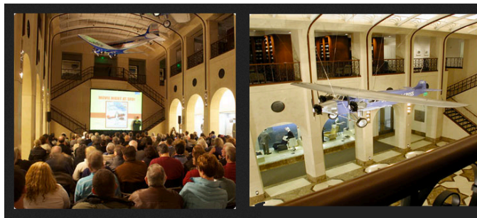
Figure 2: Images of the Louis A Turpen Aviation Museum and Library

Civil Air Transport. The exhibitions outside of the Aviation Museum and Library delve into a variety of content. There were exhibitions on travel souvenirs, board games, Hindu sculpture and Asian ceramics (both from the collection of the Asian Art Museum), and Shaker furniture among others. There are three exhibition spaces that are dedicated spaces for photography exhibits. The museum produced 38 different exhibitions in 2011 and “when AAM came through to do [the] accreditation the reviewing team said [they] do more shows per year than the Metropolitan does.” 39