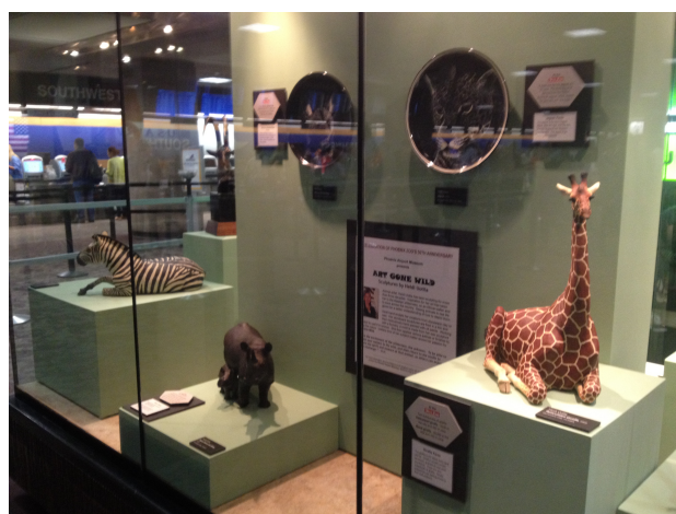
Figure 4: Picture of the Art Gone Wild exhibit.

The museum does not have education programs. They do not conduct tours and except for individuals at the information desk and airport “navigators” whose job it is to help passengers with queries, there is no staff on site to interpret the exhibitions. They have in the past had receptions for exhibits, but they are on a small scale and the initiative of the artist having his or her work shown, not the museum.