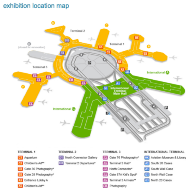
Figure 3: Map of SFO Museum exhibition spaces in the terminals