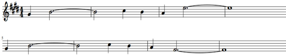
Figure 2 "Marlboro Man" Horn Call

The first of these motives imitates Copland's style in El Salón México . El Salón México depicts a dancehall in Mexico City of the same name, where Copland spent time while traveling. The Cuban danzón was popular at the time, and Copland may have internalized its characteristic clave as Mexican music. In Copland's attempt for El Salón México to capture the sound world of Mexico, he ended up conflating national styles and creating a starting point for them to continue to be conflated in American popular culture. It is this style that becomes part of the Coplandia canon, as evidenced by its use in the Marlboro Man commercials. In addition to Copland's use of Cuban styles for a piece that would seem to be incorporating Mexican styles, musical and cultural blending across the US-Mexico border allows for some similarity between styles of Mexican music and music from the Southwestern United States. In El Salón México , Copland captured a sound that blends Cuban, Mexican, and American folk styles, bounded in a classical medium. Such blending occurred in a geographical region commodified in exaggeration by acts like Buffalo Bill's Wild West. Beth E. Levy explores the Wild West as part of an imagined America, identifying it as a circus-like extravaganza. 12