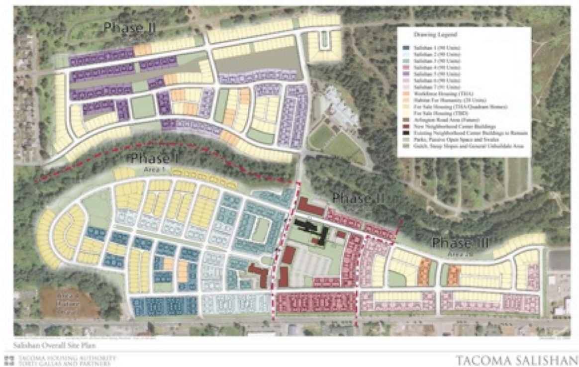
Figure 4.1: Site Map of Salishan (THA, 2013a)

subsidized THA housing) from 2004-2007, then Area 2A (90 units of subsidized THA housing) and 3 (180 units of subsidized THA housing) from 2007-2010; and finally Area 2B (91 units of subsidized THA housing) from 2010-2011. The final bundle of THA housing was completed without tax credits. Quadrant Homes and Habitat for Humanity built 118 market rate and subsidized homeownership units in Area 1 at the same time as the rest of Area 1 was built up, and Korean Women's Association built 55-units of affordable senior units as well. A Clinic went into Area 2A, as well as another 55 units of affordable senior housing. Habitat for Humanity, Benjamin Ryan Communities and Quadrant Homes built 39 houses in Area 3. However, because of the Great Recession, Salishan's location in a neighborhood with relatively low home values and its share of foreclosures, the majority of the homeownership units in Areas 2B and Area 3 were not built until 2014-2015. 213 lots have been sold to DR Horton, who is