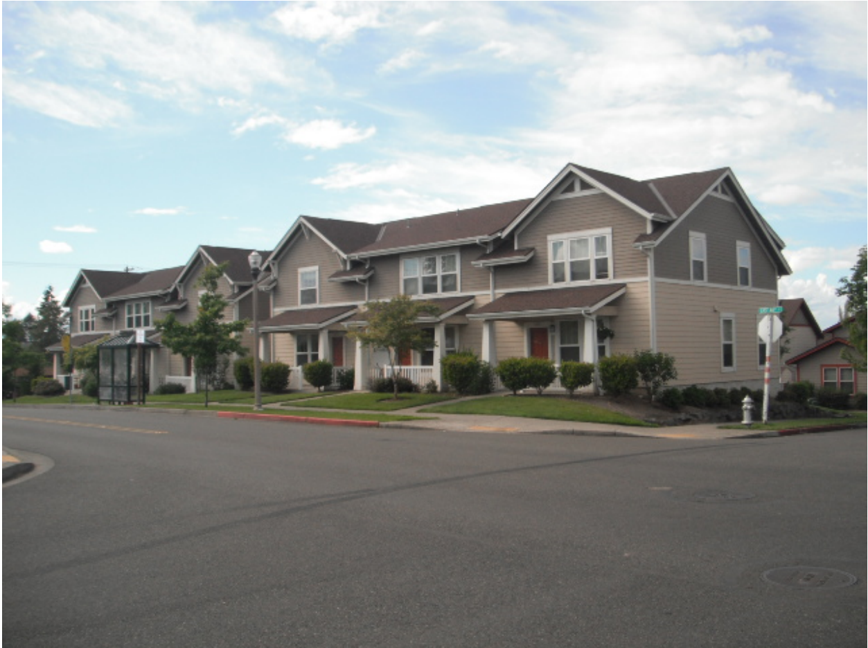
Figure 4.2 – New Urbanist design in Salishan.

neighborhood look middle-class instead of like a slum (see Figure 4.2).