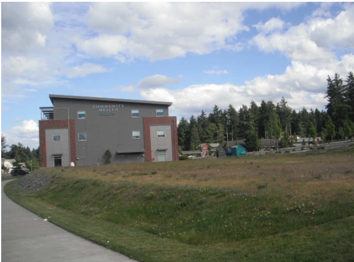
Figure 5.4: The site of Salishan’s future Education Training and Retail Center

This imagination is only complicated by a walk through the neighborhood and conversations with residents and ground-level service providers, who offer much more complex and nuanced narratives about Salishan, its redevelopment and everyday life in the neighborhood. While the neighborhood has seen many successes, its redevelopment has been extremely