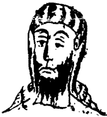
Notker Balbulus - 11 th -century drawing

One monk who lived at the Abbey of St. Gall in Switzerland turned his creative energies to helping himself and others memorize those long melodies in the early 900s. This monk, Notker Balbulus (Notker the Stutterer, ca. 840 - 912 A.D.) complained that the long melodies taxed his "little memory," and so he began to write poetry to be sung to those melodies. You will be hearing some of his poetry, known as sequences, in the second half of the program.