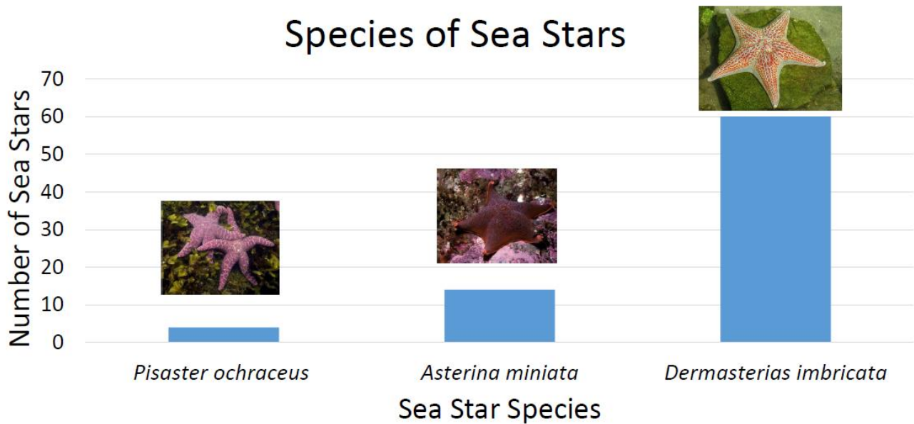
Figure 3. The variation in species in Nootka Sound, with a large majority being the D. imbricata .