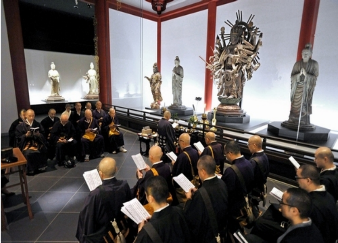
Figure 14: Priests inside Todaiji Temple Museum performing ceremony in front of kaigen statues