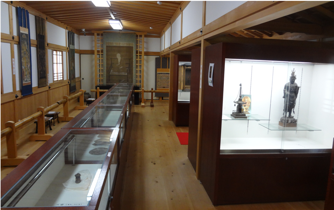
Figure 3: Museum at Taimadera Temple