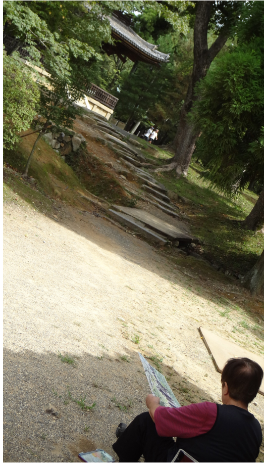
Figure 9: Woman doing watercolor at Tofukuji Temple