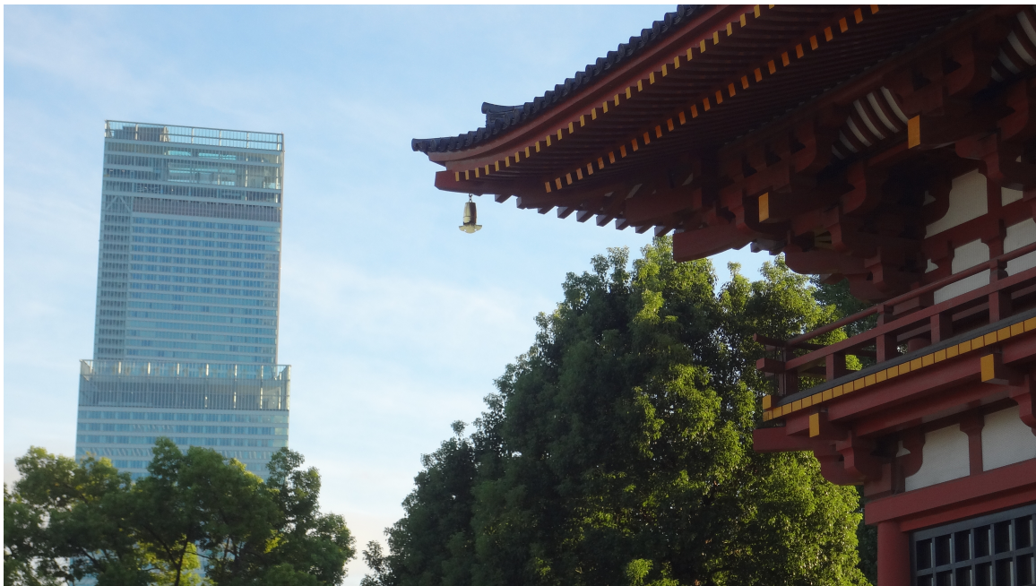
Figure 7: Ancient Shitennoji Temple and Modern Osaka City Skyscraper

The presence of Japanese Buddhist temple museums in Western scholarship is limited to brief mentions within more largely discussed topics of Japanese materiality and object interpretation and the history of Japanese Buddhism and display practices. This study hopes to fill this gap in literature and form a basic foundation from which further study can be pursued. This literature review will describe what we know now about the Japanese Buddhist temple museum based on studies on related topics. By examining the elements that have contributed to its formation through history, we can start to place the emergence, nature and role of temple museums into context. These elements include the changing interpretations of sacred objects in Japan, pre-modern display practices of temples, introduction of heritage legislation, the first museum prototype, and where temple museums fit within the landscape of Japanese museums.