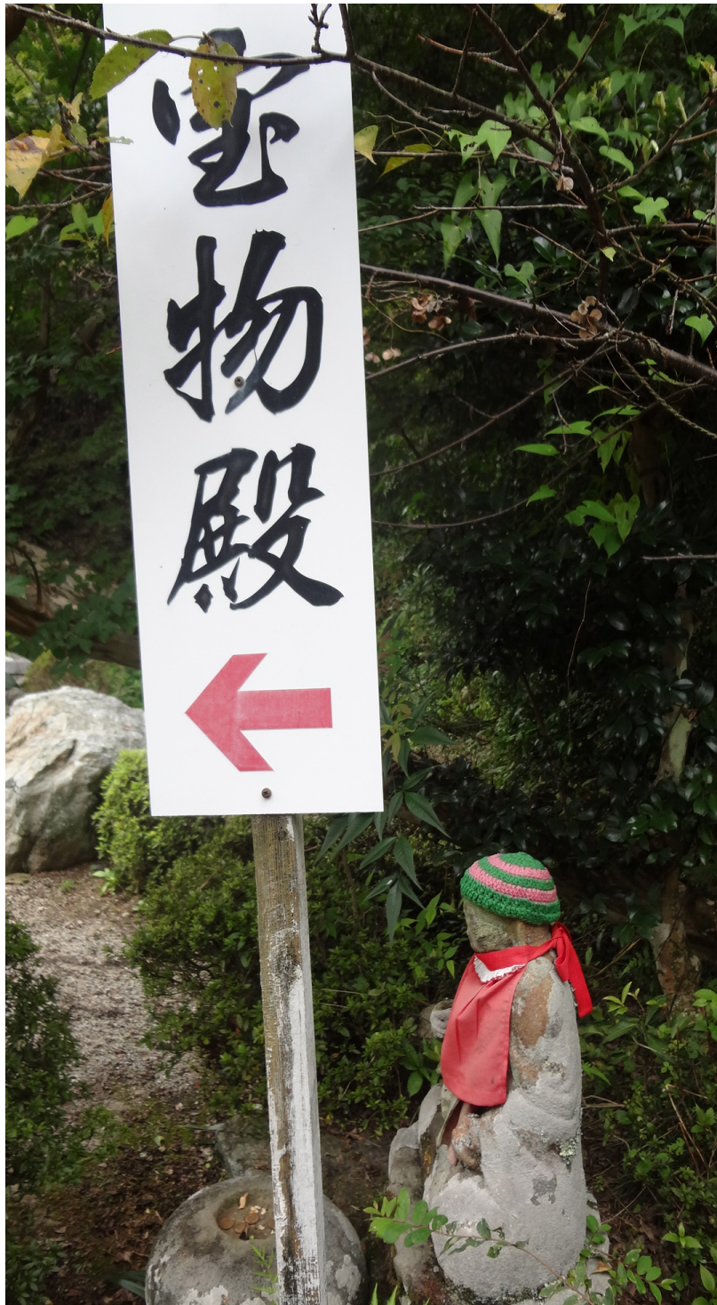
Figure 18: Sign in Taimadera Temple Garden pointing towards the Houmotsuden (Temple Museum)