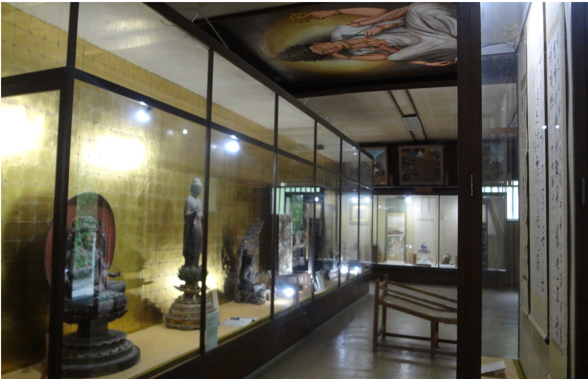
Figure 2: Museum at Nyoirinji Temple