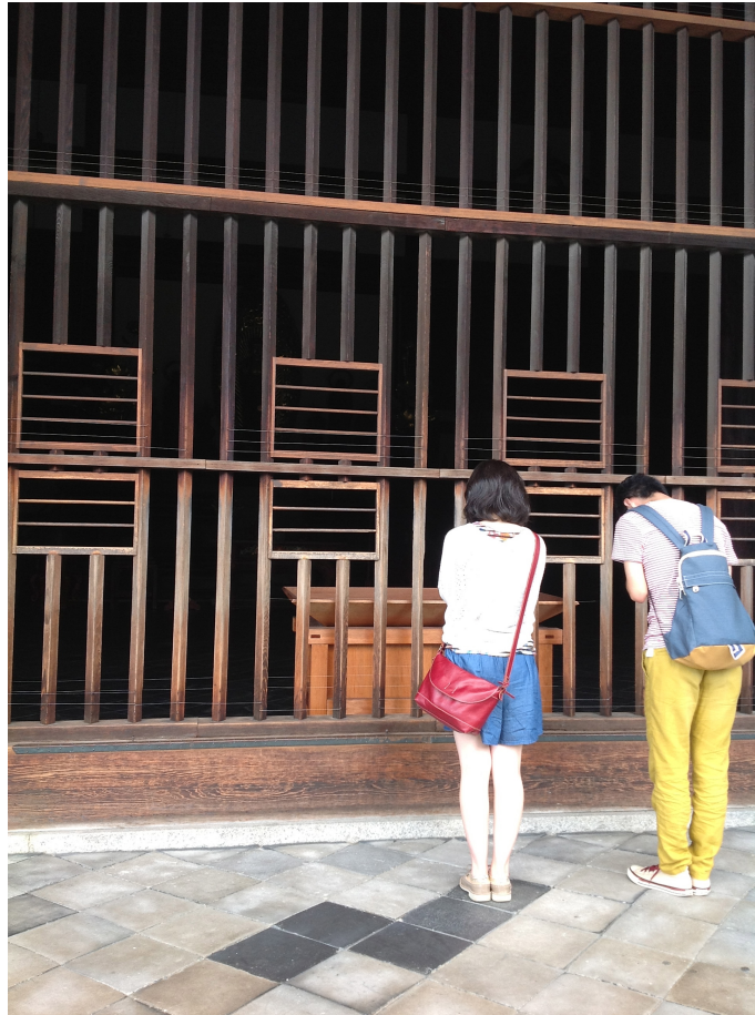
Figure 16: Couple praying at Shitennoji Temple