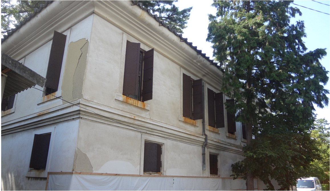
Figure 5: Ancient kura (storehouse) at Zentsuuji Temple