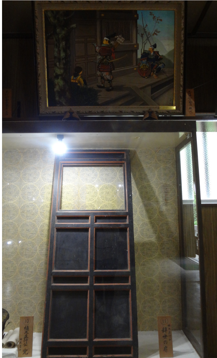
Figure 13: Door with Kusunoki Masatura's farewell message at Nyoirinji Temple Museum

Five of the 42 responses mentioned the temple museum as a revenue generator. While some warned of a reluctance for temples to admit to a monetary element in their dealings with the public, others noted that adding a museum to the temple grounds did not necessarily result in high financial gains, since admission fees went to operational costs and/or the general temple budget. Another response focused on the financial