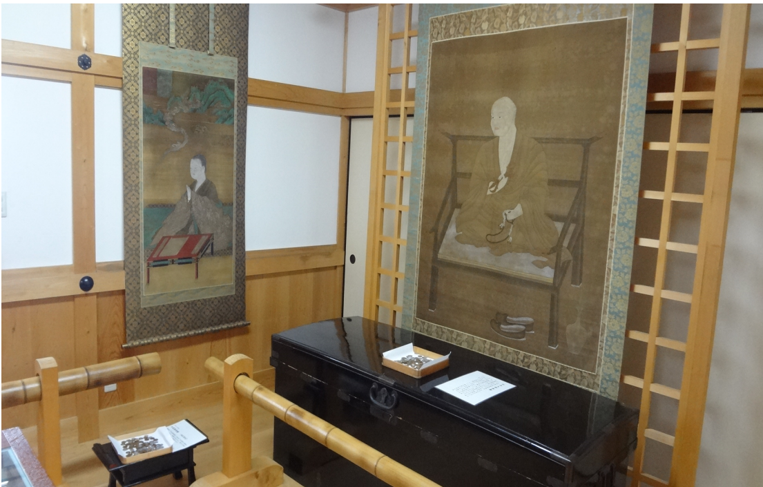
Figure 15: Saisenbako (donation boxes) placed in front of scrolls at Taimadera Temple Museum indicating that worship is intended