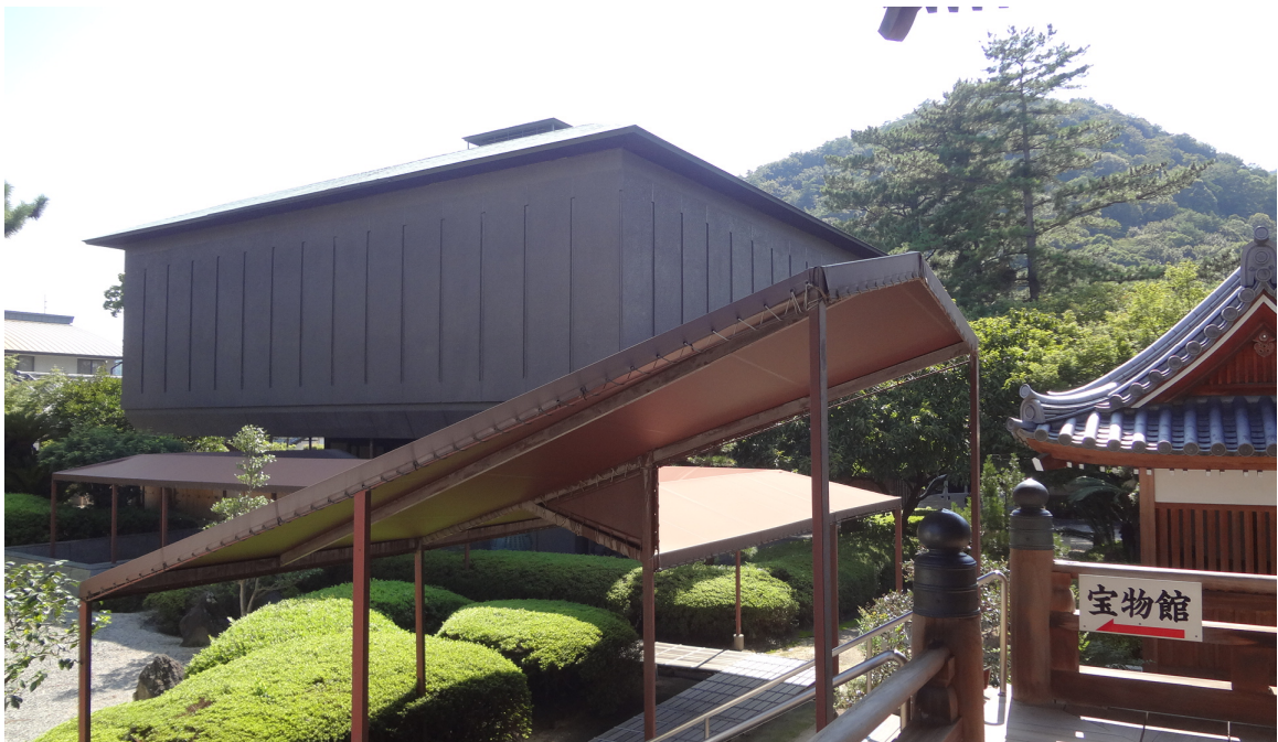
Figure 6: Modern museum at Zentsuuji Temple