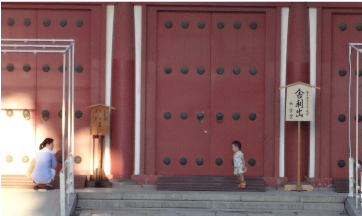
Figure 10: Mother and child spending time walking the grounds of Shitennoji Temple