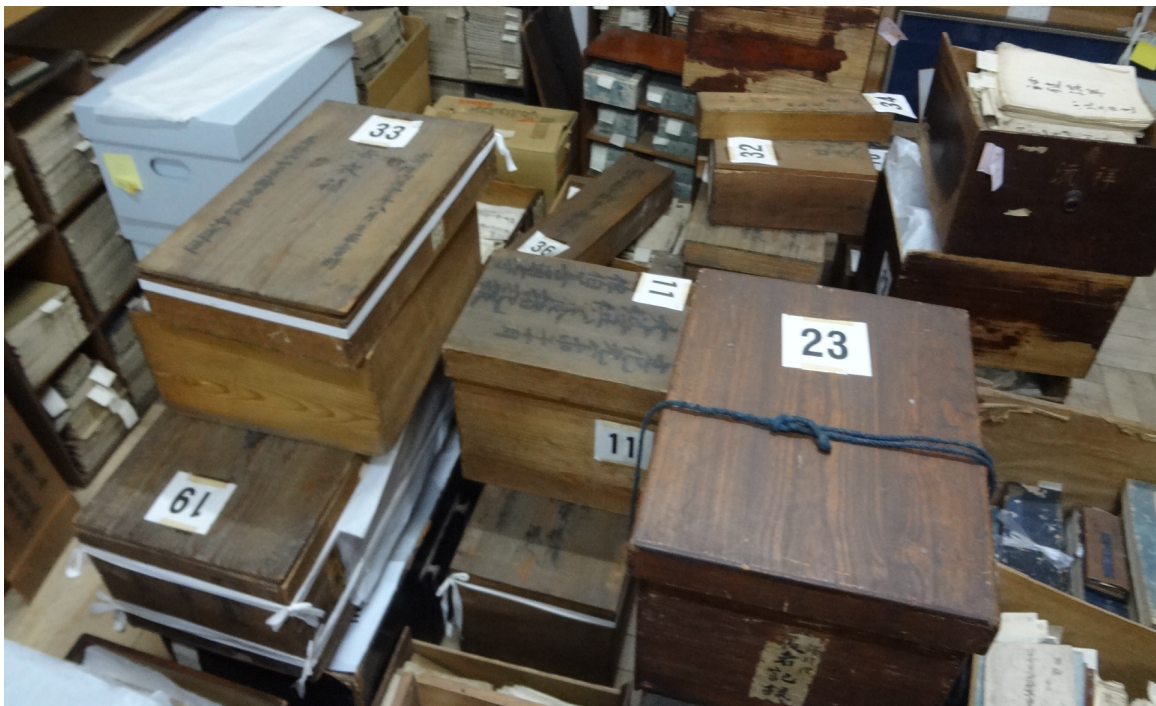
Figure 12: Collection Storage at Zentsuui Temple Museum