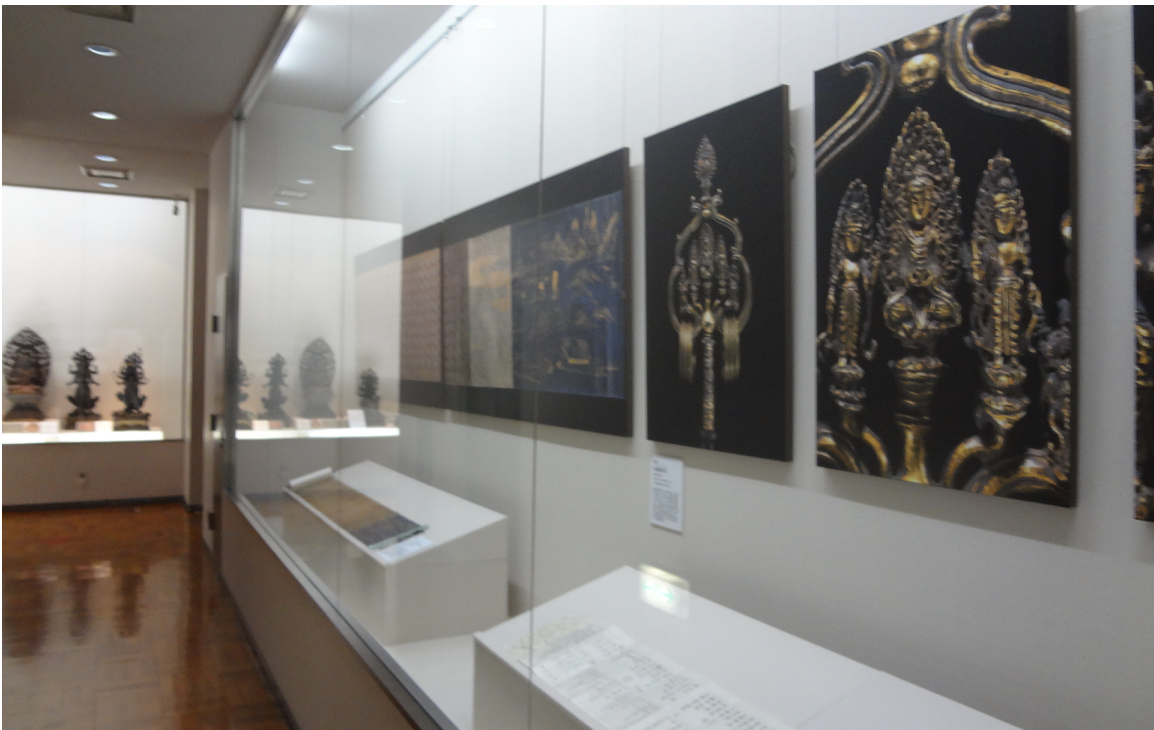
Figure 4: Museum at Zentsuuj Temple