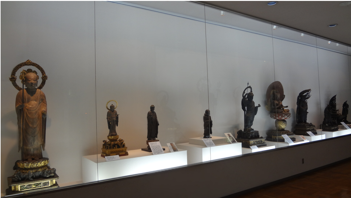
Figure 8: Hakken (soul removed) Buddha statues at Zentsuui Temple Museum

Edmund Leach (1983) explains this contextual phenomenon, saying icons are part of the “space syntax” of sacred buildings and that objects of devotion cannot be removed from this context without changing their nature. The visitor discomfort at seeing the Kudara Kannon statue in an unexpected environment, that of a museum, was due to the object of devotion having been removed from the “space syntax” of the temple. The temple museum, the ambiguous space between secular and sacred, has a new kind of “space syntax” that requires visitors to reinterpret the object of devotion inside it.