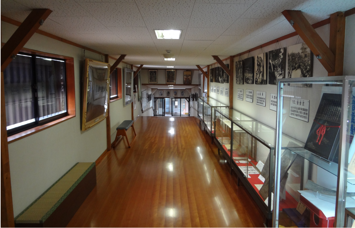
Figure 1: Museum at Saidaiji Temple