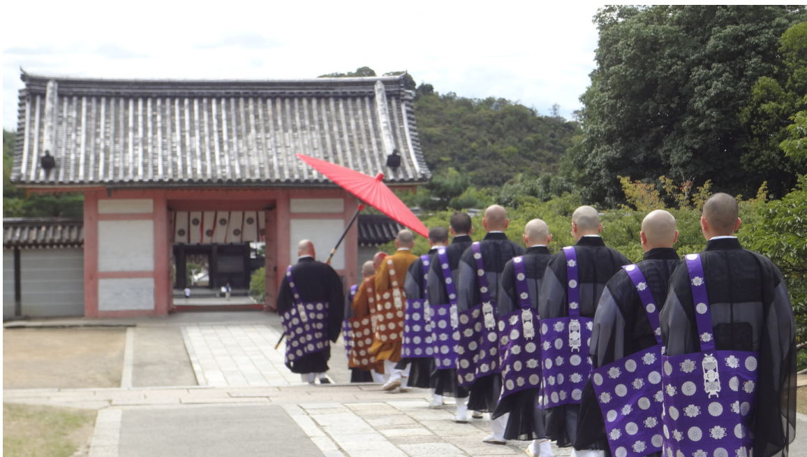
Figure 17: Priests at Tofukuji Temple