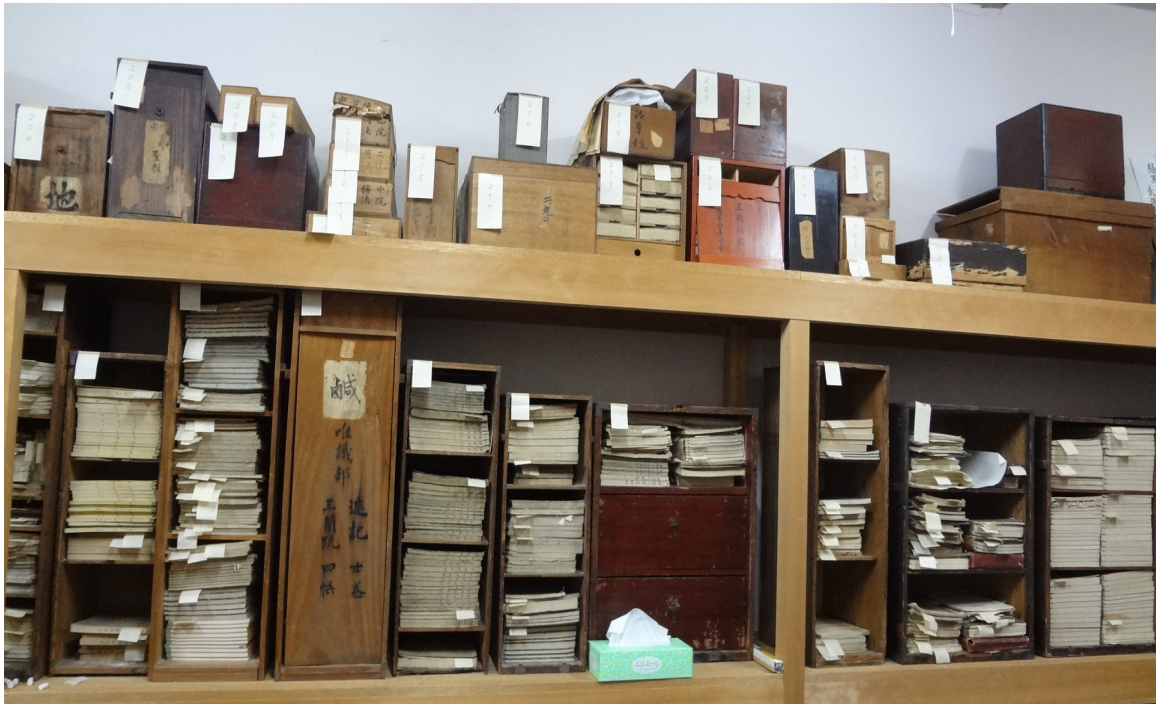
Figure 11: Collection Storage at Zentsuui Temple Museum