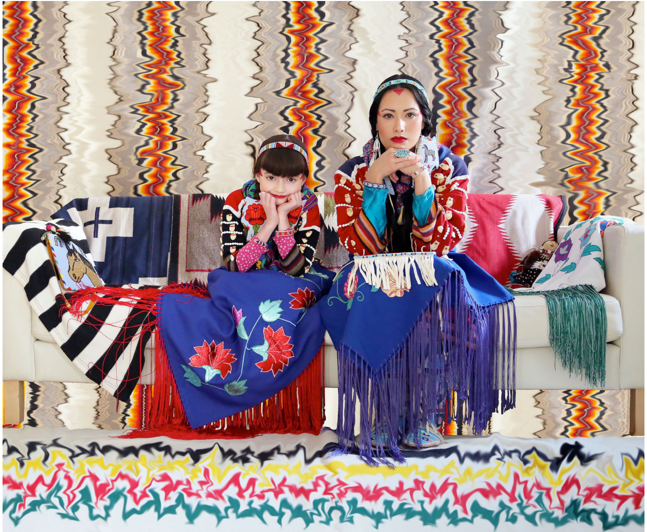
ix. Wendy Red Star Apsáalooke Feminist 1, 2016 Digital print on silver rag, 34 x 40 in