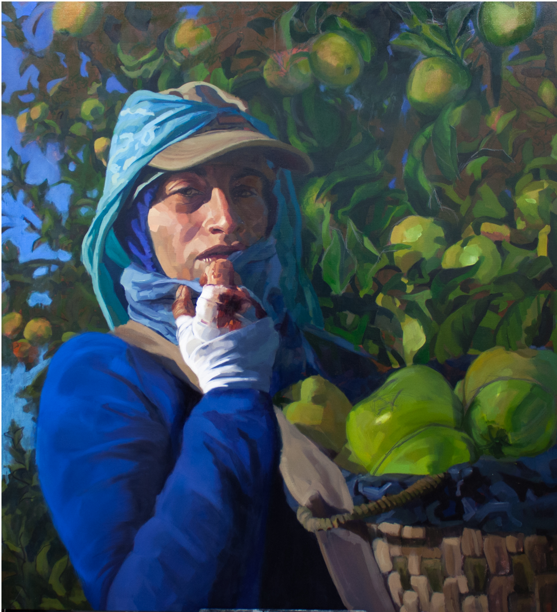
iii. Arely Oil on Canvas 65.5 x 60 in