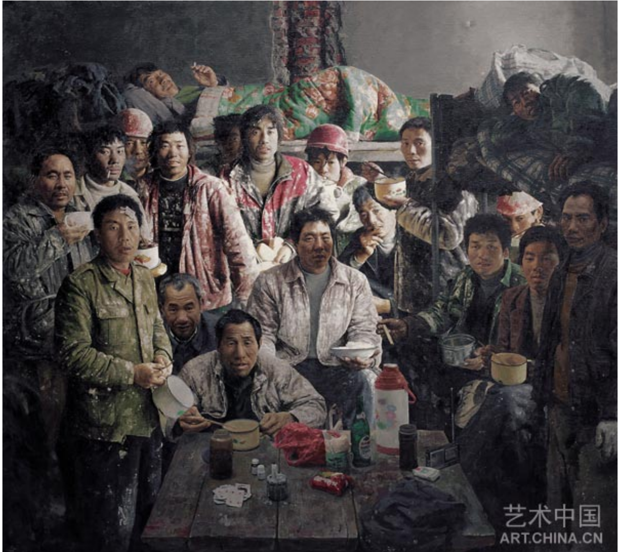
vii. Xu Weixin The Worker's Place Oil on Linen 200 cm x 220 cm