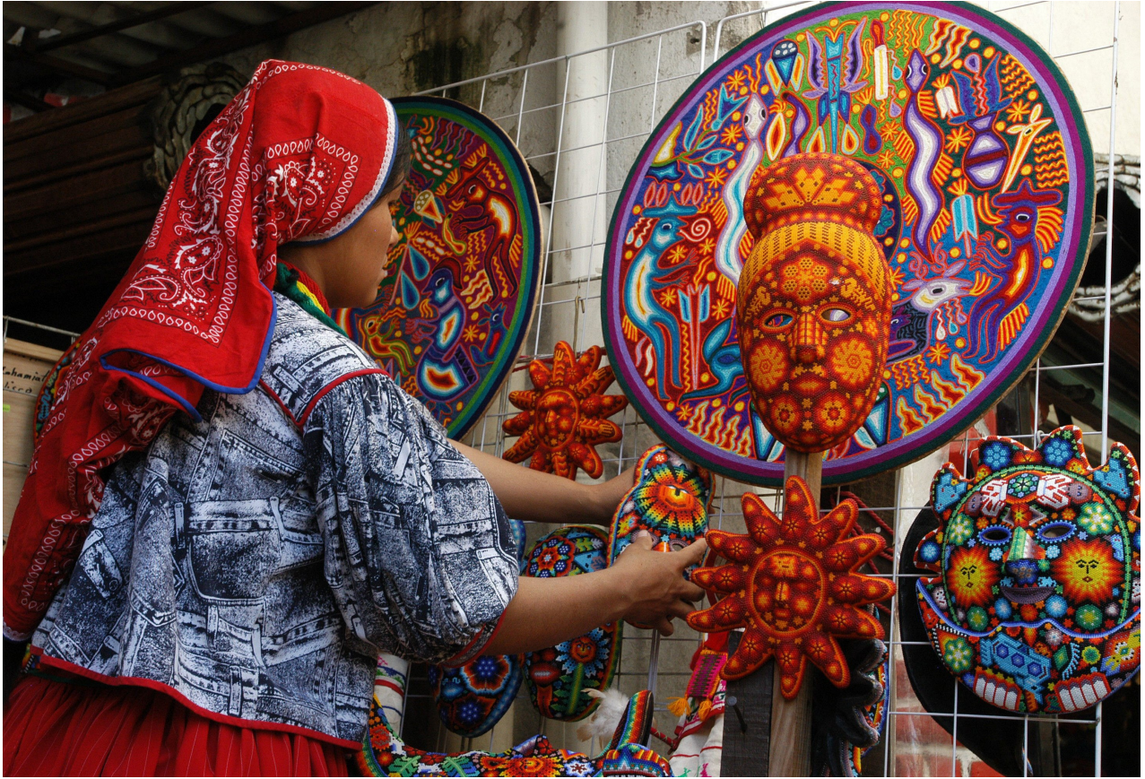
xi. Huichol Indigenous group from Jalisco, Mexico.