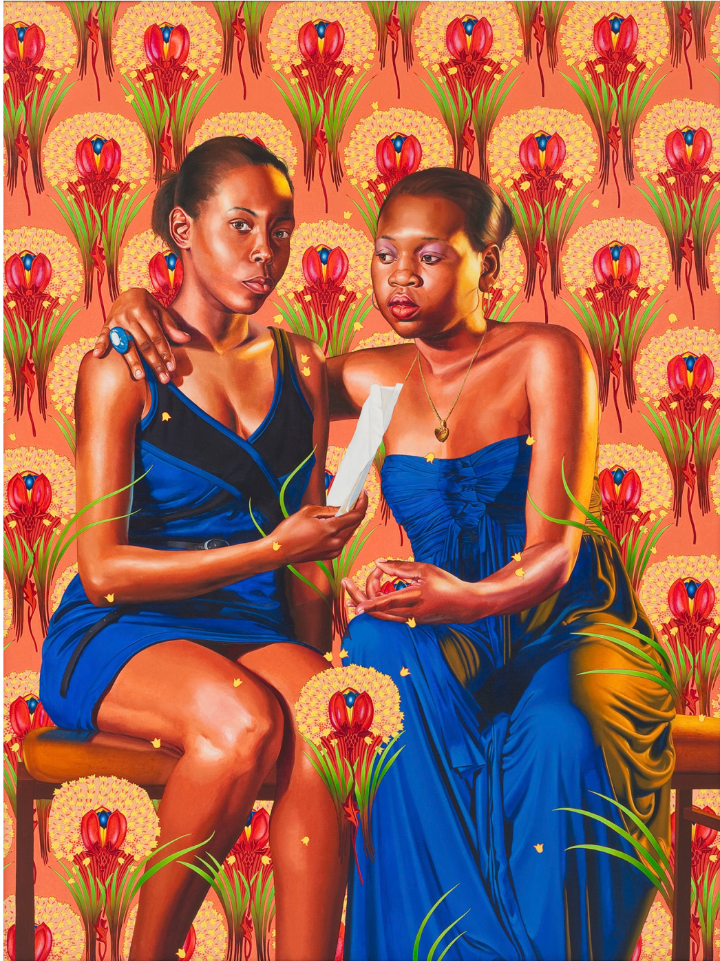
iv. Kehindy Wiley The Sisters Zenaide and Charlotte Bonaparte Oil on Linen 83.5 x 63 in