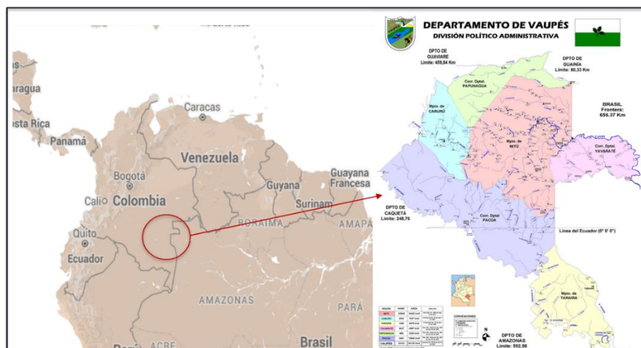
Figure 1: Map of Colombia and Vaupés province