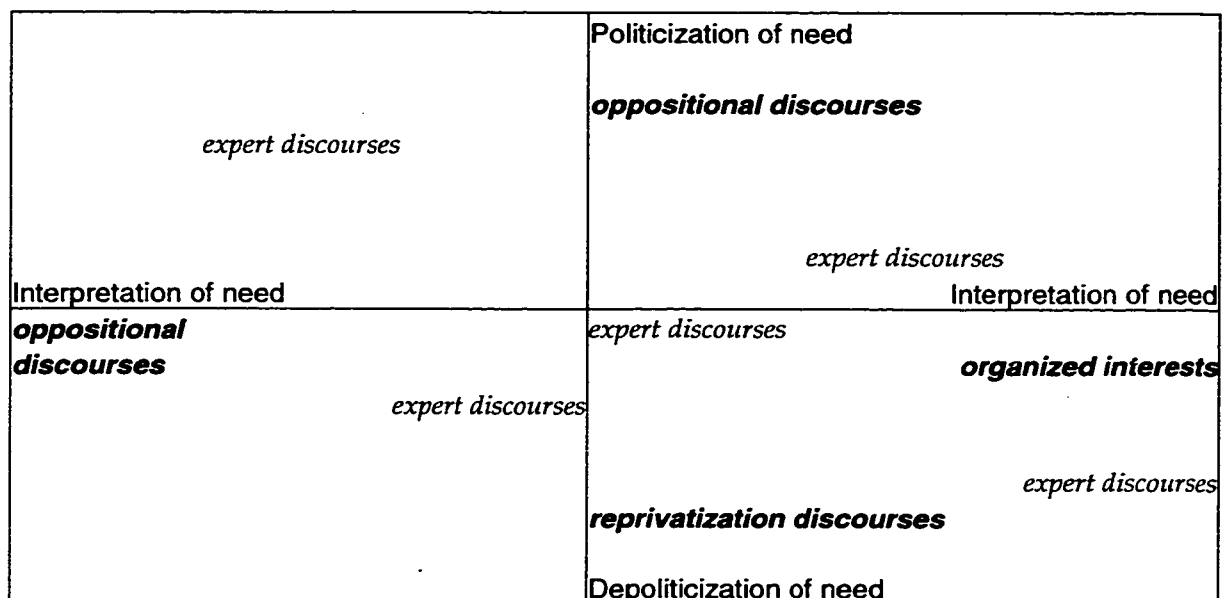
Figure 1. Schematic of the politics of need interpretation 84

Three key points emerge from this outline of Fraser's (outline of a) theory. The first is that there is no indication of the level of governance – i.e., local, regional, national, EU, international – or its significance to the nature of any of the discourses mentioned. It may be that this framework maps neatly onto any level of governance: we could, for example, simply copy the plane of this graph and stack the copies to indicate the multi-dimensionality of political discourse in the “real” world. Yet this would not overcome the problem of depicting relationships between discourses at different levels. To convey that sort of relationship, which is precisely the relationship I have been elaborating in the preceding chapters, we would need to draw “fingers” emanating from one plane and piercing the others. If we were depicting EU social policy in particular, the majority of these fingers would “point” from the EU plane to