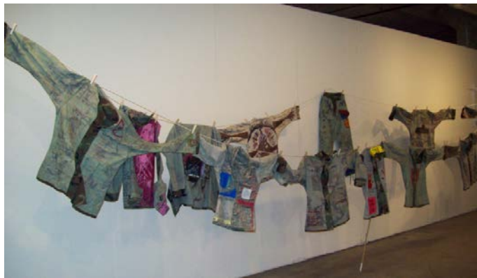
Overlooked/Looked Over , NVAM

The exhibit Overlooked/Looked Over , features art created by eight women veterans and is meant to give an insight into the way women see themselves and their experiences during war and as members of the military. The exhibit title is taken from a quote allegedly made by the actress Mae West: “I’d rather be looked over than overlooked.” Erica Slone, the curator for the exhibit sees this as an opportunity to address the “false dichotomy of attitudes about women and the way these polar attitudes toward women are exacerbated within our armed forces.” (NVAM, 2012) Slone, an Air Force veteran who served from 2002 to 2008, elaborates on this: “The dichotomy is that women are either viewed not at all, or through their sexuality. That exists within civilian society, but it’s exacerbated in the armed forces. I think it has to do with conditioning, creating people to be super-aggressive. In order to train people to kill, you have to train them to see their targets as ‘others.’ Unfortunately, women servicemen tend to fit in that category.” (Trice, 2012)