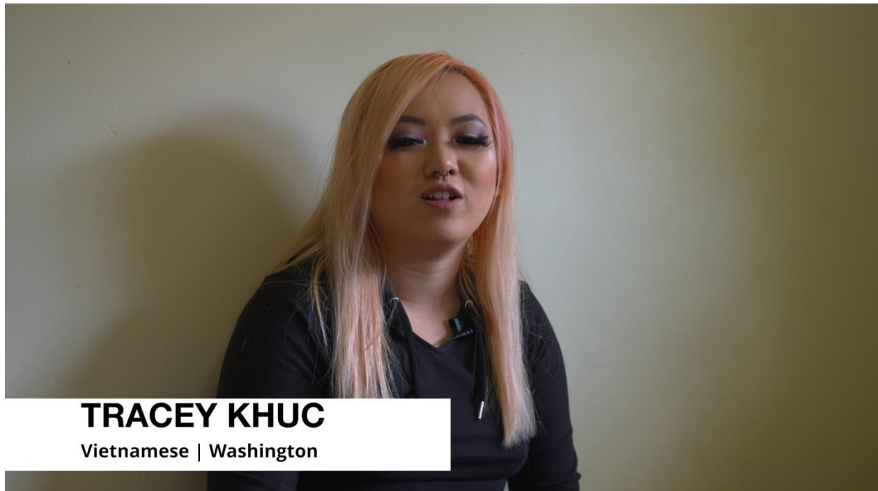
Figure 3. Screenshot from documentary film of in-person interview.