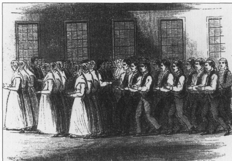
FIG. 2. "The Dance," an engraving after a drawing by Benson John Lossing, Harper's New Monthly Magazine , July 1857, p. 169.