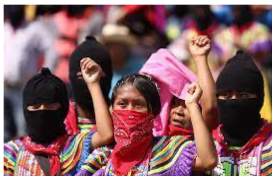
Figure 9. Members of the EZLN (Zapatista Army) in traditional red and black face coverings, the colors of the EZLN flag.

The camera then zooms in on the cross on top of the new basilica, which was built next to the old one when the original edifice was being repaired after a bombing in 1921 (Kraft). This section begins with these lyrics: