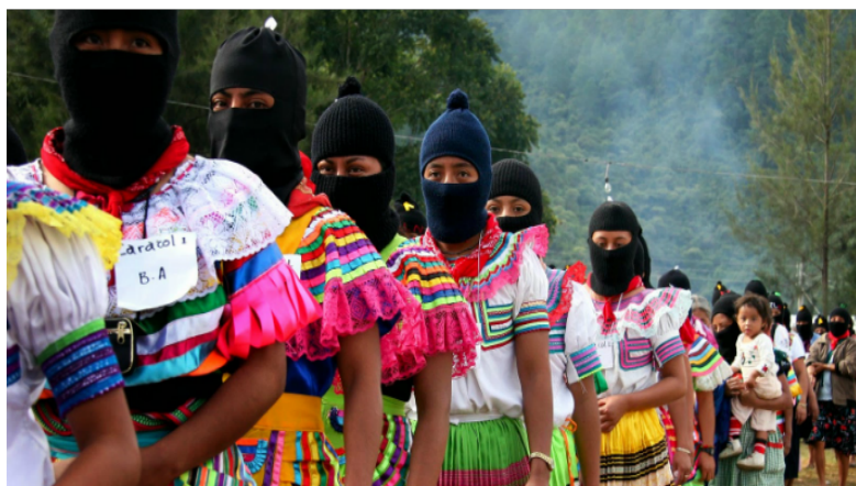
Figure 4. Indigenous and mestiza women in the Ejército Zapatista de Liberación Nacional Zapatista Army of National Liberation (EZLN) in the mountains of Chiapas, Mexico. 17 Nov 1983.

Pussy Riot expresses their Zapatismo when they choose to wear balaklavas . Like the Zapatistas, they have expressed a desire to place their work in solidarity with other oppressed groups. Some Pussy Riot supporters, myself included, were introduced to them prior to seeing either the “Punk Prayer” music video or the cathedral video. I first learned about Pussy Riot through their interviews and articles quoting their articulate statements. Encountered in this way, the reception of the video is shaped by the words the performers use to self-define their work and intentions. The same can be said for their statements in court. As The New York Times notes, “Pussy Riot’s unapologetic court statements revealed an intellectual and philosophical rigor” (Ryzik). In her closing statement in court, Maria Alyokhina connects Pussy Riot’s plight to that of free thinkers throughout history.