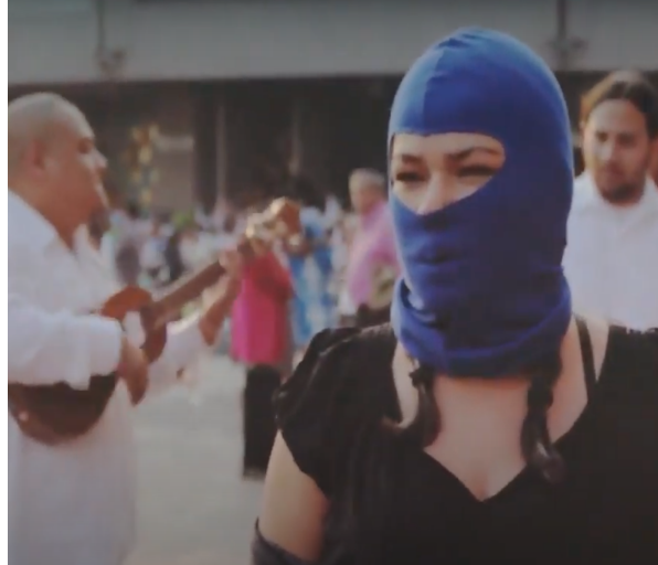
Figure 7. Mexican singer in a blue Zapatista mask. Behind her are the musician accompanying her. They wear traditional white guayabera shirts. Screenshot from #Freepussyriot México

The viewer then sees a crowd of people entering the basilica carrying a statue of the Virgin Mary. This cuts to scenes of the three singers singing outside the basilica, unmasked. They sing the following lyrics: