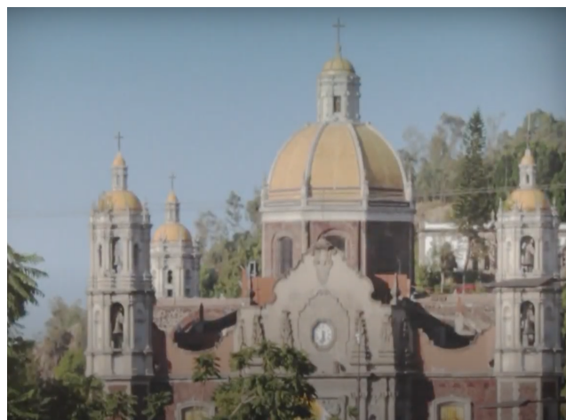
Figure 6. Basílica de Nuestra Señora de Guadalupe , Mexico City. Screenshot from #Freepussyriot México

This initial image demonstrates the magnitude of power held by the religious institutions both sets of women are engaging. The image is the first to demonstrate a connection between the three women in Mexico and the three incarcerated women in Russia. One key difference here is