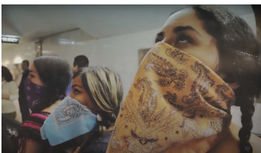
Figure 8. Singers wearing brightly colored bandanas. Screenshot form #FreepussyRiot Mexico Screen shot from #Freepussyriot México

The singers are then filmed inside of the basilica, not singing but viewing the image of the Virgin and standing next to candles lit in her honor. Still wearing their traditional skirts and blouses, they now each wear a different brightly-colored bandana over their nose and mouth. This imagery also alludes to EZLN, (Ejército Zapatista de Liberación Nacional/ The Zapatista Army of National Liberation), but in a more colorful or Pussy Riot-esque form. The Zapatista bandanas are usually red or black mimicking the red star against the solid black ground on the EZLN flag. Concealing one's identity with a bandana points to the celebrated Mexican image of the revolutionary who is considered a "bandit" or "outlaw"—terms which could be used to describe members of Pussy Riot.