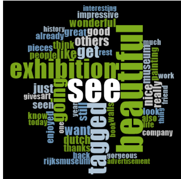
Figure 7: Social Media, Word Frequency Including Synonyms

When adjusted to include synonyms the most frequently occurring word was ‘see,’ followed closely by ‘beautiful.’