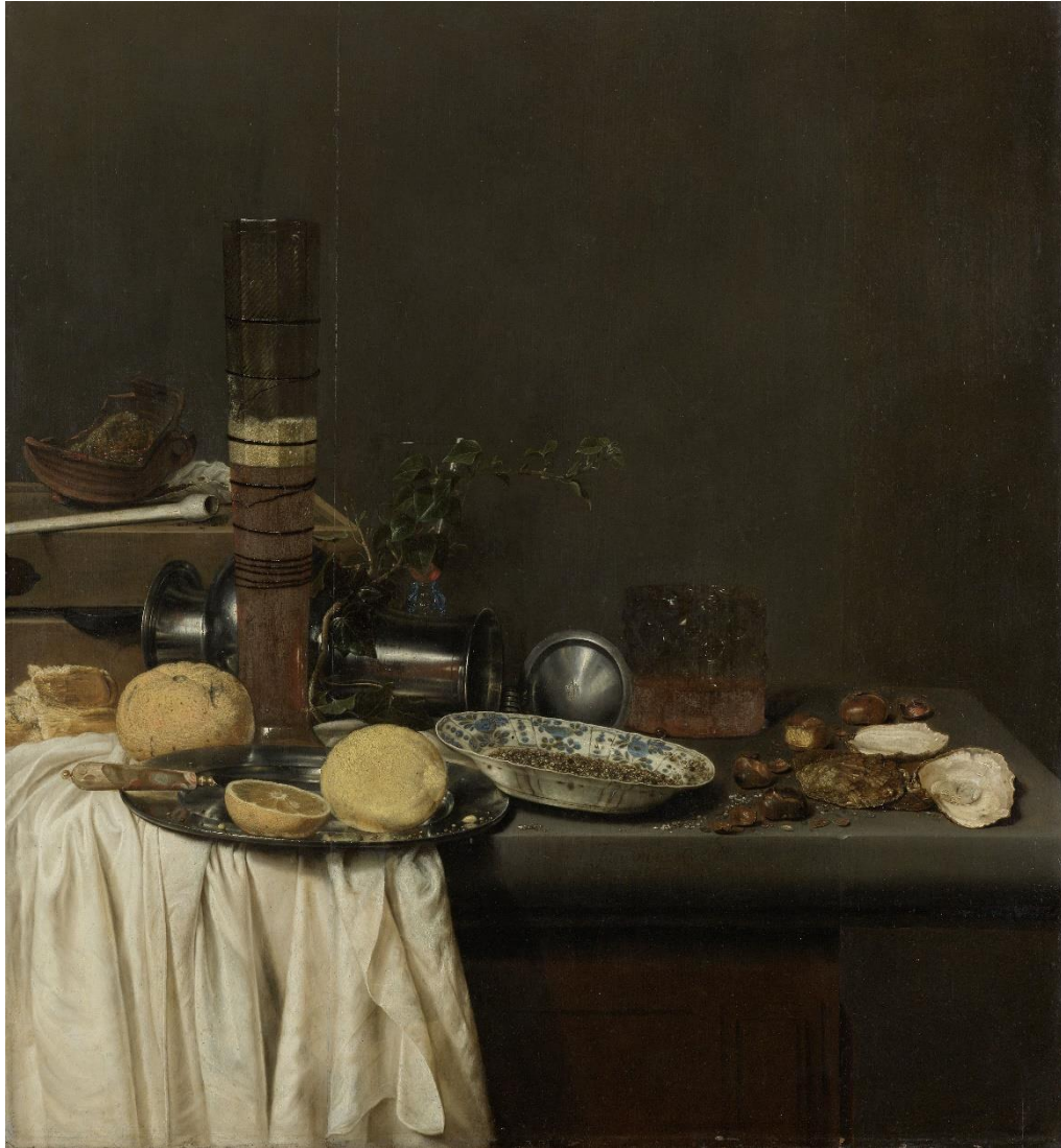
Figure 1: Still Life with Beer Glass, Porcelain Dish, and Pepper , Jan Jansz. van de Velde (III) 1647.

selected was Still Life with Beer Glass, Porcelain Dish, and Pepper , painted by Jan Jansz. van de Velde (III) in 1647. 13