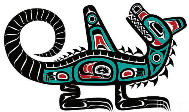
Wasgo Sea Wolf art print by Beltschazar

The wasgo, or sea wolf, is a mythological creature of the indigenous people of the Pacific Northwest coast of Canada. It is part whale and part wolf.