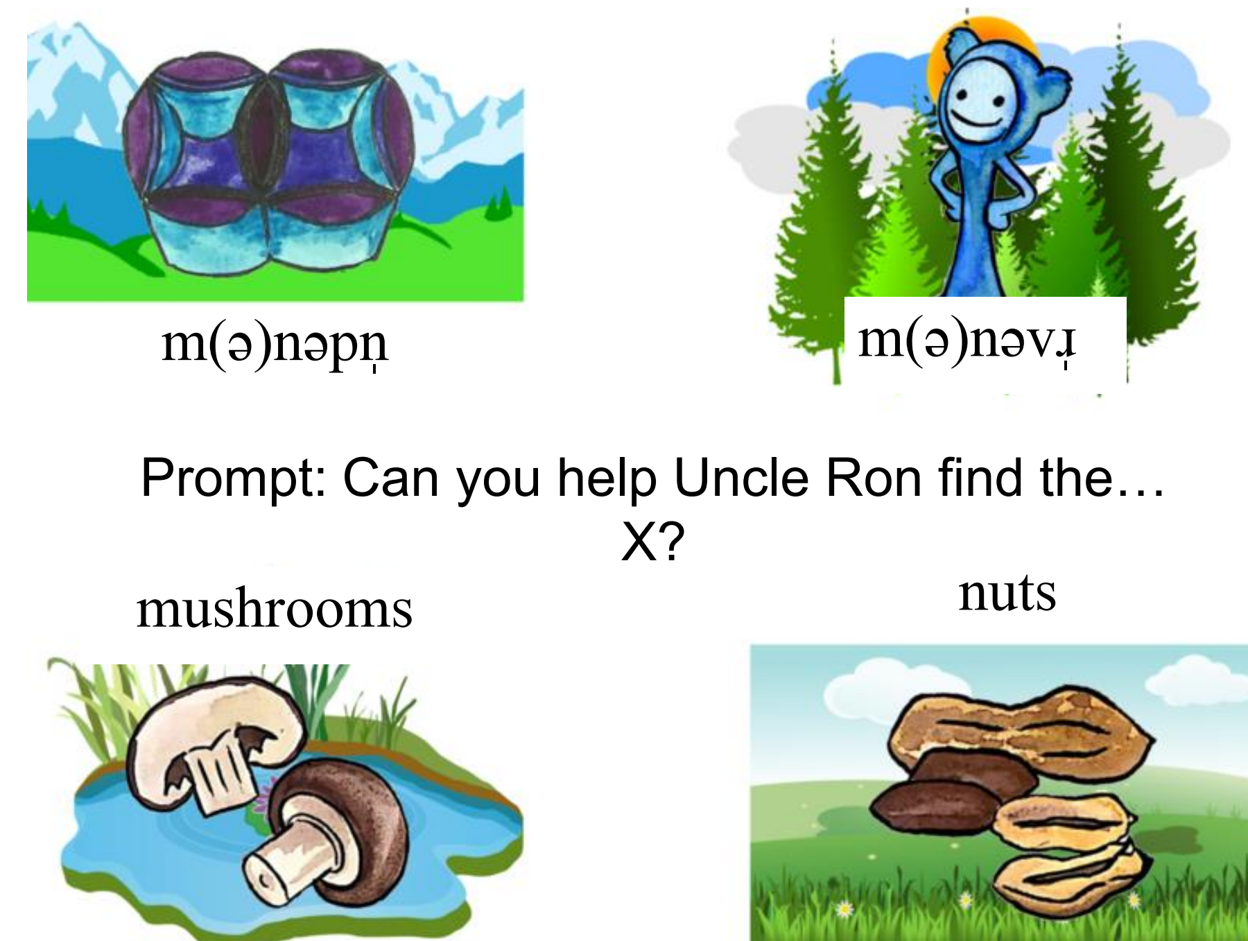
Figure 3. Gaze tracking trial for perception analysis. The narrated prompted is presented in text in the middle. Note that no text is present in the actual experiment.