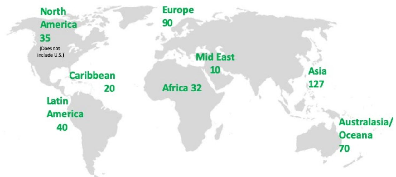
Figure 1- Representation of International Regions Among CMJ Articles

Total international representation, broken down by region, in terms of number of publications