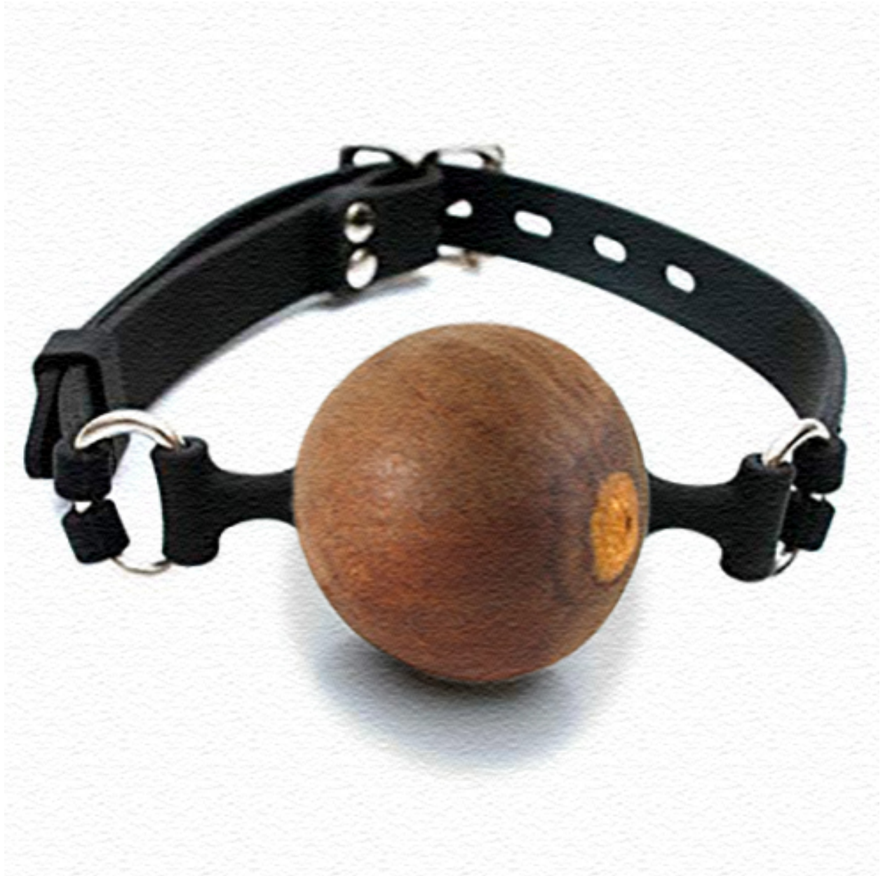
Gift Wrapped Avocado | 2019 | gag, avocado pit