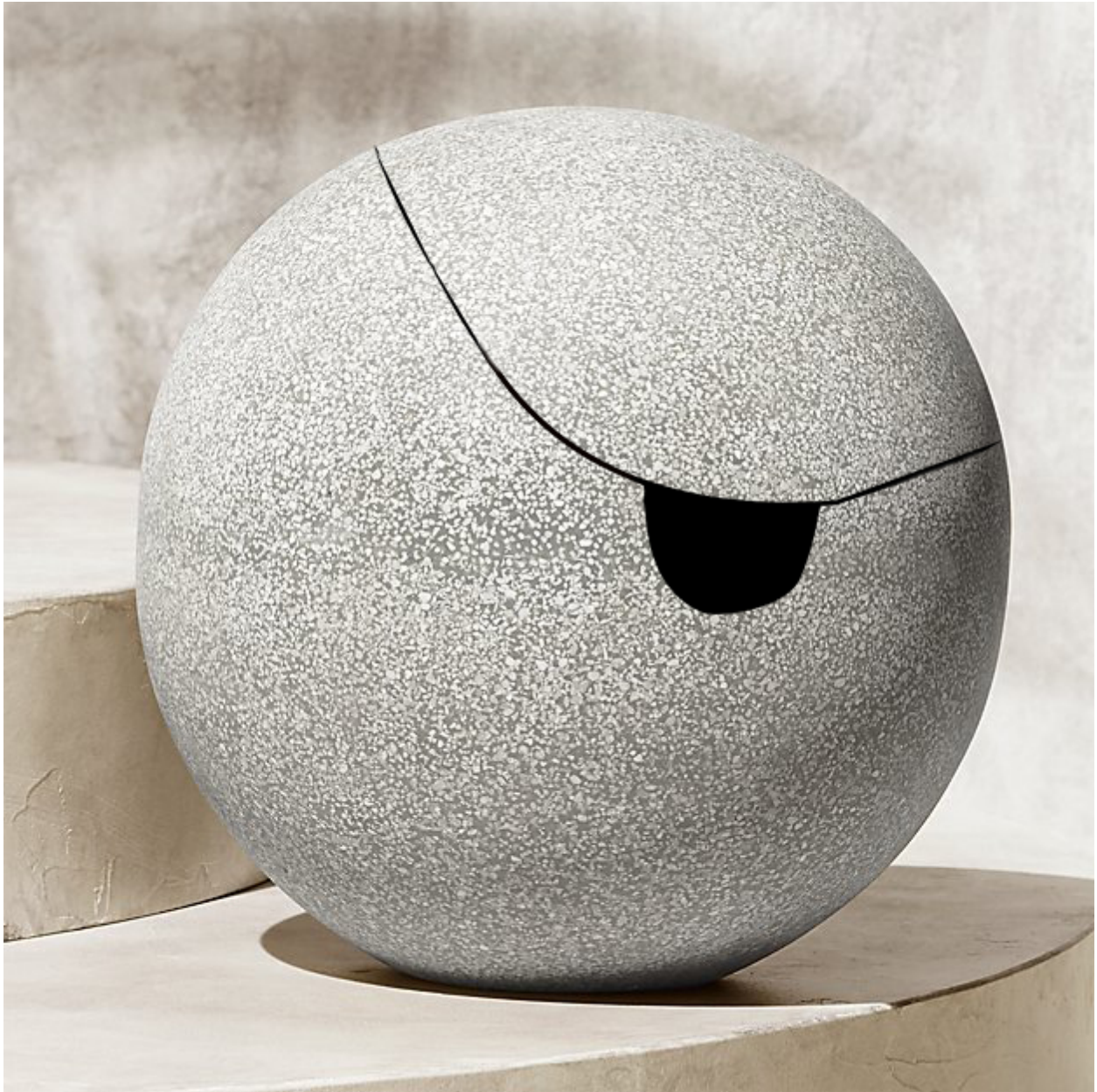
Playa Grey Large Terrazzo Ball CB2 Exclusive | 2019 | Made in Vietnam | stone/resin blend, eye patch that has been absorbed into the art object making it iconic.