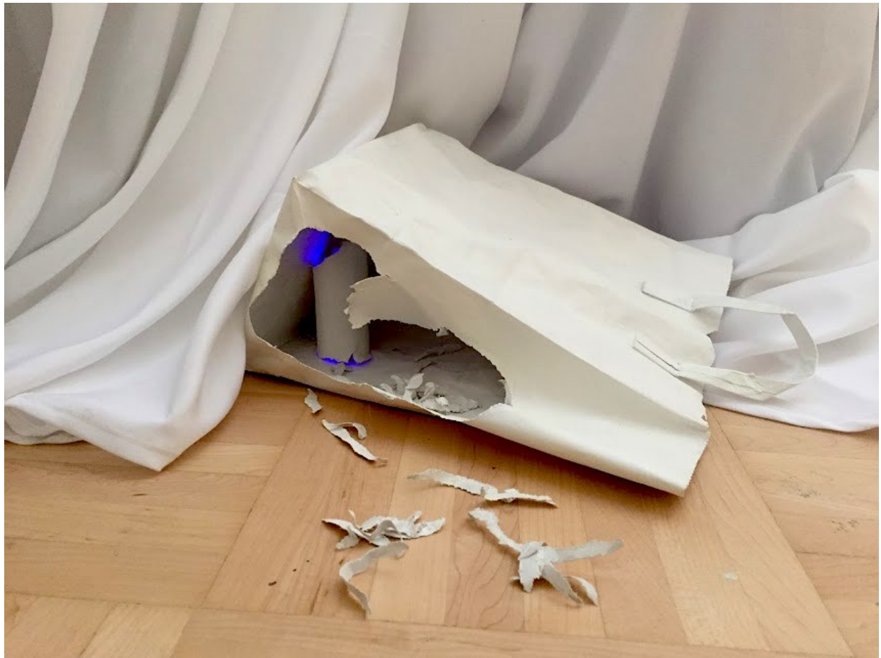
Baybee's Architectural Beacon | 2019 | paper bag, toilet paper roll, paint, LED light, dropping