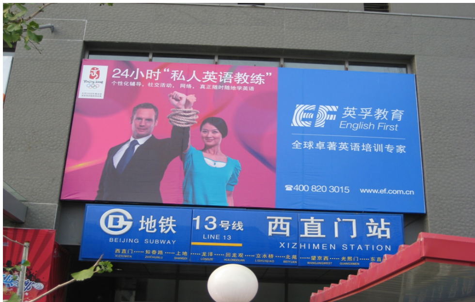
Figure 2: English First print advertisement on a billboard above a subway entrance in Beijing

spectacle in Beijing as this is the capital of the nation where one encounters countless foreign faces. The advertisement, with the smile and confidence on the faces of this young couple and their slightly fisted hands, can also be innocently interpreted as international cooperation between the “East” and “West” through learning English, or the determination to conquer English together. Posters showing people of different colors walking side by side or hand in hand either as state propaganda or as commercial advertisements are a common scene in Beijing. But why the rope? With a closer look at the ad copy, combined with the deliberately staged rope binding, one cannot help thinking about other possible interpretations.