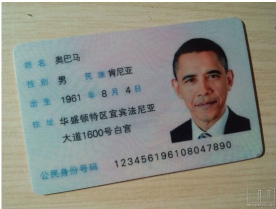
Figure 5: A prank on a Chinese website to demonstrate the "new generation" (Second Generation) ID Card with U.S. president Barack Obama's image (On it reads (in translation): Name: Aobama; Gender: Male; Ethnicity: Kenyan; Date of Birth: August 4, 1961; Address: Pennsylvania Ave 1600, White House, Washington DC; ID number: 123456196108047890).