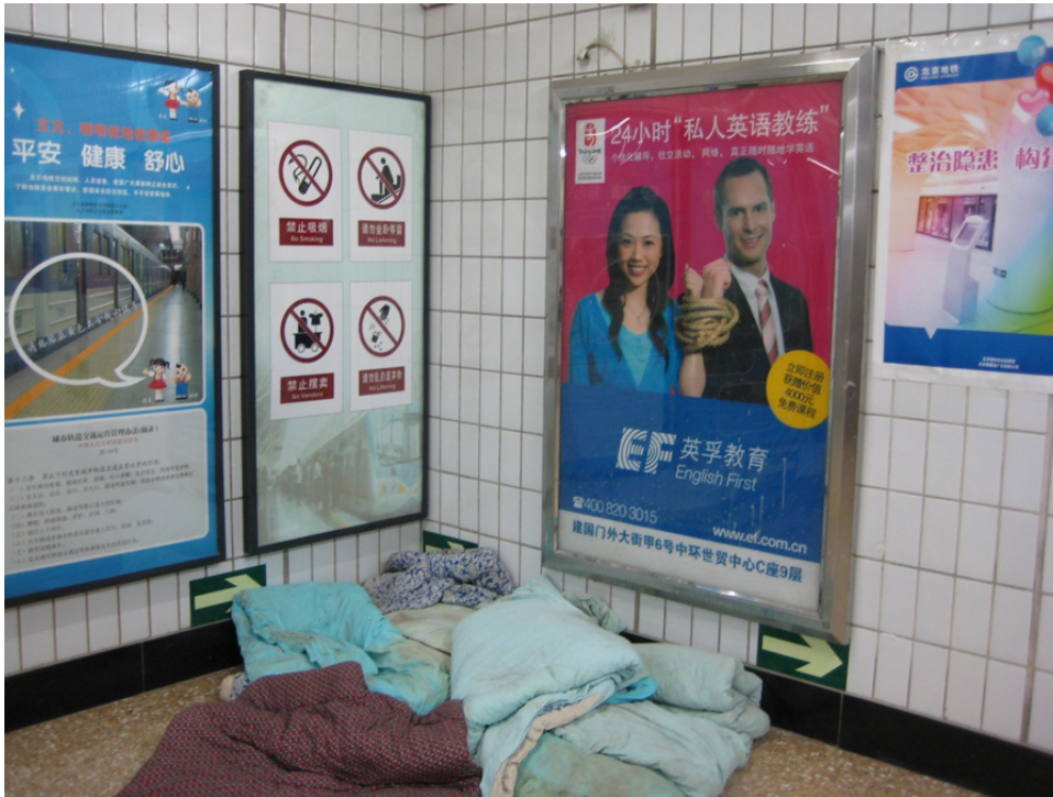
Figure 3 Another advertisement by EF in a subway in Beijing

To understand the other interpretations, one must denaturalize the taken-for-granted raced, gendered, classed, and sexualized meanings that are associated with English learning in China and think about what the target audience of this advertisement would be. When I showed these pictures to my research participants and asked them to describe the image, although they had different interpretations, their first response was always: “Oh, this is a Chinese woman learning English from an American man.” I wondered about the naturalization of the link between skin color and English speaking ability in this answer. China is a predominantly Han Chinese society with 92 percent of the population classified as Han and foreigners seeking Chinese citizenship are still very rare. The foreign face of this white man is generally understood as the non-Chinese in this advertisement and the Asian-looking woman is the Chinese national. Unlike the U.S. context, where people of different colors are often shown together to