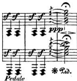
Example 2.18. Carnaval , Op. 9, Paganini, mm. 35-37.