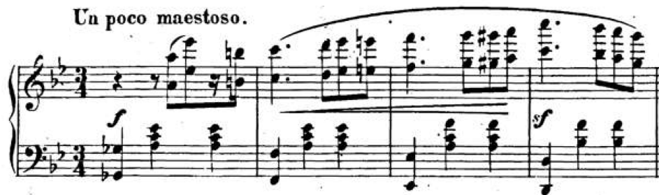
Example 2.7. Carnaval , Op. 9, Valse noble, mm. 1-4.

Movement 4, titled Valse noble , has the ASCH motive as its opening, but quickly becomes increasingly passionate and amorous as the motive is expanded throughout the movement. 301 This movement is a disfiguration of the waltz and is a humorous “great Viennese Waltz.” 302