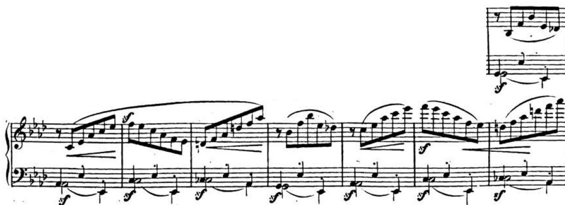
Example 2.3. Carnaval , Op. 9, Preambule, mm. 91-98.

Also, the main “E \flat -F-E \flat -C-A \flat ” motive is, at the presto, distorted in augmentation and employed over a resting on the tonic. This disfiguration is shown in Example 2.4.