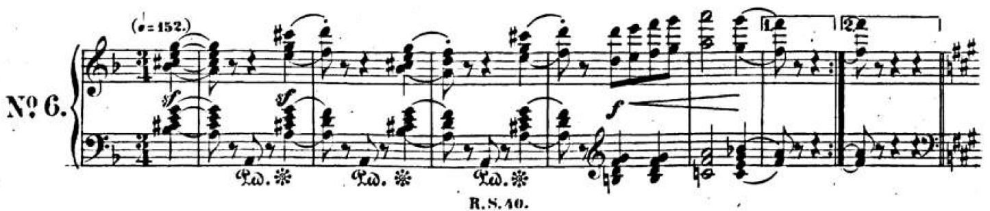
Example 1.6. Papillons , Op. 2, Sixth Mvmt., mm. 1-7.

“footnote,” just like Jean Paul used actual footnotes to force the reader to look up and down when reading. These musical leaps create a sense of instability and disjointedness, while forcing the listener to pay attention. Additionally, the jumping movements of playing hands physically mimic the sudden movements of reading eyes. Second, Schumann implements a Romantic distance concept by honoring past forms and past compositional techniques, in this case, Beethoven’s.