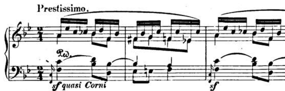
Example 2.14. Carnaval , Op. 9, Papillons, mm. 1-3.

Movement 10, Papillons , is a direct reference to Jean Paul's Flegeljahre . As discussed earlier, "papillons" means butterfly in French; and just as a butterfly goes through a