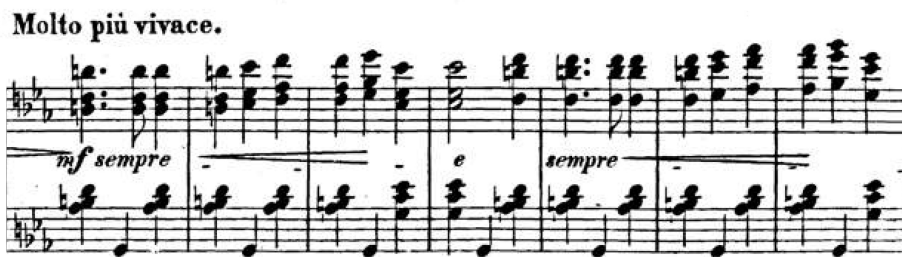
Example 2.19. Carnaval , Op. 9, Marche des “Davidsbundler” contre les Philistins, mm. 25-31.

In measure 83, material from the Preamble is again used which shows a conclusion of the trajectory of continuing themes throughout the work. Also, marked “vivo” in measure 99, the material from the Pause and also the Preamble is no longer functioning as introductory material.