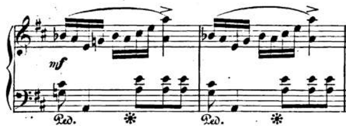
Example 1.10. Papillons , Op. 2, 11 th Mvmt., mm. 12-13.