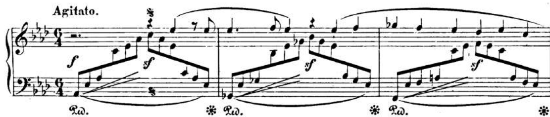
Example 2.16. Carnaval , Op. 9, Chopin, mm. 1-3.

Movement 12, Chiarina , is a passionate reference to Clara Wieck. In terms of musical form, this movement manipulates the main ASCH motive by stretching it incrementally as the phrases progress on: the ASCH motive is progressively becoming more and more disfigured as Carnaval continues.