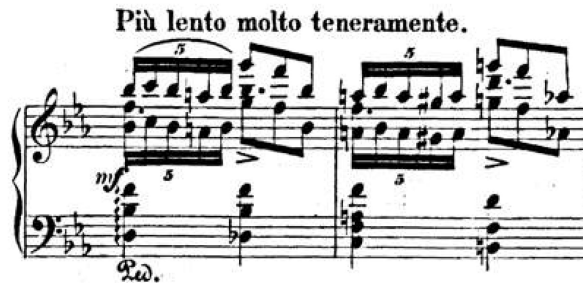
Example 2.9. Carnaval , Op. 9, Eusebius, mm. 17-18.