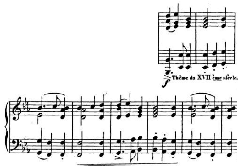
Example 2.20. Carnaval , Op. 9, Marche des “Davidsbundler” contre les Philistins, mm. 51-58.

The movement ends similarly to the ending of the Preamble which creates a bookending effect that triumphantly heralds the Davidsbündler’s win over the Philistine.