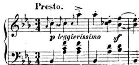
Example 2.15. Carnaval , Op. 9, ASCH-SCHA, mm. 1-2.

Movement 11, titled ASCH-SCHA provides a return back to waltz rhythms and a continuation of motivic transformation. Schumann writes the ASCH theme as grace notes (shown in Example 2.15) at this moment of Carnaval as a way to purposefully digress from convention. Musical grace notes are normally a decoration or ornamentation of existing notes and, in regards to melodic contour, they are not generally a crucial aspect of the line. The “sphinxes” of the previous movement effectively provide the ASCH theme for Carnaval in the most straightforward way possible. In stark contrast, ASCH-SCHA also presents the main theme but in subtle and non-important grace notes. These grace notes elicit the feeling of a butterfly flitting its wings. 316 Schumann’s manipulation of literary and musical compositional devices continues: when a movement is titled something that would lead us to believe things will be