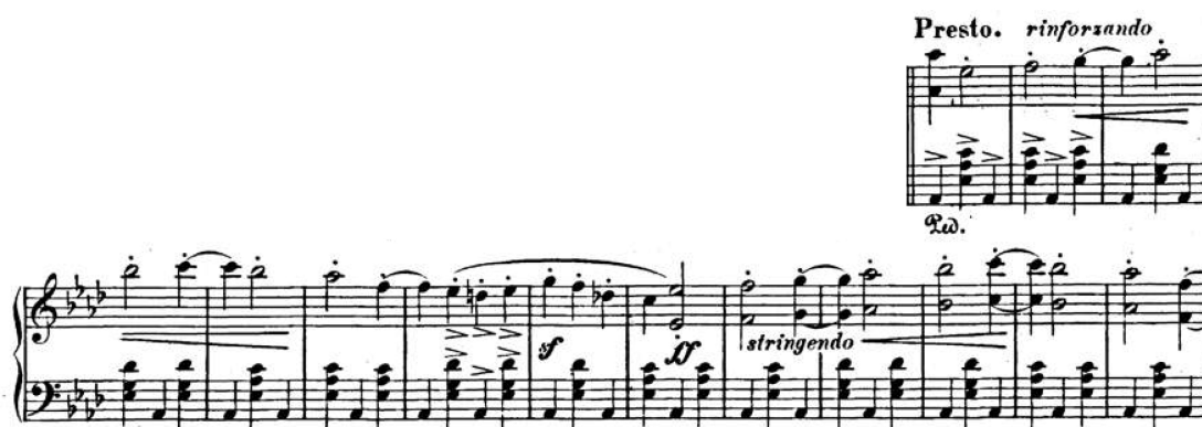
Example 2.4. Carnaval , Op. 9, Preambule, mm. 114-127.

Also, the main “E \flat -F-E \flat -C-A \flat ” motive is, at the presto, distorted in augmentation and employed over a resting on the tonic. This disfiguration is shown in Example 2.4.