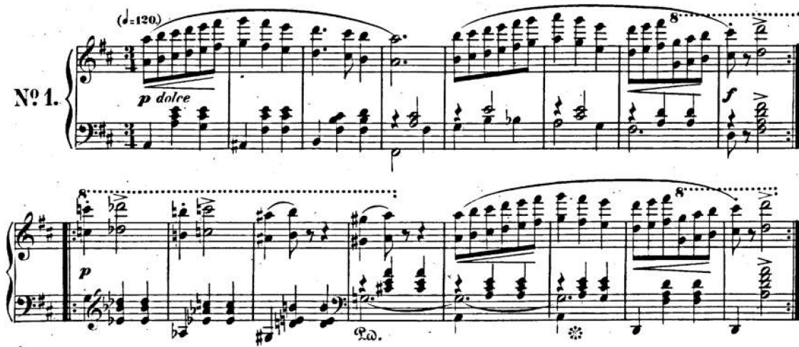
Example 1.2. Papillons , Op. 2, First Mvmt., mm. 1-16.

Although the Introduzione and Movement 1 introduce similar aesthetical emotions, the musical functions of both movements are teleologically intertwined. Schumann initially subverts any tonic key, blatantly avoids resolving the dominant when expected, and subsequently waits until the end of the first phrase to establish a tonic. Not until we hear both movements do we obtain their respective functions: the first movement, eventually providing D major, shows us the true function of the Introduzione as solidifying the dominant. Neither movement would make sense if it were not for the other.