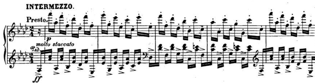
Example 2.17. Carnaval , Op. 9, Paganini, mm. 1-5.

pedal fully depressed. While keeping the pedal down, an E \flat major 7 th chord is depressed slowly enough with the hand so that the notes will not sound but that the dampers will stay raised once the pedal is released. Keeping the hands down, the pedal is finally released which leaves the E \flat major 7 th chord still sounding. As a result, the reverberations from the original four fortissimo chords “play” the E \flat major 7 th chord. According to Norman Carey, Schumann felt that “virtuosity was to be depicted, rather than displayed.” 323 This literary way of depicting virtuosity is shown in Example 2.18. The movement also ends with a direct reiteration of the previous movement’s material, the Valse allemande , making Movements 17 and 18 a pair.