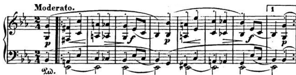
Example 2.5. Carnaval , Op. 9, Pierrot , mm. 1-8.

Movement 2, Pierrot , titled after the sad clown character of the Commedia dell'Arte , is written in a duple meter, indicating a solidification of the manipulation of the waltz form from the previous movement's "correct" compound-metered waltz. Additionally, the ASCH motive occurs in octaves in the right hand as seen in Example 2.5. 296