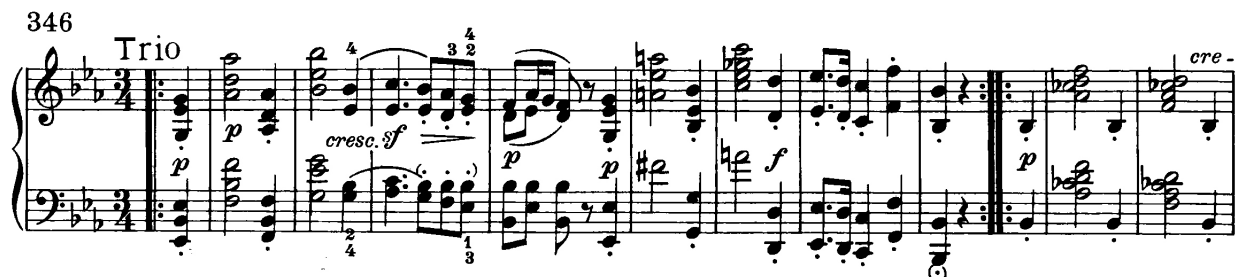
Example 1.7. Beethoven Sonata Op. 31, No. 2: Trio, mm. 1-11.

Romantic irony even finds a way into Movement 6, as Schumann includes an almost humorous quotation of the main theme in octaves at the end of the opening phrase. 256 Perhaps not quite the “cold douches of irony” Jean Paul wrote of, but an interesting use of humor as a compositional technique nonetheless.