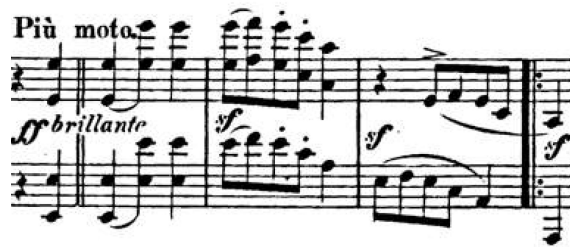
Example 2.2. Carnaval , Op. 9, Preambule, mm. 25-27.

The “E \flat -F-E \flat -C-A \flat ” motive starting in measure 26 is used throughout the rest of the movement (shown in Example 2.2). The fact that it is transfigured and distorted throughout makes it a unifying feature of Carnaval . Additionally, according to Sams, the “E \flat -F-E \flat -C-A \flat ” themes are in both Carnaval and Kreisleriana , Op. 16: through a self-created cipher table, Sams has posited that the meaning behind the motive is actually W-I-E-C-K. 293 These claims however, seem tenuous, as no external information exists from Schumann or contemporaries to directly support the accuracy or validity of Sams’ ciphers. 294