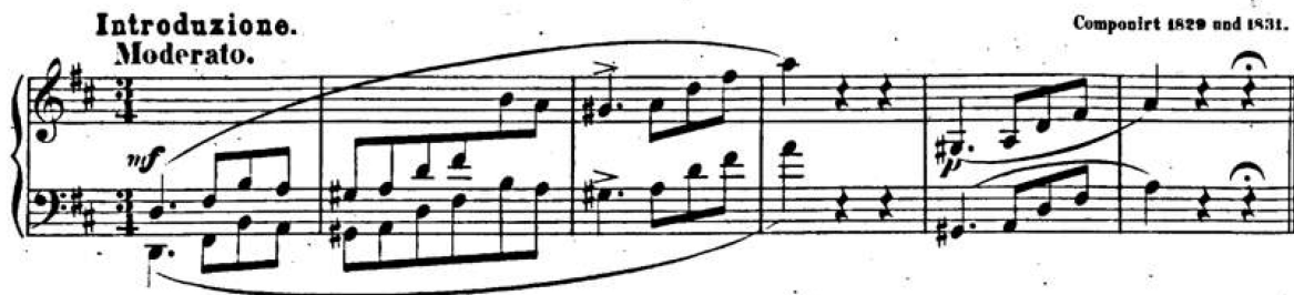
Example 1.1. Papillons , Op. 2, Introduzione, mm. 1-6.

a period of time and the listener has just been invited to join in, much like a storyteller would invite a listener to story time. Additionally, the piece starts “mid-phrase” which is a polymeter quality akin to the continuing effect a dash has in a novel. Second, if it weren’t for the movements’ repeats, the piece could be considered similar to through-composition, which is musically representative of the literary dash as well as polymeter.