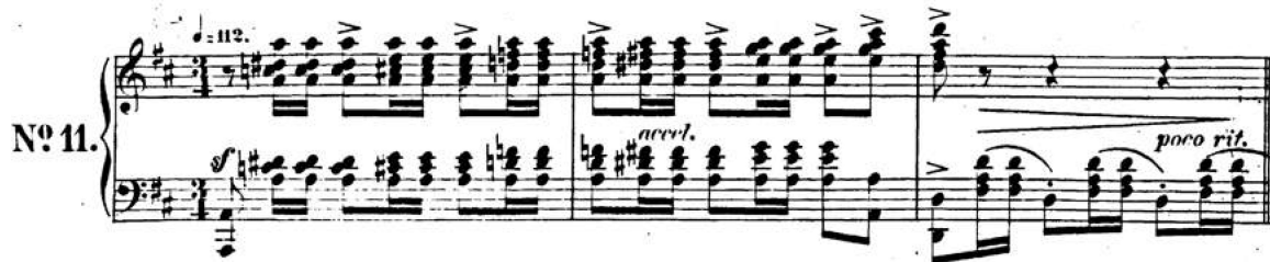
Example 1.9. Papillons , Op. 2, 11 th Mvmt., mm. 1-3.

illustrating Jean Paul's literary influence on Schumann and the importance of recurring themes in his compositional style. All of these details are evidenced in Examples 1.9 and 1.10.