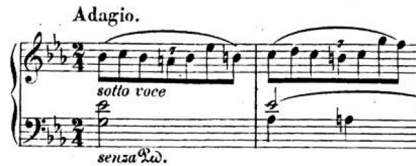
Example 2.8. Carnaval , Op. 9, Eusebius, mm. 1-2.

As shown in Examples 2.8 and 2.9, Schumann is manipulating time to such a degree that an unmetred, improvised musical “infinity” is depicted. 304